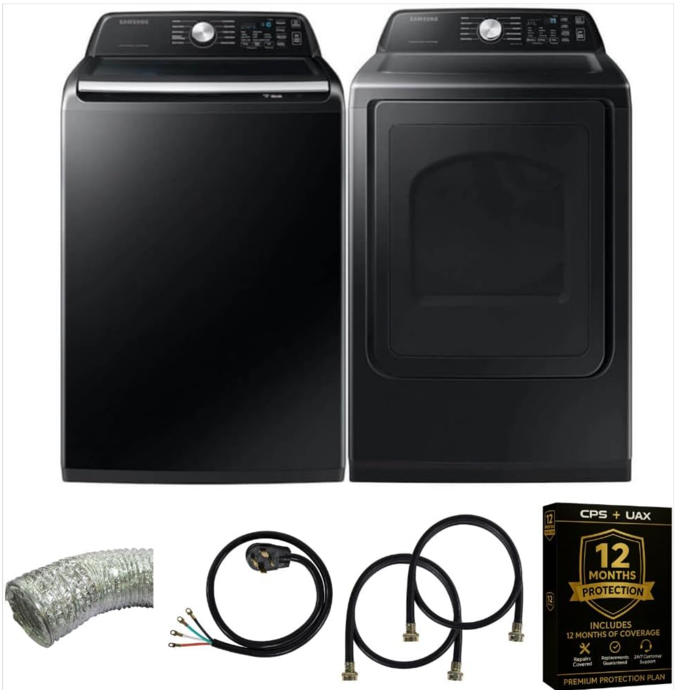
Image: The Samsung washer and dryer units shown with the included installation accessories: 3-prong dryer cord, 4-prong dryer cord, hot and cold water hoses, and an 8-foot aluminum dryer vent.