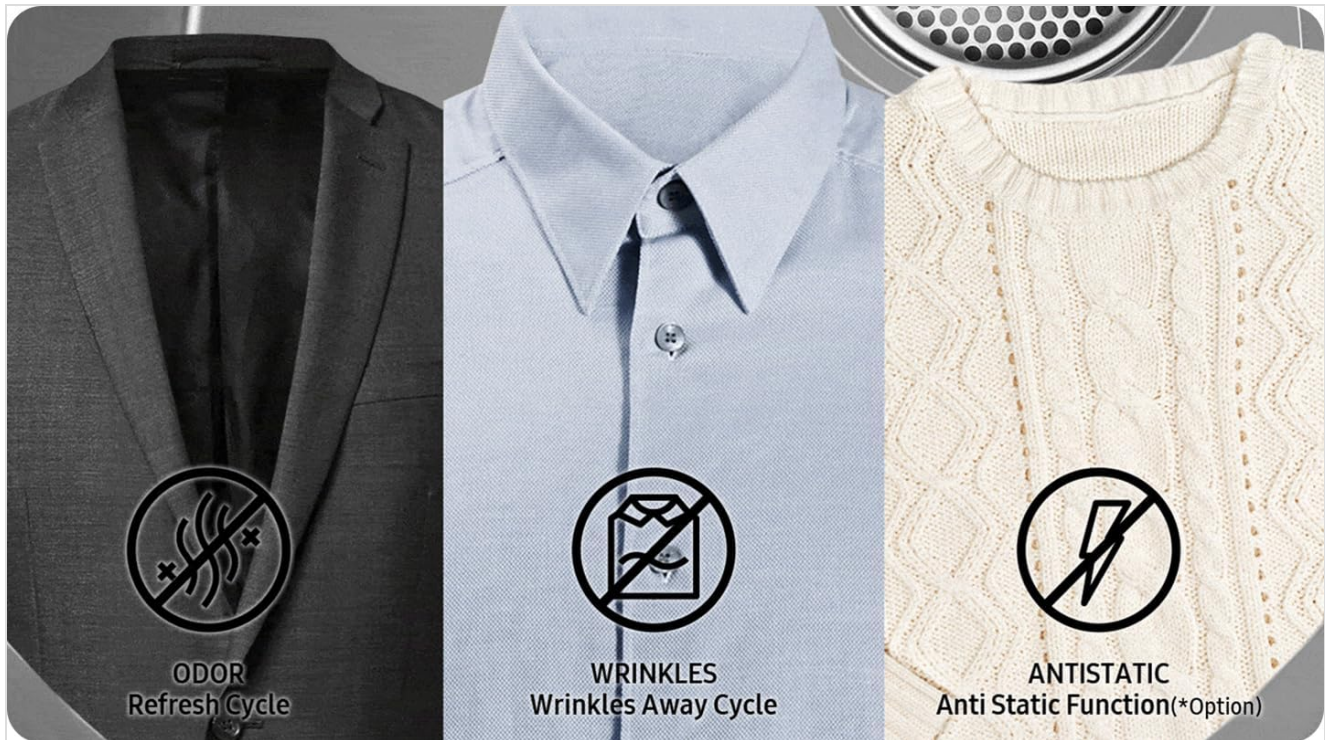
Image: A graphic illustrating three key features of the Samsung dryer: Odor Refresh cycle, Wrinkles Away cycle, and Anti Static function, each with an icon indicating its purpose.

Image: A close-up view of the Samsung electric dryer's interior, illustrating the Smart Sensor technology detecting moisture within the drum during a drying cycle.