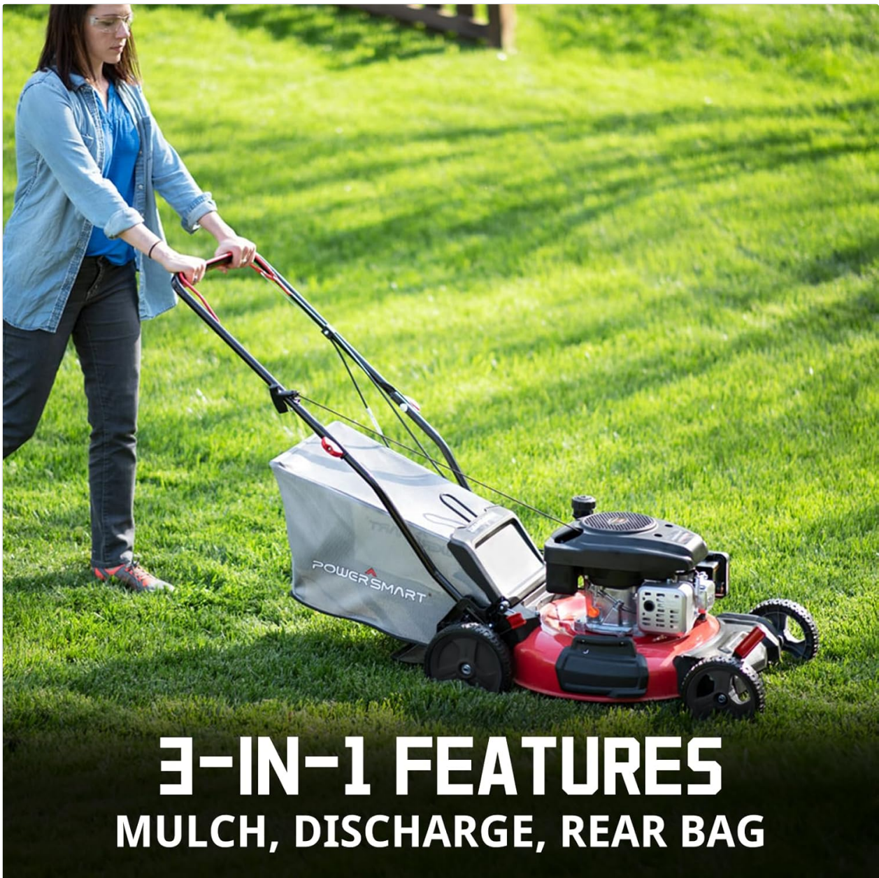
Figure 4.2: A person operating the PowerSmart lawn mower, illustrating its 3-in-1 capabilities (mulch, discharge, rear bag).