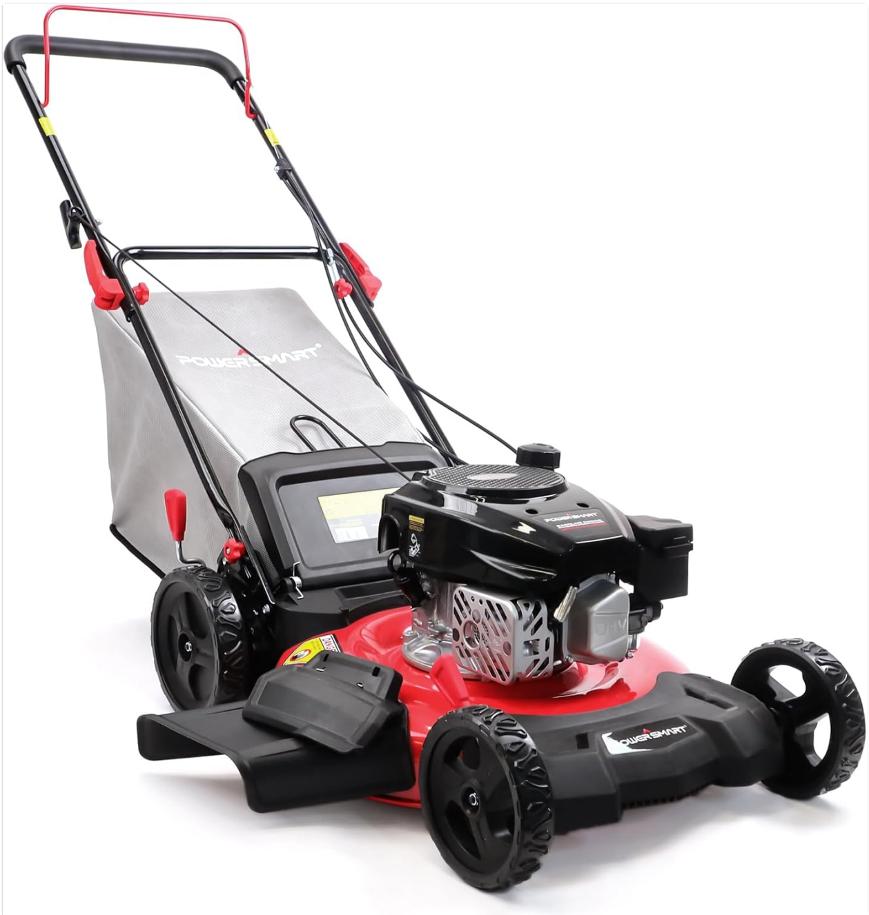
Figure 2.1: Full view of the PowerSmart 21-inch gas lawn mower.

The PowerSmart 21-Inch 144cc Gas Powered Walk-Behind Push Lawn Mower is designed for efficient lawn care. It features a powerful engine and versatile cutting options.