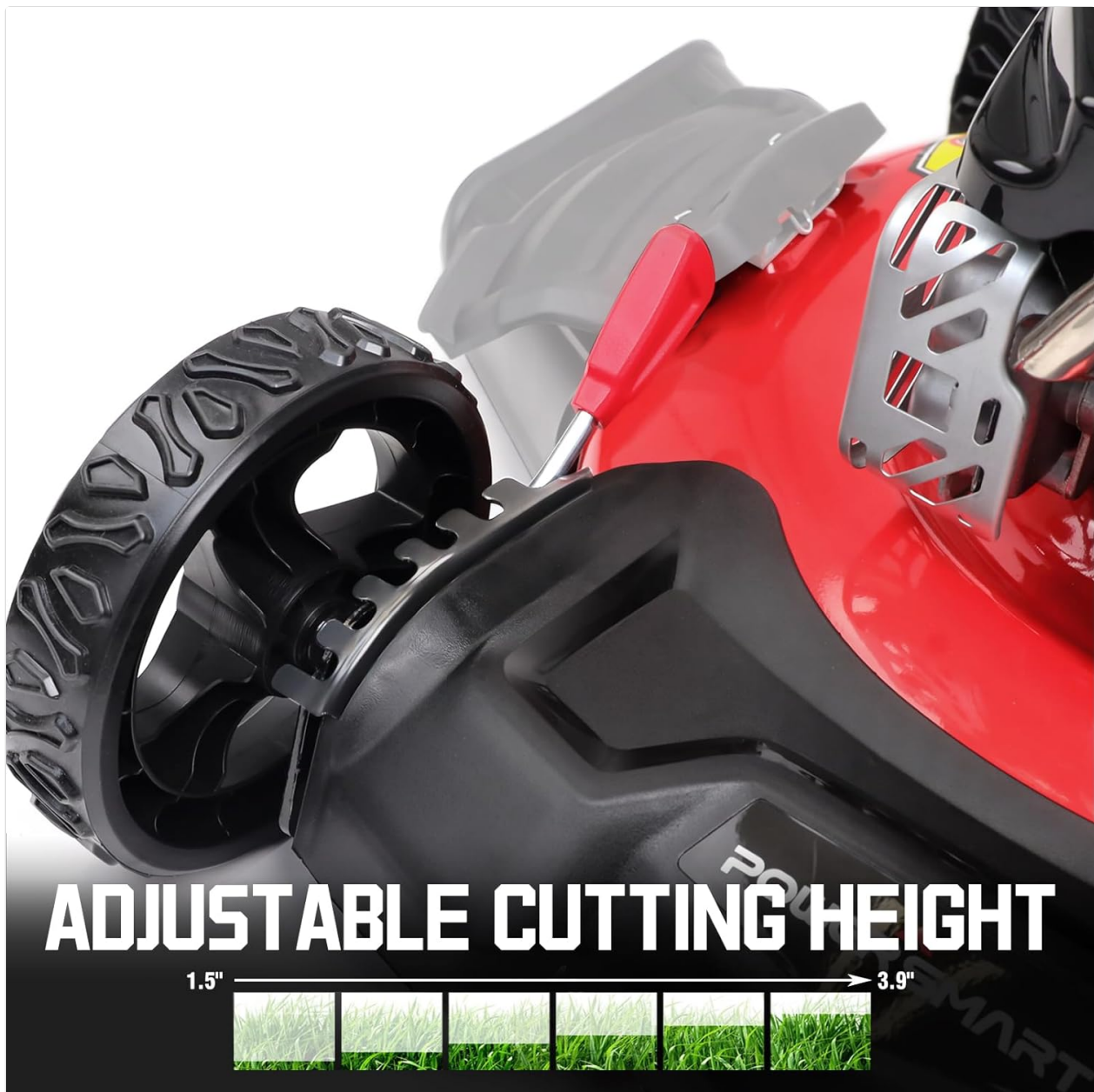
Figure 4.1: Close-up of the dual-lever cutting height adjustment mechanism on the PowerSmart lawn mower.