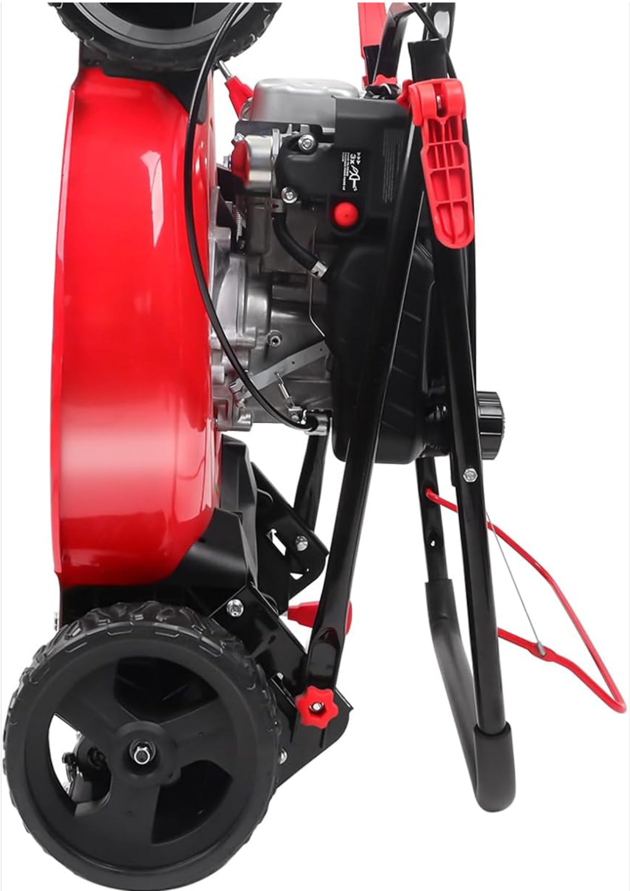
Figure 5.2: The PowerSmart lawn mower stored vertically in a folded position.