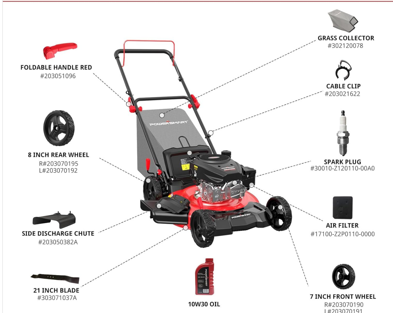
Figure 3.1: Exploded diagram showing various parts of the PowerSmart lawn mower, including the grass collector, spark plug, air filter, and wheels.