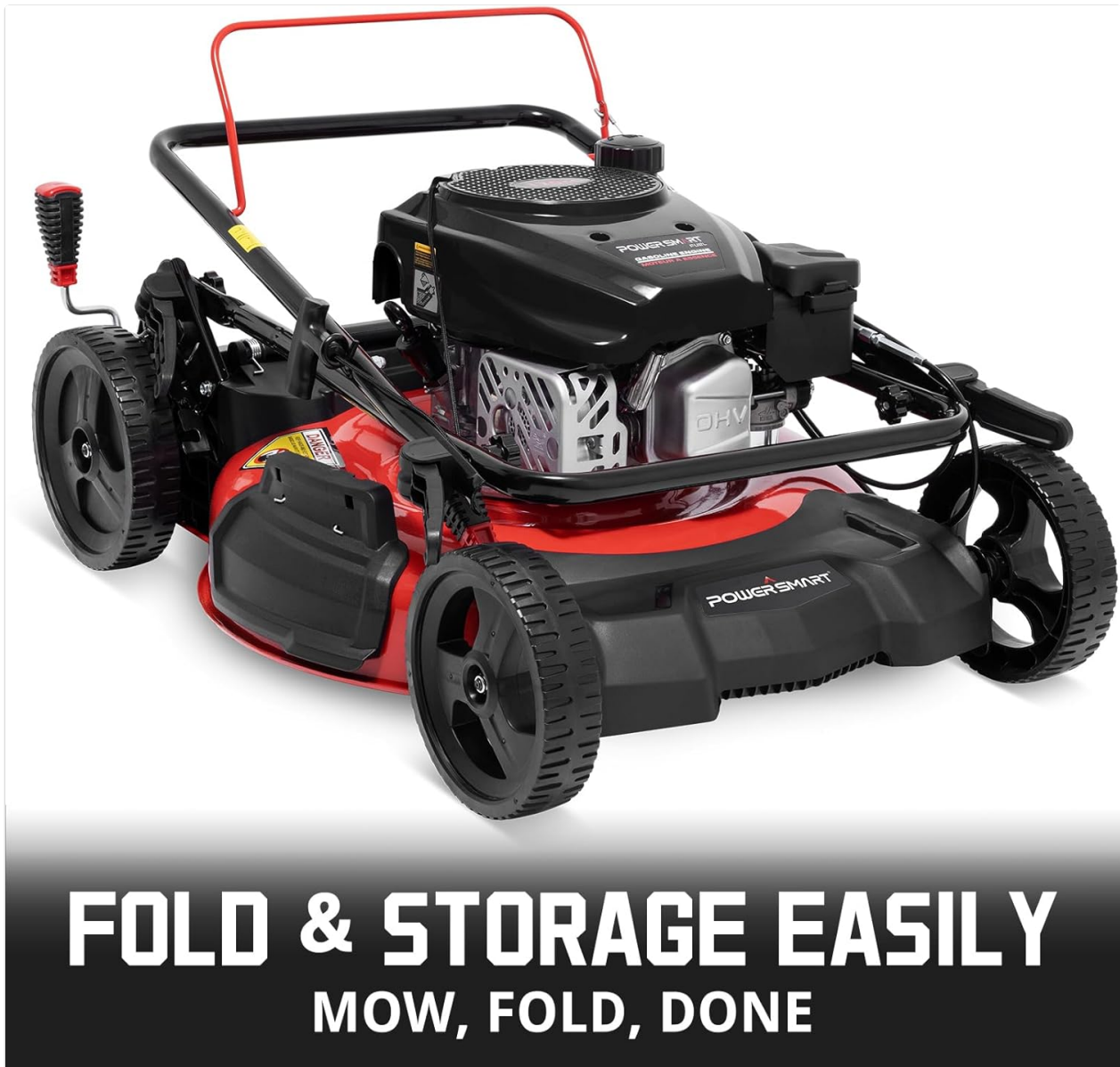
Figure 5.1: The PowerSmart lawn mower with its handle folded for compact storage.

Proper storage protects your mower during off-season periods.