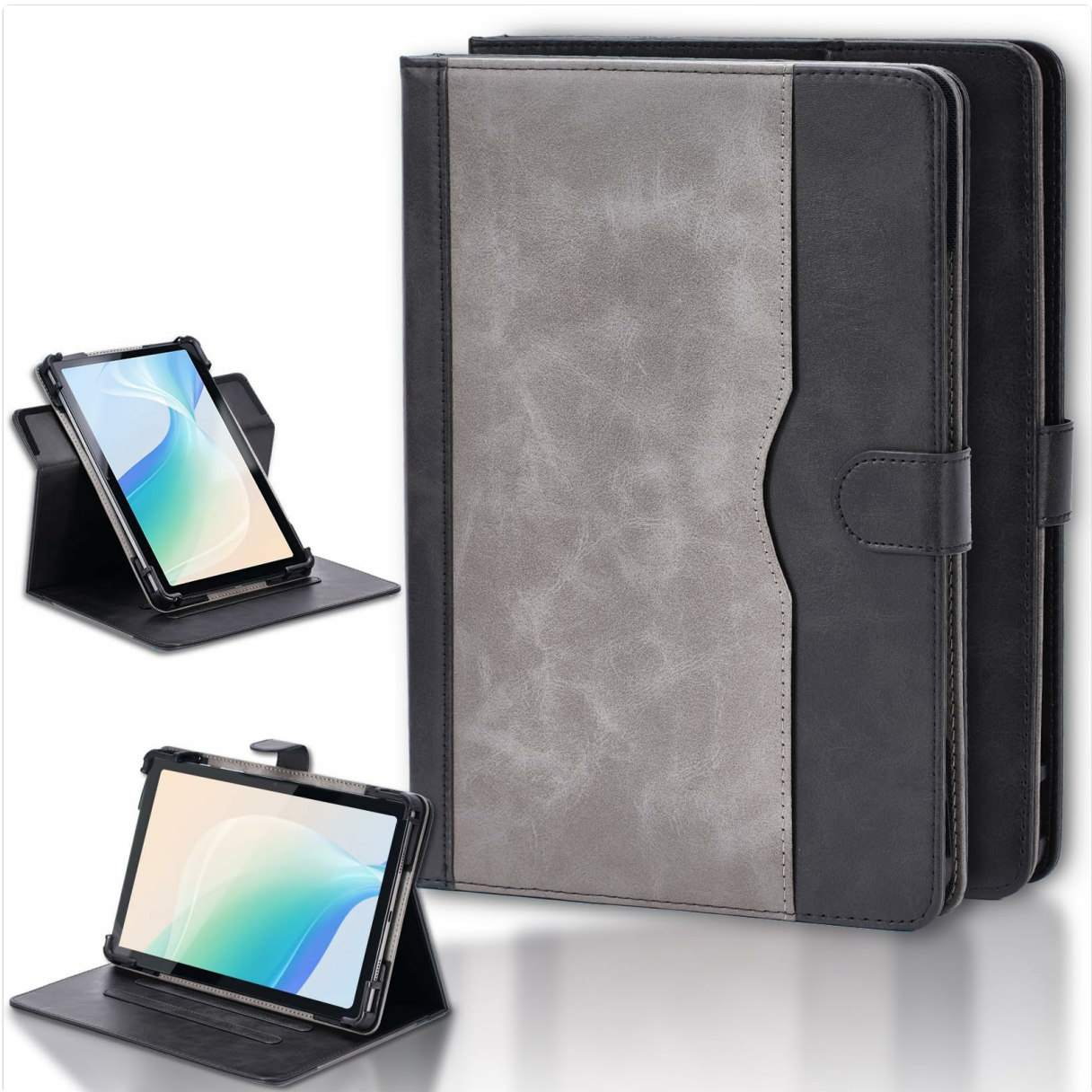
Image: Illustration of the 360-degree rotation and adjustable viewing angles.