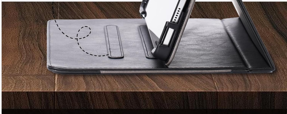
Image: The anti-slip stripe ensures the tablet remains stable in stand mode.