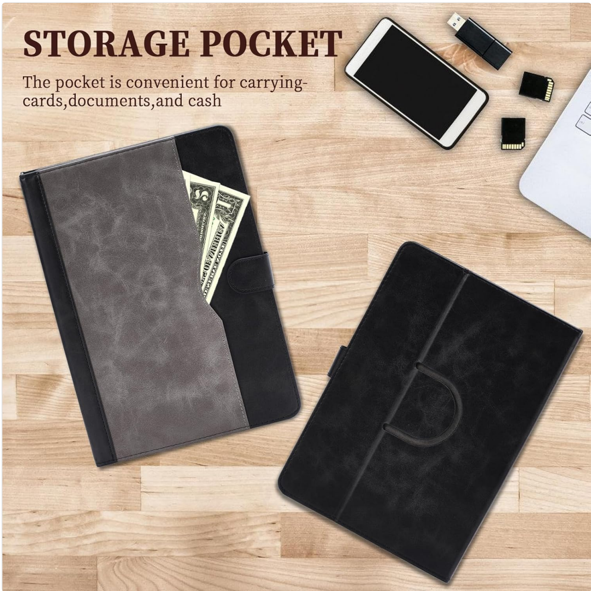
Image: The integrated storage pocket for convenience.

The pocket is convenient for carrying cards, documents, and cash