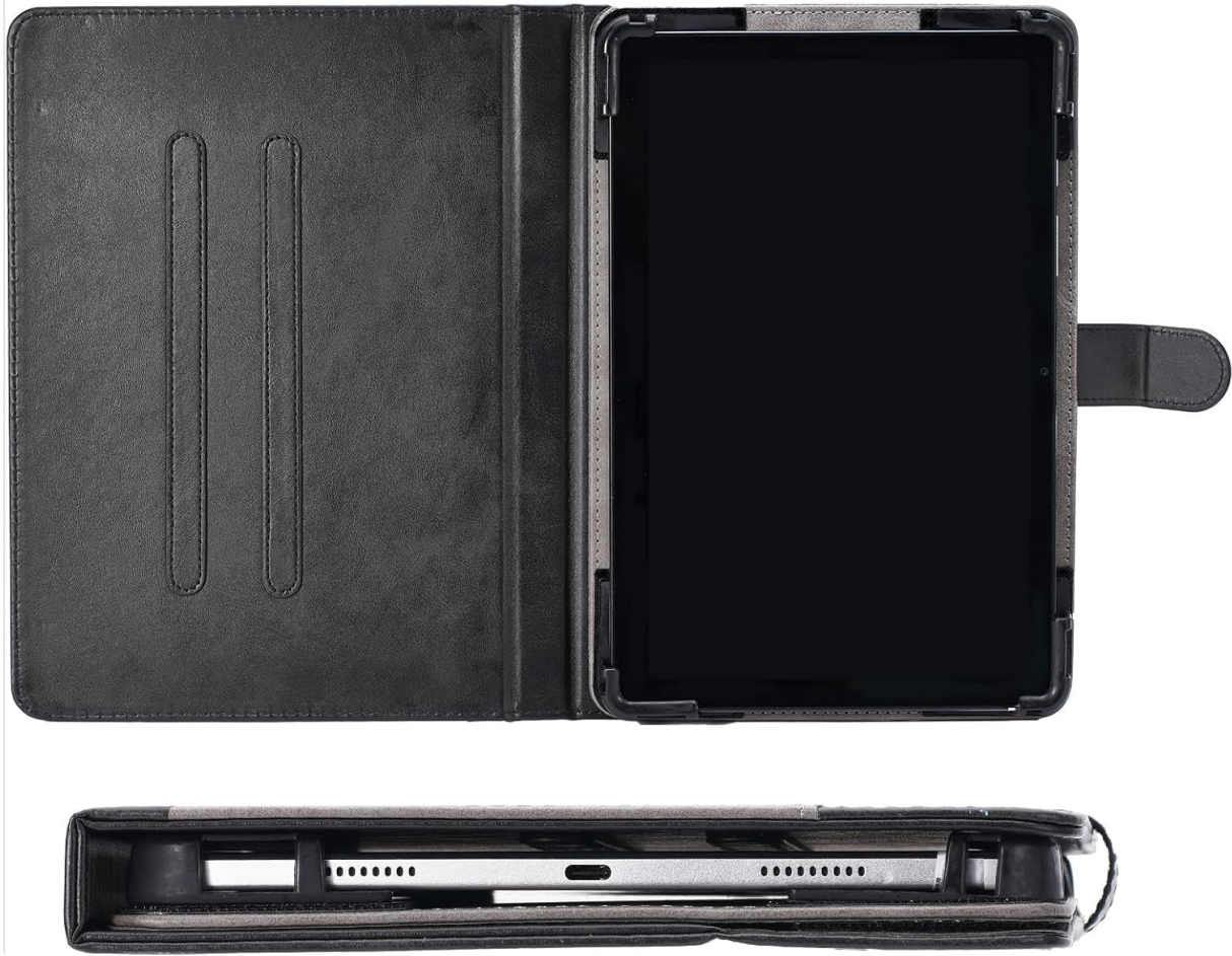
Image: Tablet securely fitted within the case, demonstrating proper installation.

Please kindly check your tablet size before purchase as shown