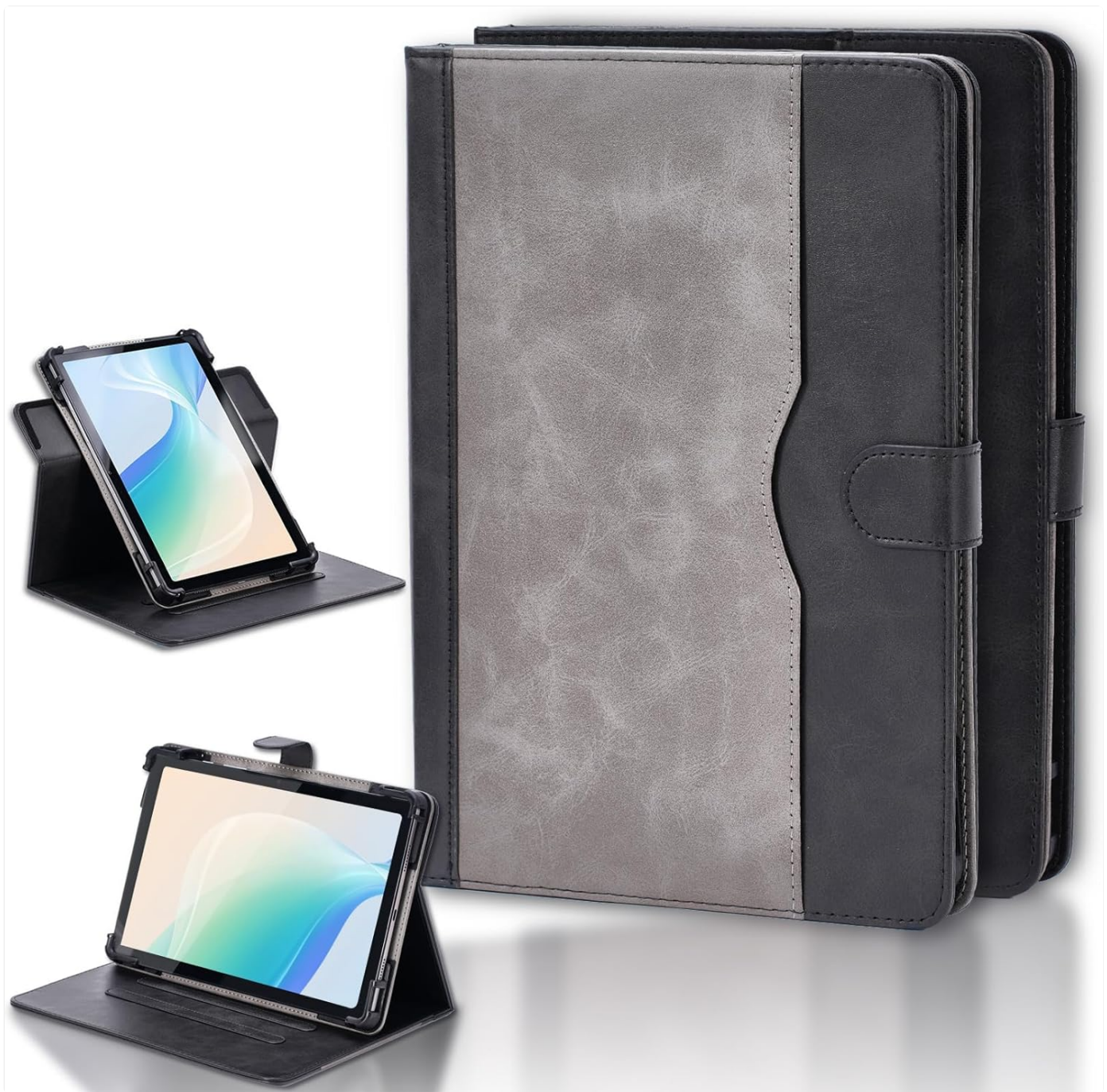
Figure 1: The Kinetijy Case for Logicom Tab XL 14 Tablet, illustrating its design and stand capabilities.