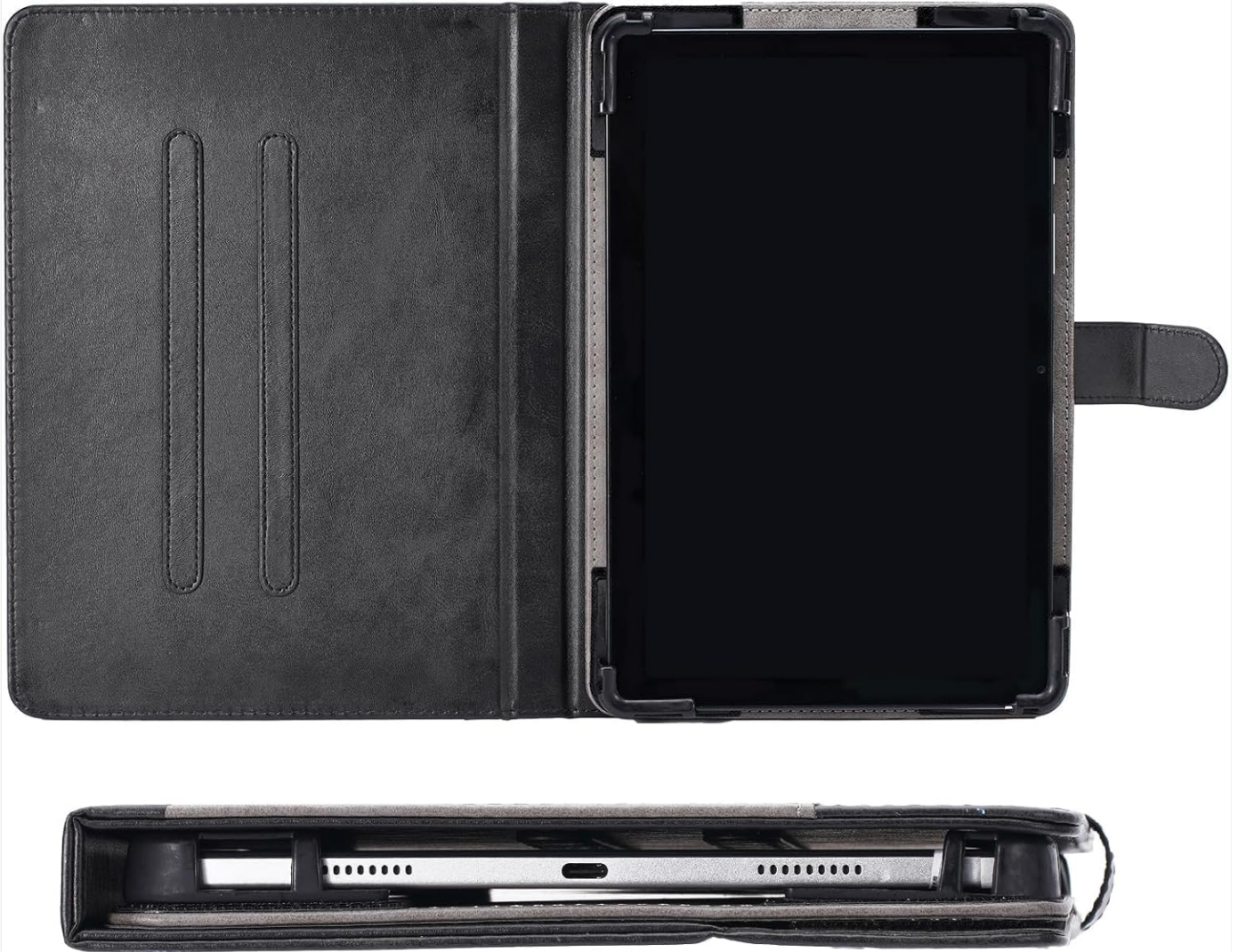
Figure 3: Illustrates the process of inserting the tablet into the protective frame of the case.

Please kindly check your tablet size before purchase as shown