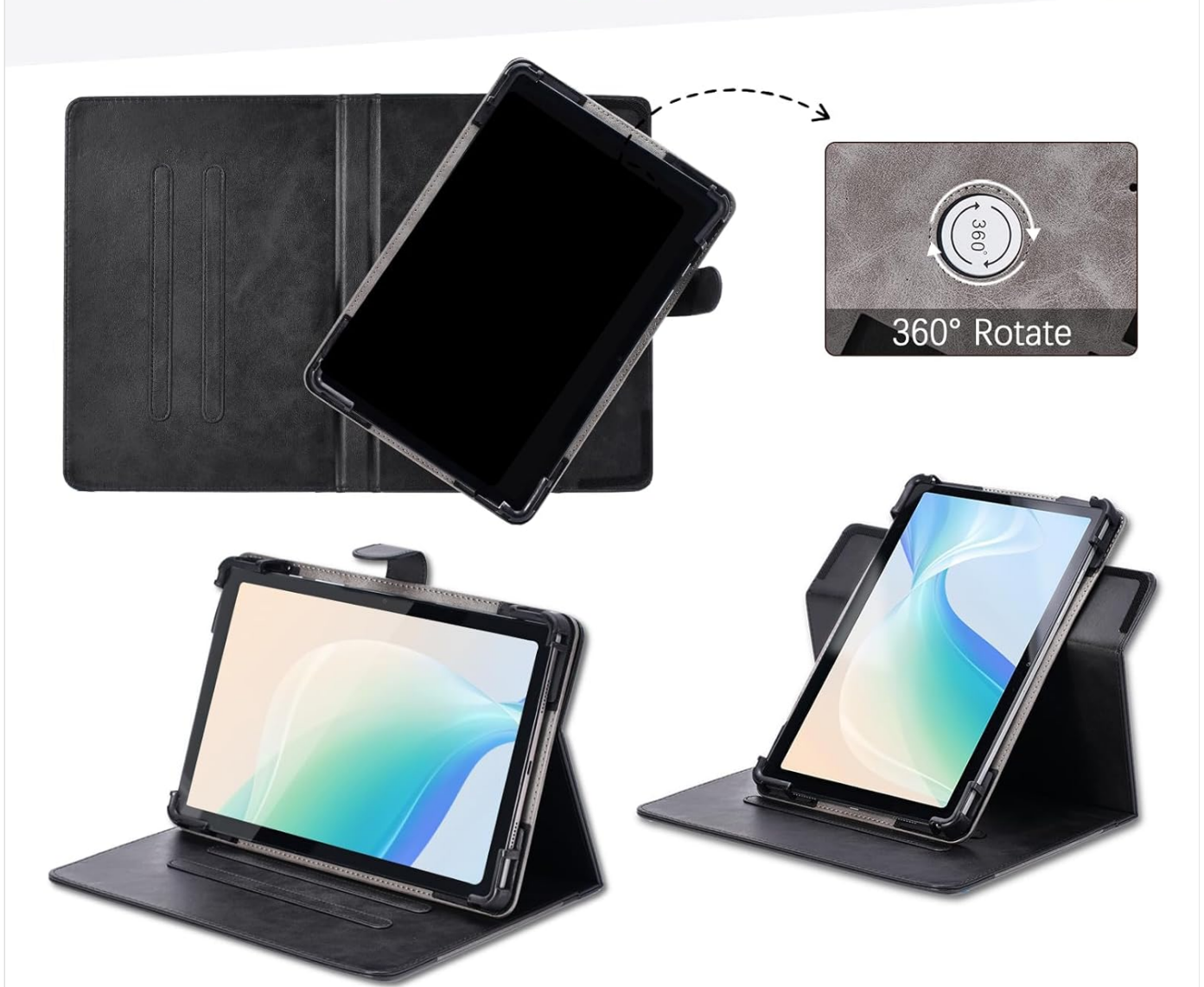
Image: The case supports multiple viewing angles and features a 360-degree free rotation for versatile use.

Supports multiple viewing angles with 360° free rotate