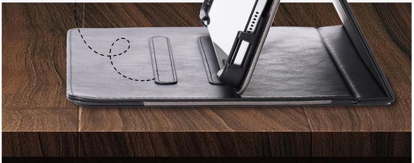
Image: The case converts into a convenient stand, featuring an anti-slip stripe for a stable viewing angle.