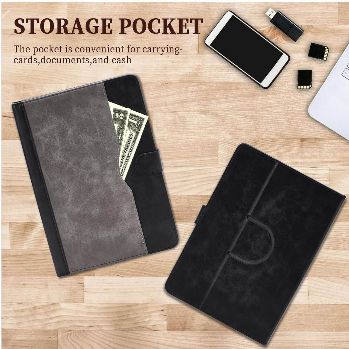
Image: The case features a storage pocket for carrying cards, documents, and cash.

The pocket is convenient for carrying cards, documents, and cash