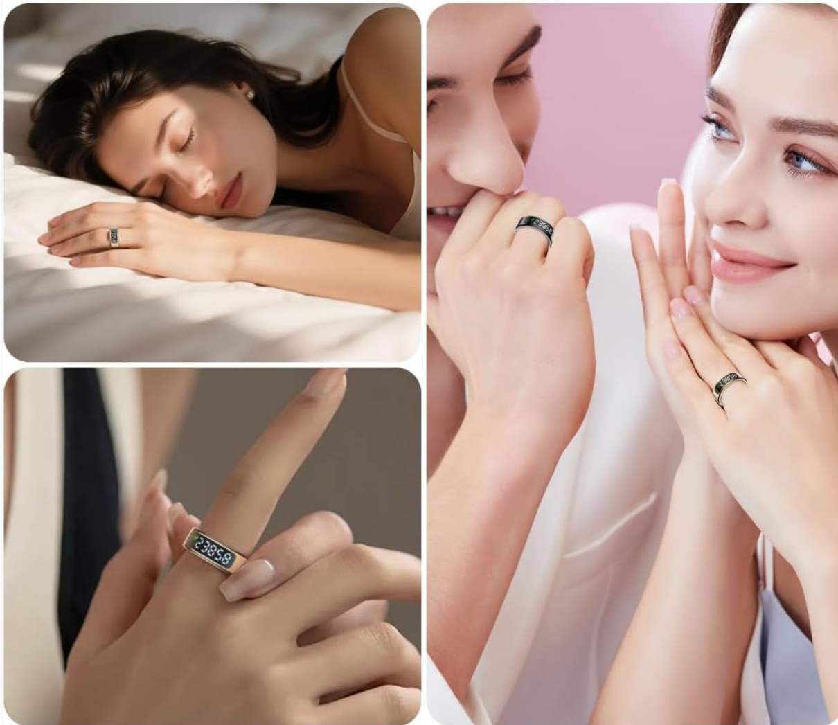
Image: The COLMI R12 Smart Ring displaying various metrics such as steps, power, and time on its integrated screen.