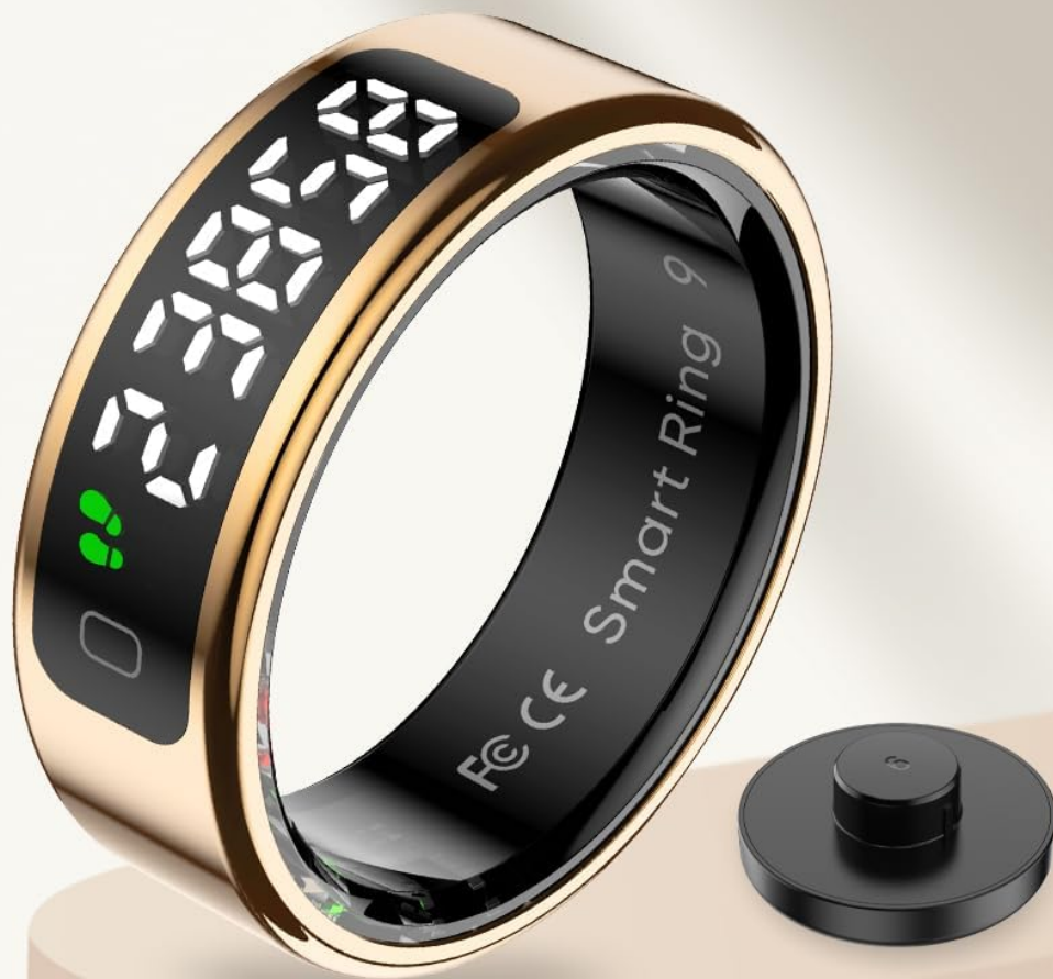
Image: The COLMI R12 Smart Ring placed on its dedicated wireless charging stand, indicating the charging process.