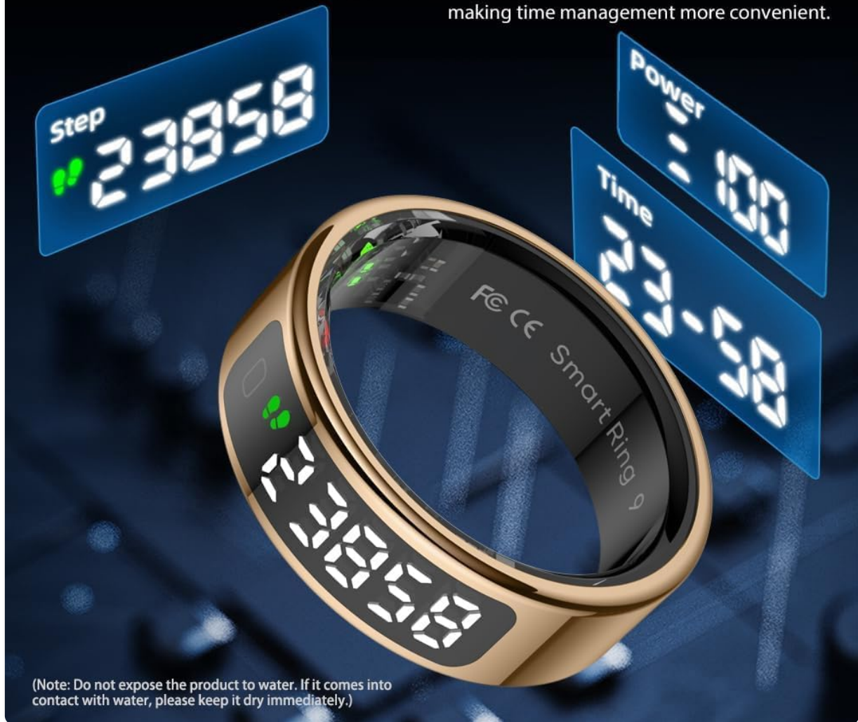
Image: The COLMI R12 Smart Ring, available in different finishes, showcasing its sleek design and integrated display.

You can easily check the current time, steps, and battery level without frequently taking out your phone or watch, making time management more convenient.