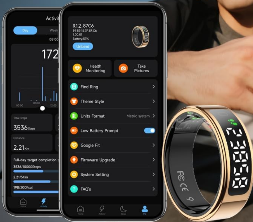
Image: The app's activity statistics interface, visualizing daily, weekly, and monthly data for total steps, distance, and calories consumed.