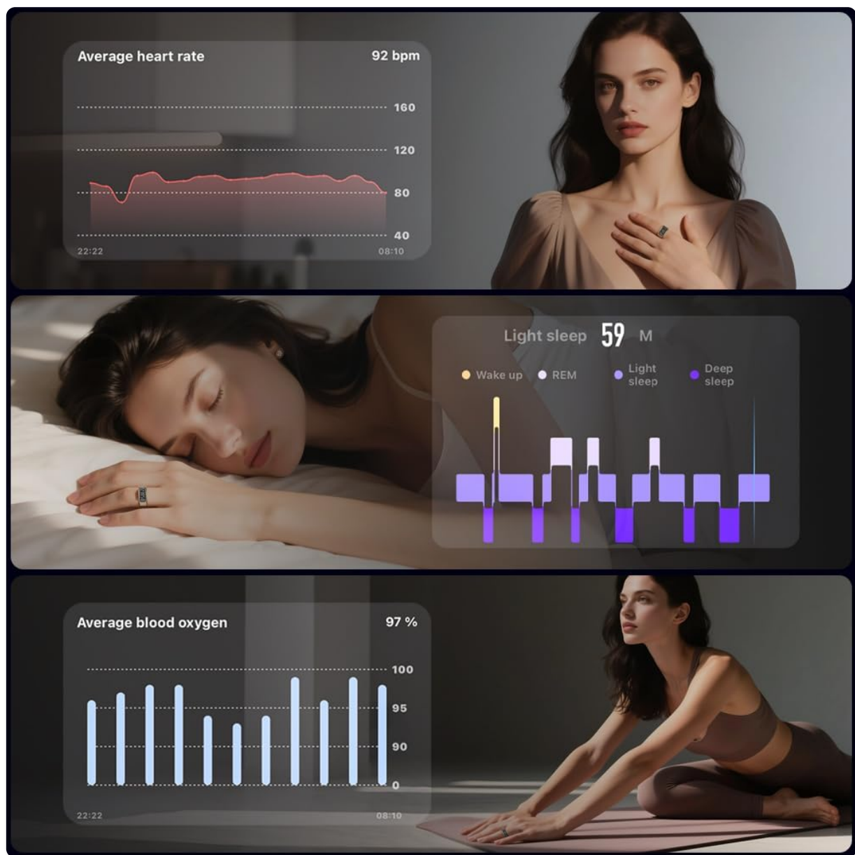
Image: Visual representations of health data, including heart rate trends, sleep stages (wake up, REM, light, deep sleep), and blood oxygen levels, as displayed in the companion app.