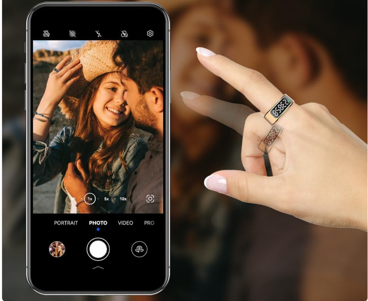
Image: A person demonstrating the smart fingertip control feature, using the ring to remotely trigger a smartphone camera.

When the smart ring is connected to your phone, you can control the camera with just a wave of your finger.