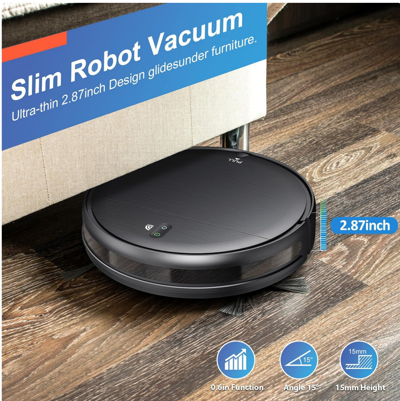
Image: The slim robot vacuum cleaning under furniture.