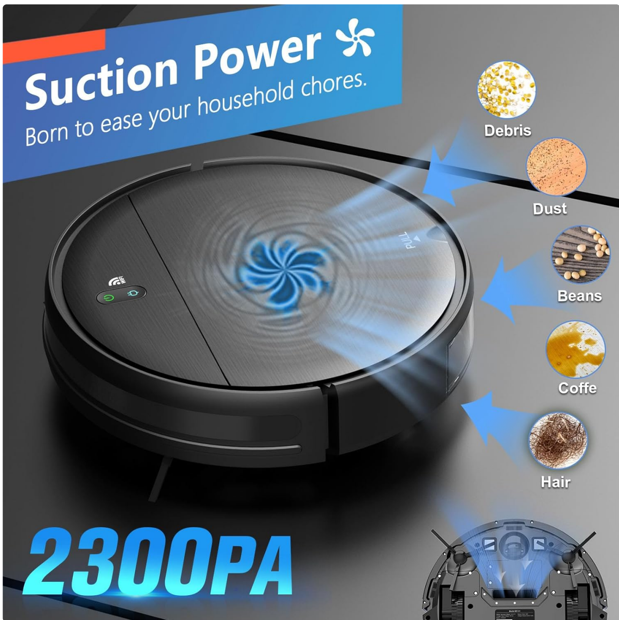
Image: The robot vacuum showcasing its 2300Pa suction power.

The brushless suction port design is particularly advantageous for pet owners, preventing hair entanglement common with roller brushes.