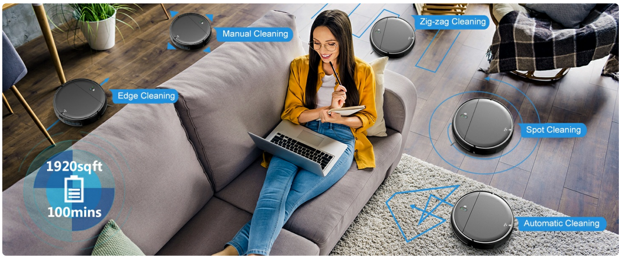
Image: Visual representation of Auto, Spot, Edge, and Zig-zag cleaning modes.