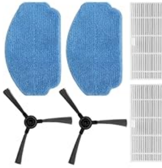
Side Brushes & Mop Pads