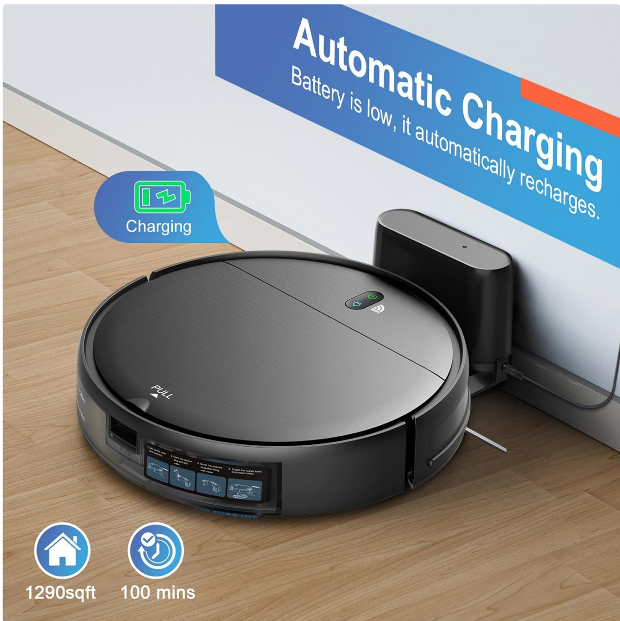
Image: The robot vacuum automatically returning to its charging dock.