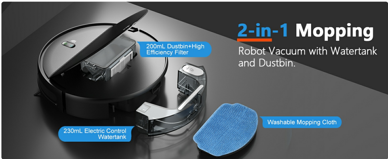
Image: Components of the 2-in-1 mopping system, including the dustbin and water tank.