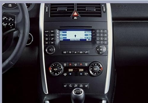
For Benz A-class W169 (2004-2012)