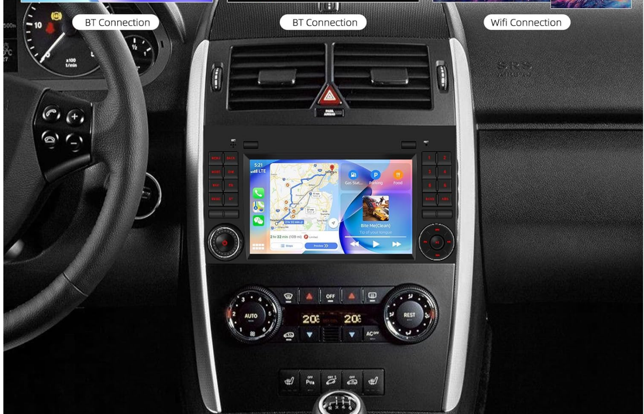
Image: The autoradio screen demonstrating the interfaces for Wireless CarPlay, Android Auto, and Mirrorlink. This visual shows how smartphone applications and content are displayed and controlled on the unit.