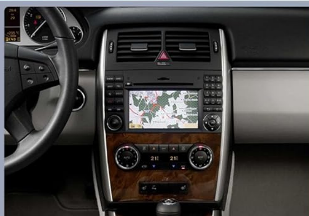
For Benz B-class B200/W245 (2004-2012)