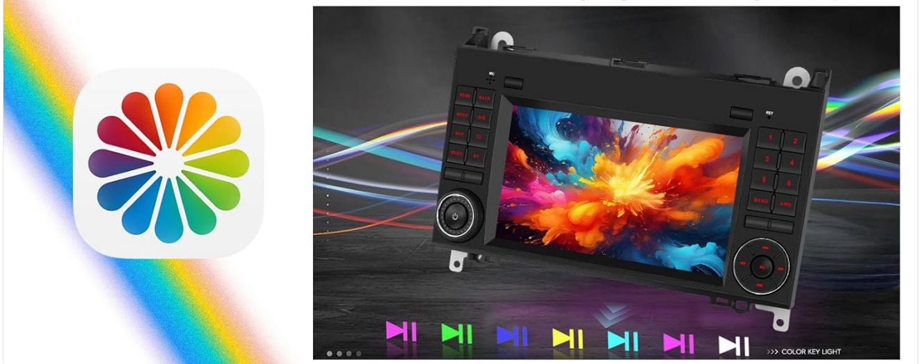
Image: The autoradio unit displaying its high-definition touchscreen with various colorful backlight options. The image also illustrates how the unit integrates with the vehicle's steering wheel controls for convenient operation.

The car system offers a high-definition touchscreen display with colorful backlighting for a captivating visual experience.