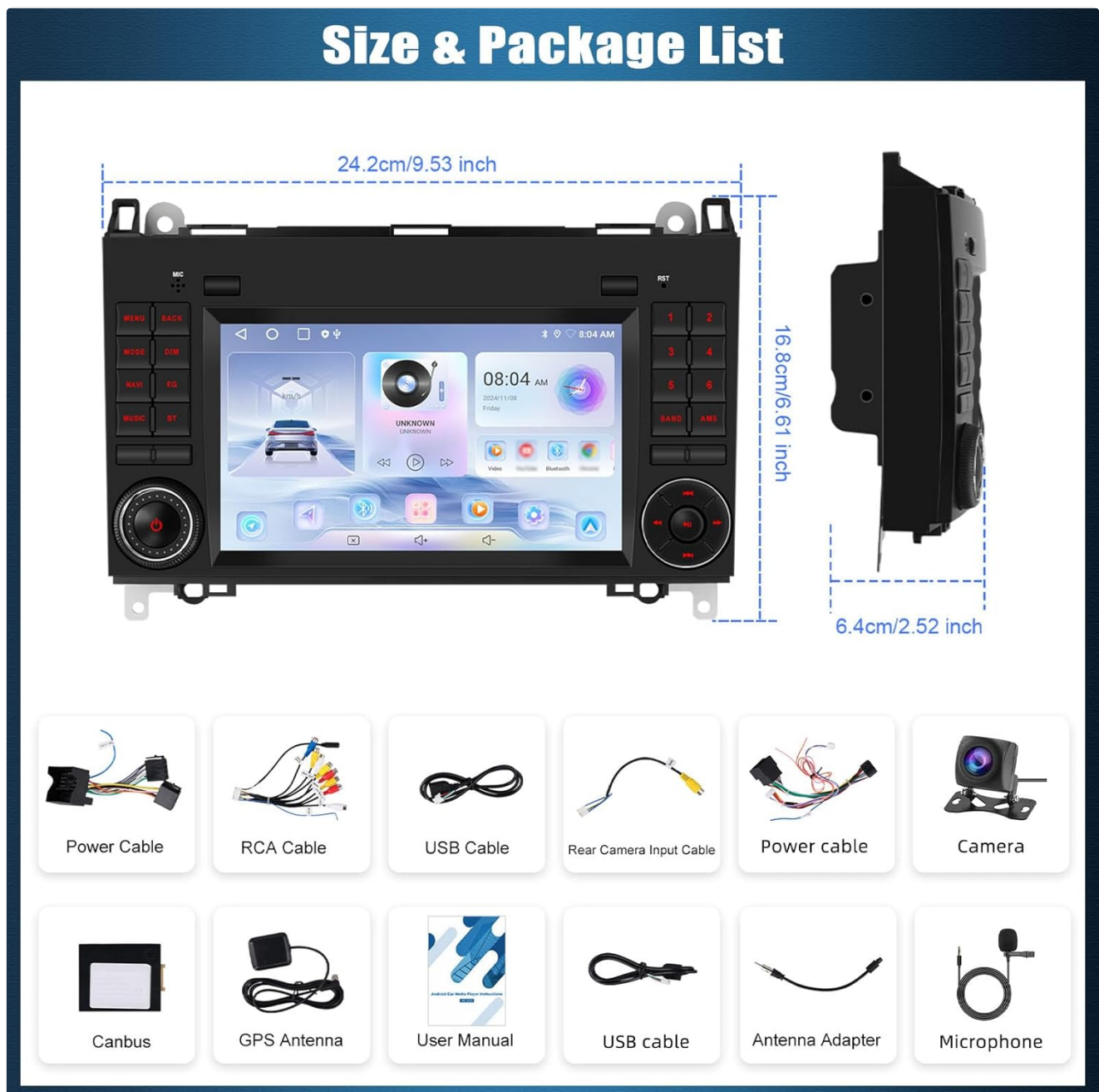
Image: The autoradio unit with its dimensions (24.2cm x 16.8cm x 6.4cm) and a visual representation of all included accessories. This includes various cables, a camera, GPS antenna, and the user manual.

Upon opening the package, ensure all items listed below are present and undamaged.