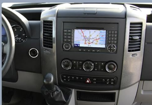
For Benz Sprinter W906/W209/W311 /W315/W318 (2006-2016)

Image: Various Mercedes Benz dashboards, including A-Class W169 and B-Class W245, showing the fitment area for the autoradio. This image helps users identify if their vehicle's dashboard matches the compatible models.