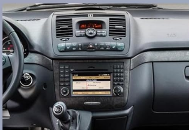
For Benz Viano/VITO(W639) (2006-2016)