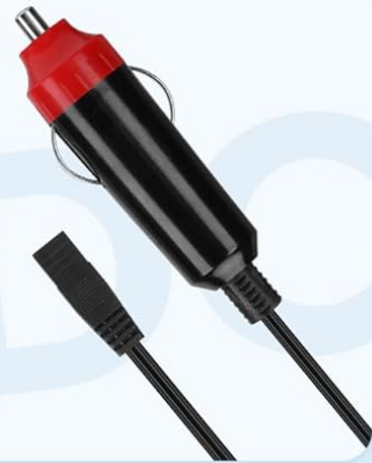
Image: The Electactic LY1904 Mini Fridge shown with its included AC and DC power cables, illustrating the two power options for home and car use.