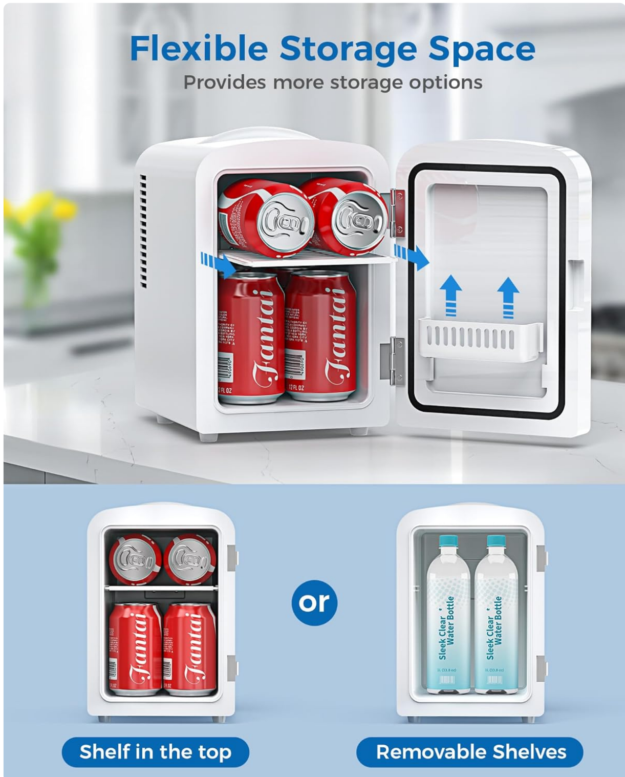
Image: The interior of the Electactic LY1904 Mini Fridge showing the removable shelf, which can be adjusted or removed to accommodate different sized items like cans or bottles.