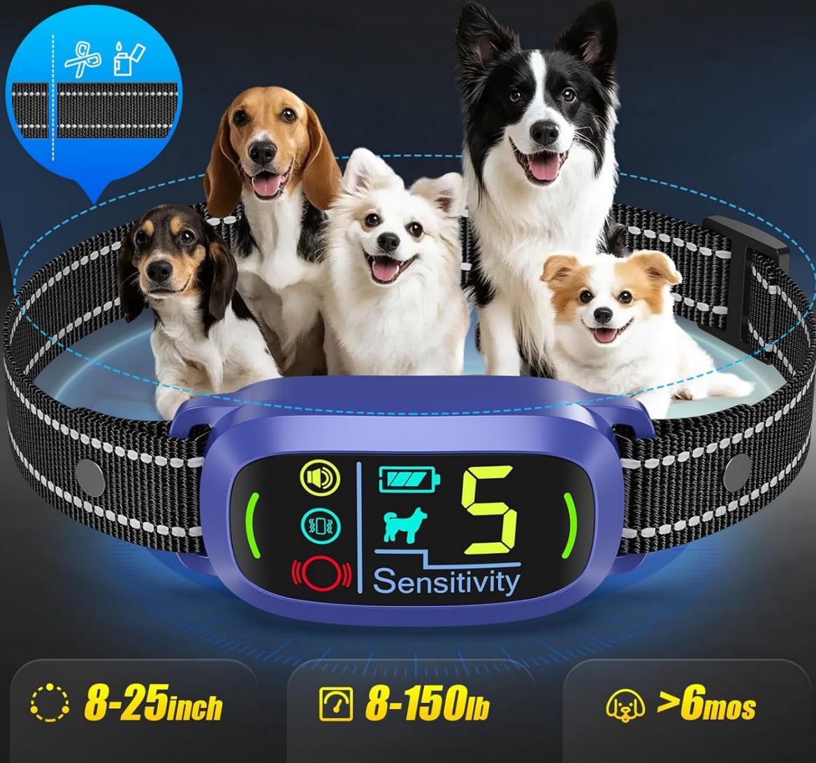
Image: Detailed view of the collar's digital display screen and its various indicators.

For dogs 8-25 inches neck, 8-150 lbs, and over 6 months