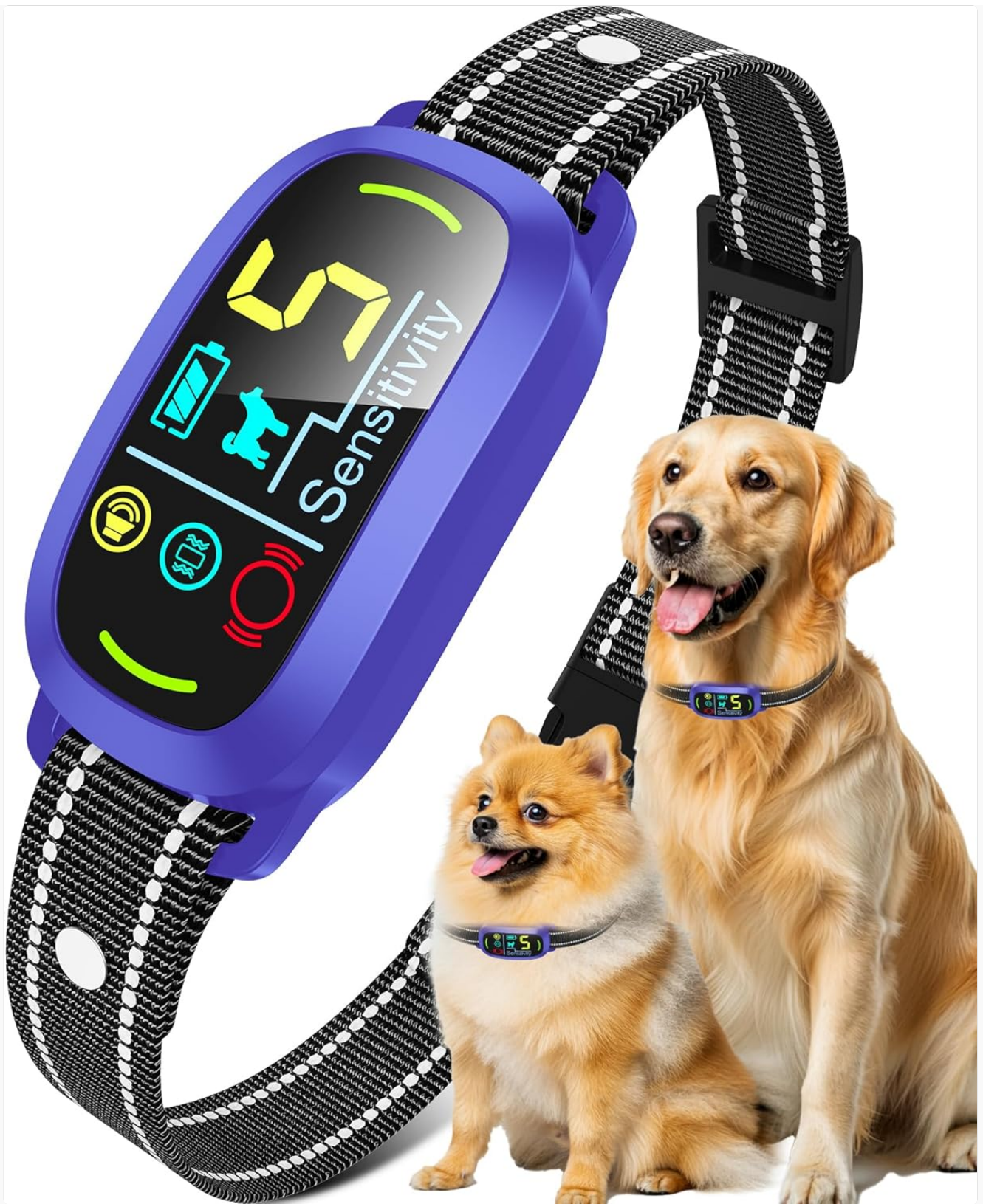
Image: The Oliry Smart AI Bark Collar S1 Pro main unit and examples of dogs wearing it.