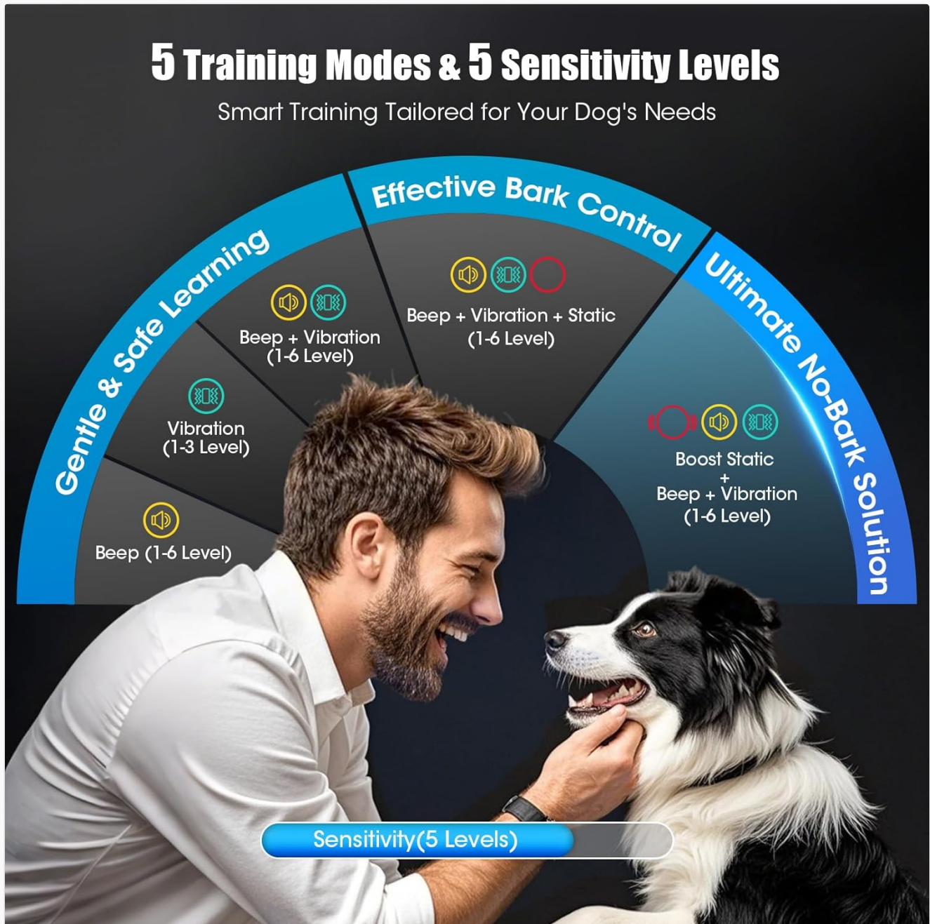
Image: Visual representation of the collar's five training modes and their progression.

Start with the gentlest mode (Beep) and gradually increase if necessary, observing your dog's response.