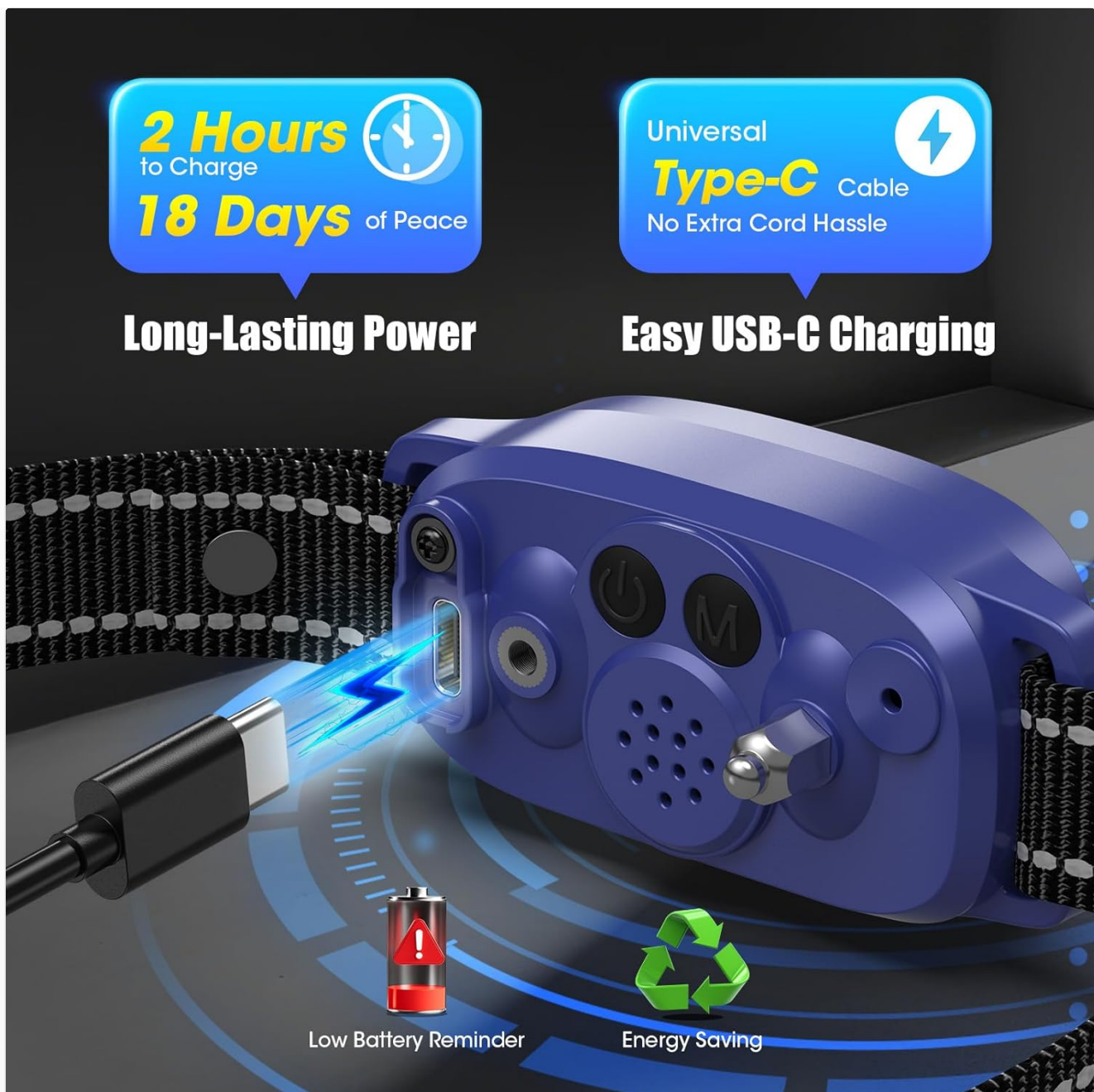
Image: The collar connected to a USB-C charging cable, highlighting its fast charging and long battery life.