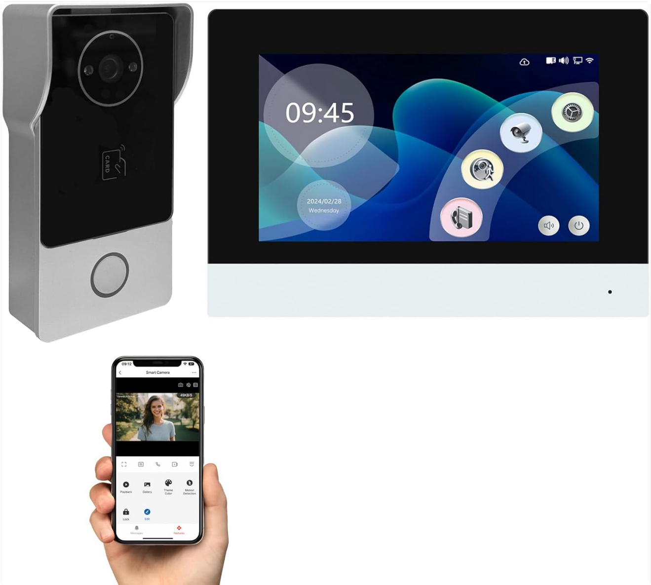
Figure 1: YUANWIN Smart Video Doorbell Intercom System (Outdoor Station and Indoor Monitor)