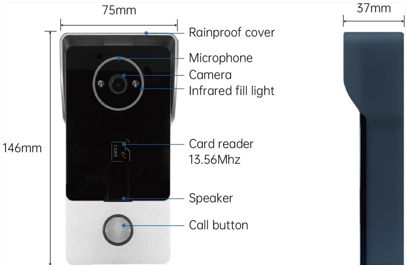
Figure 3: Outdoor Station Components and Dimensions

The outdoor station is equipped with a 2MP HD camera, infrared fill light for night vision, a microphone, speaker, RFID card reader, and a call button. It is designed for outdoor use with a rainproof cover.