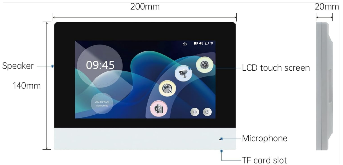
Figure 4: Indoor Monitor Components and Dimensions

The indoor monitor features a 7-inch IPS touch screen display, a speaker, microphone, and a TF card slot for local storage. It serves as the central control unit for the intercom system.