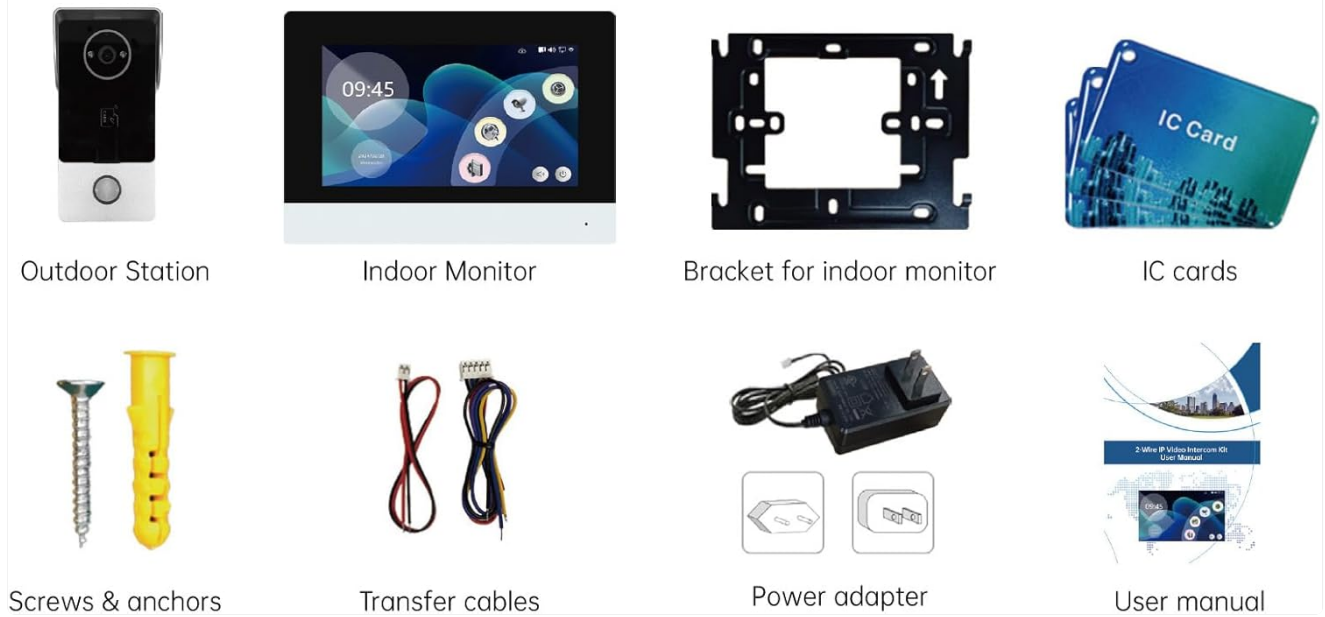
Figure 2: Package Contents