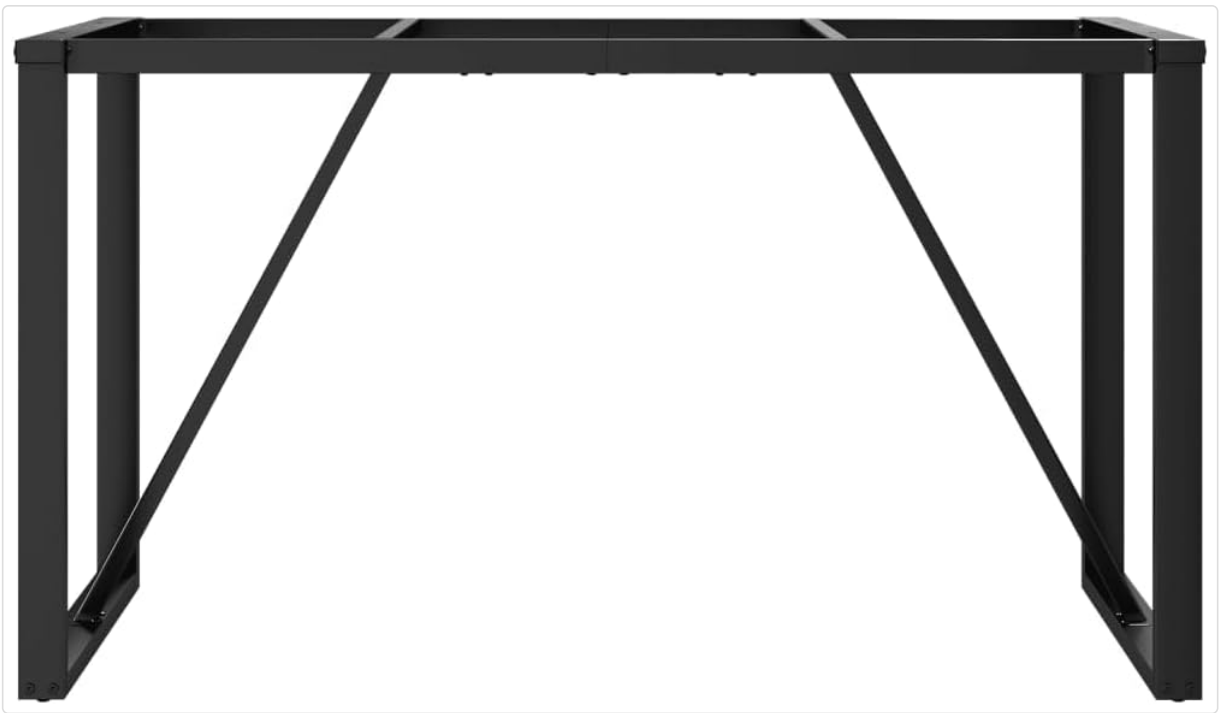
Image 3.1: Front view of the O-frame table leg set, highlighting its structural design.