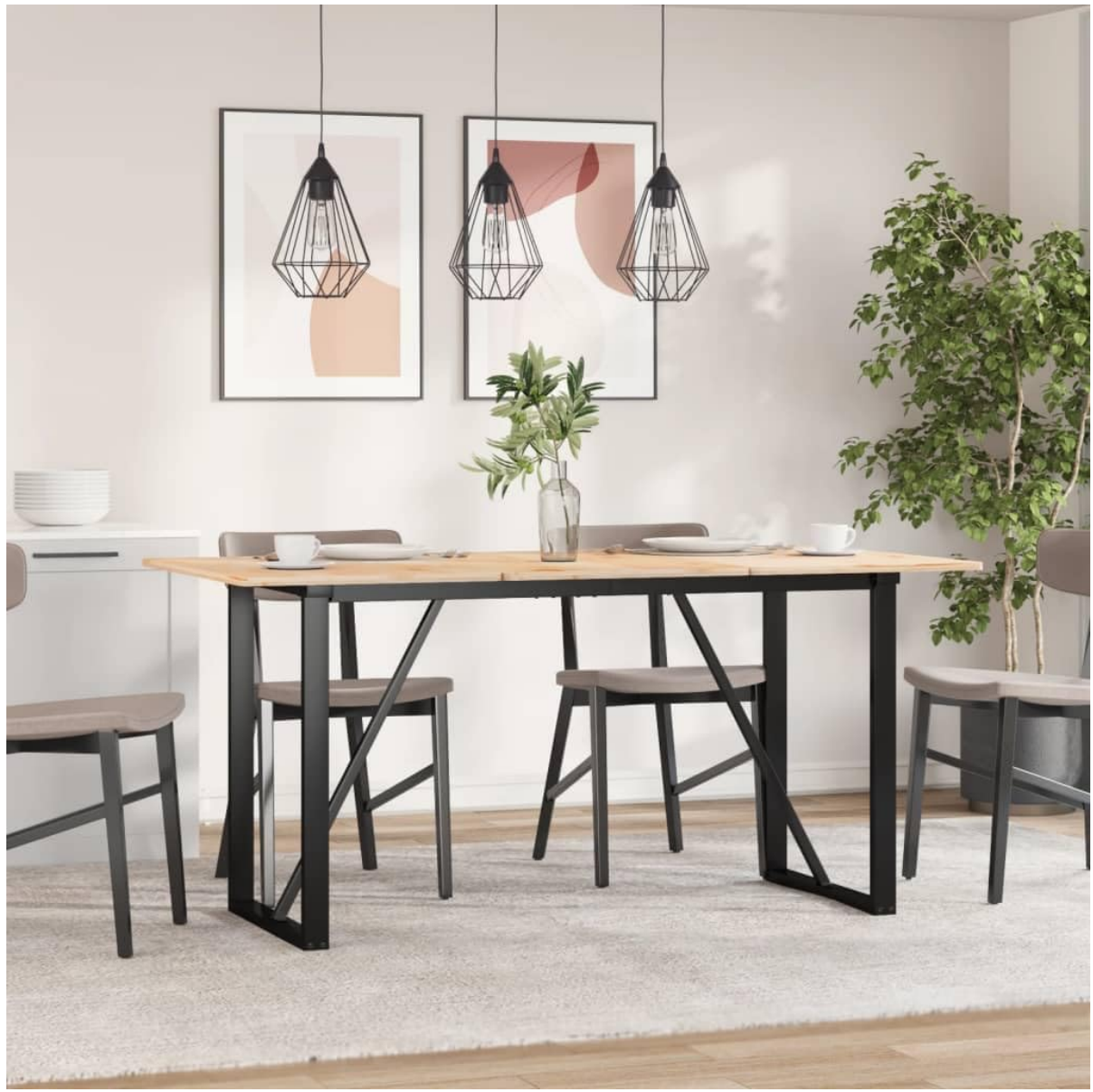
Image 1.1: The Dining Table Leg Set installed with a wooden tabletop, showcasing its O-frame design and black finish in a modern dining environment.