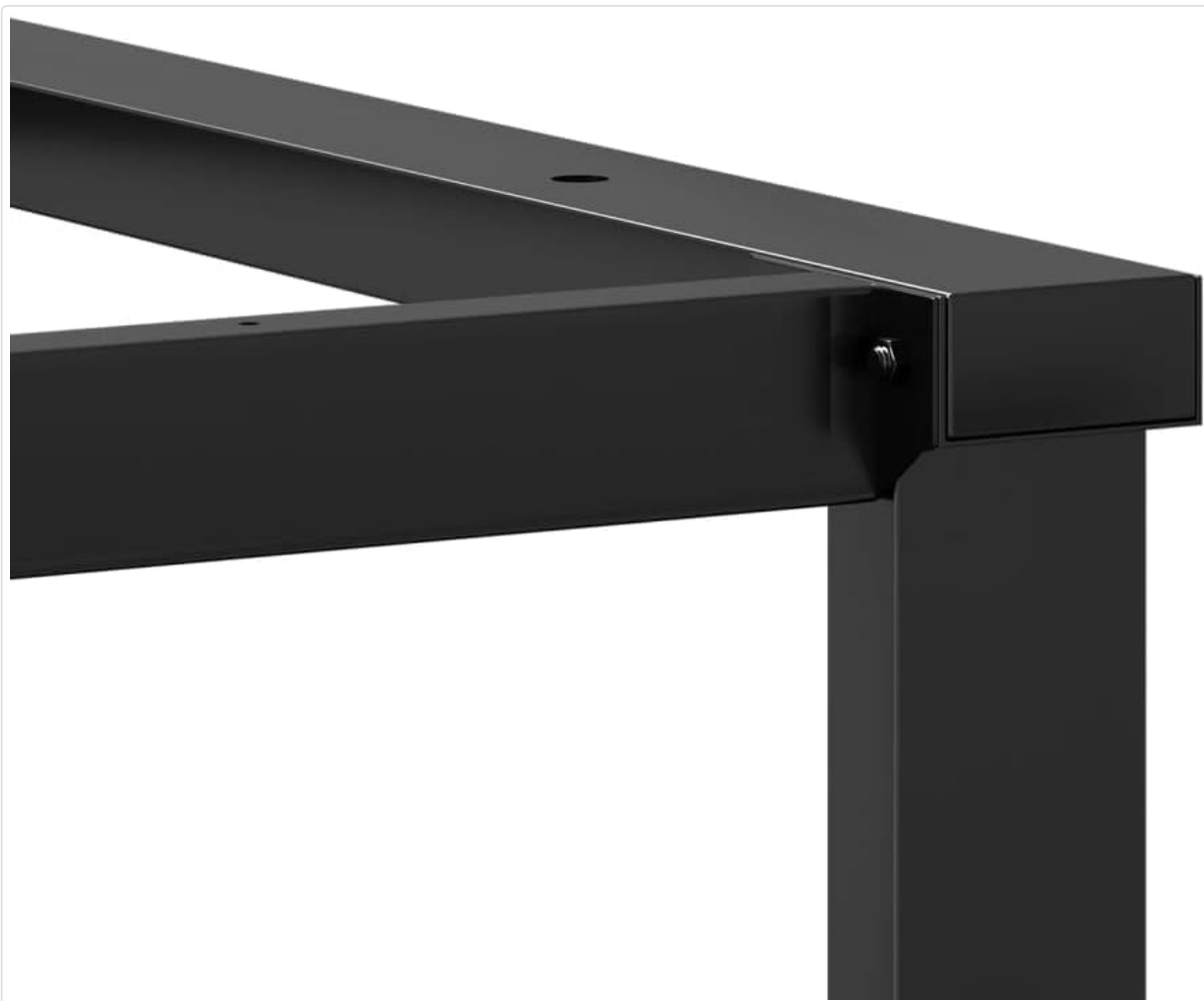
Image 2.2: Detail of a corner connection point on the table leg frame, highlighting the secure fastening mechanism.