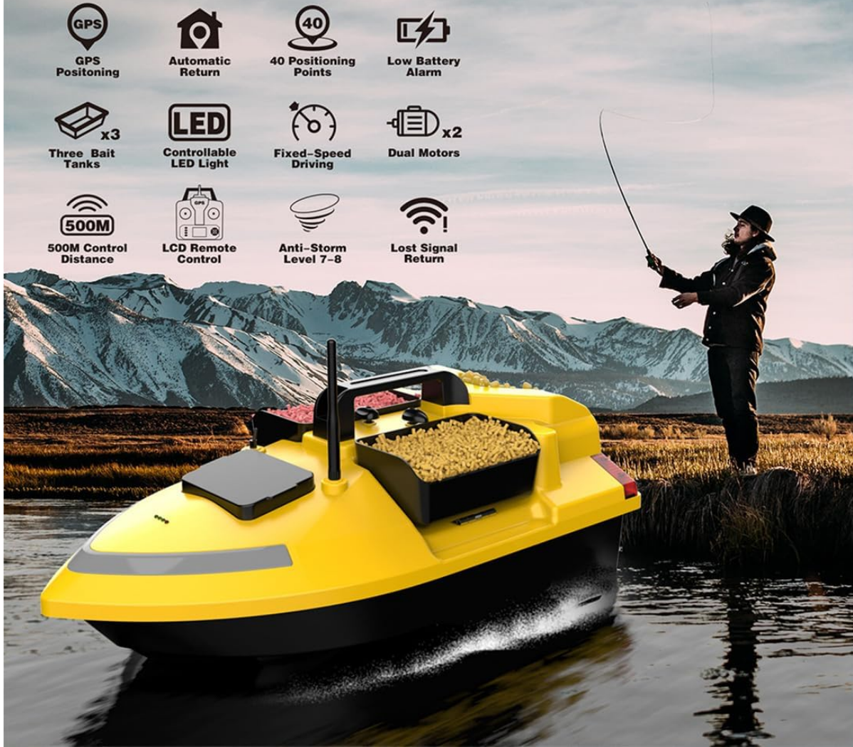
Image: Visual representation of the main functions including GPS positioning, automatic return, 40 positioning points, low battery alarm, three bait tanks, controllable LED light, fixed-speed driving, dual motors, 500m control distance, LCD remote control, anti-storm level 7-8, and lost signal return.