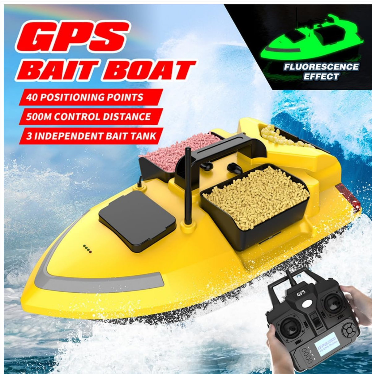
Image: The V020 bait boat on water, showing its three bait compartments filled and highlighting its fluorescence effect feature.