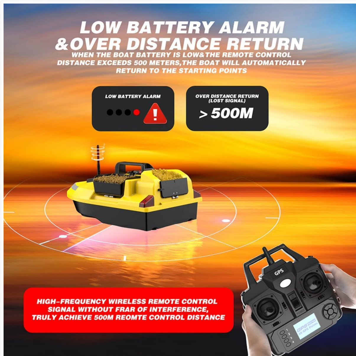
Image: Illustrates the low battery alarm and over-distance return functions. When the boat battery is low or the remote control distance exceeds 500 meters, the boat automatically returns to the starting point.