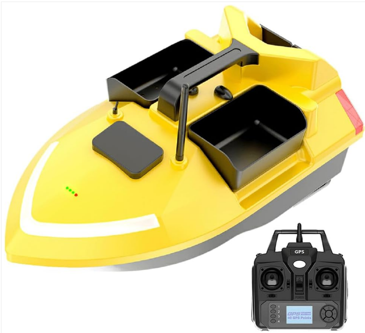
Image: The V020 RC Bait Boat in yellow, accompanied by its remote control unit.