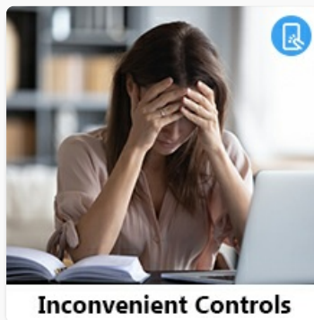
Figure 4: Oscillation and Remote Control

Activate the 70° oscillation feature by pressing the oscillation button (🌀) for wide area coverage.