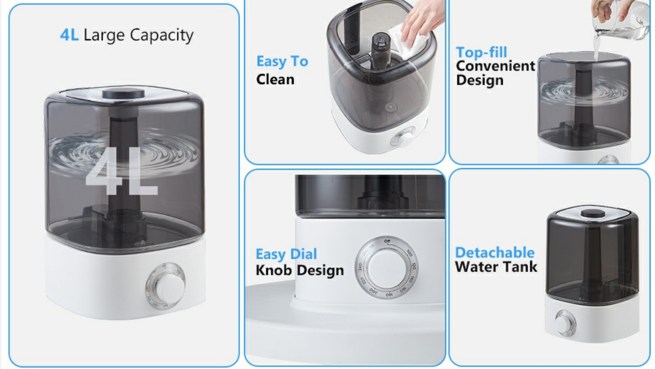
Figure 5: Humidifier Features