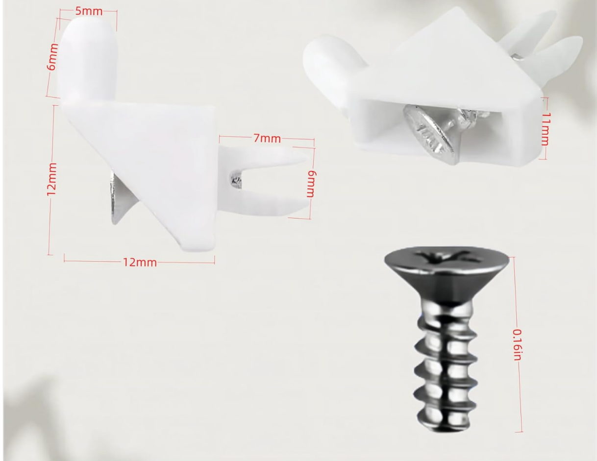
Image: Detailed diagram showing the dimensions of the shelf support pins, including peg length (6mm), peg diameter (5mm), and overall pin dimensions (12mm x 12mm x 11mm).