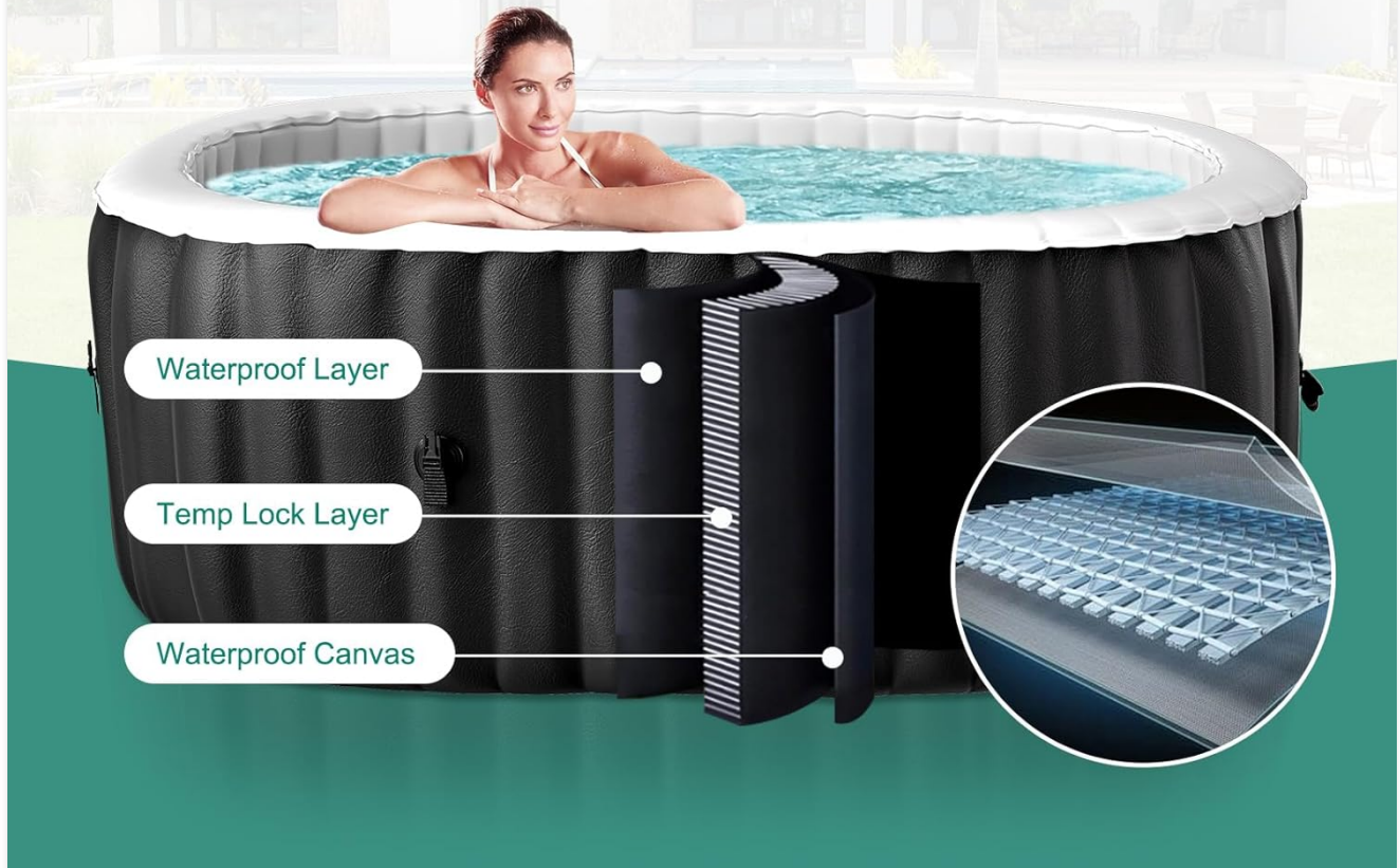
Image: Diagram illustrating the 3-layer reinforced PVC material construction of the hot tub, highlighting its durability, support, and waterproof layers.