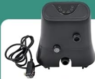
1 x Heater Pump