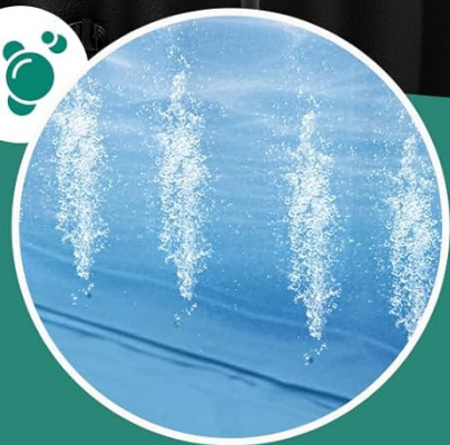
Image: The hot tub with active massage jets, illustrating the bubble feature for a rejuvenating experience.