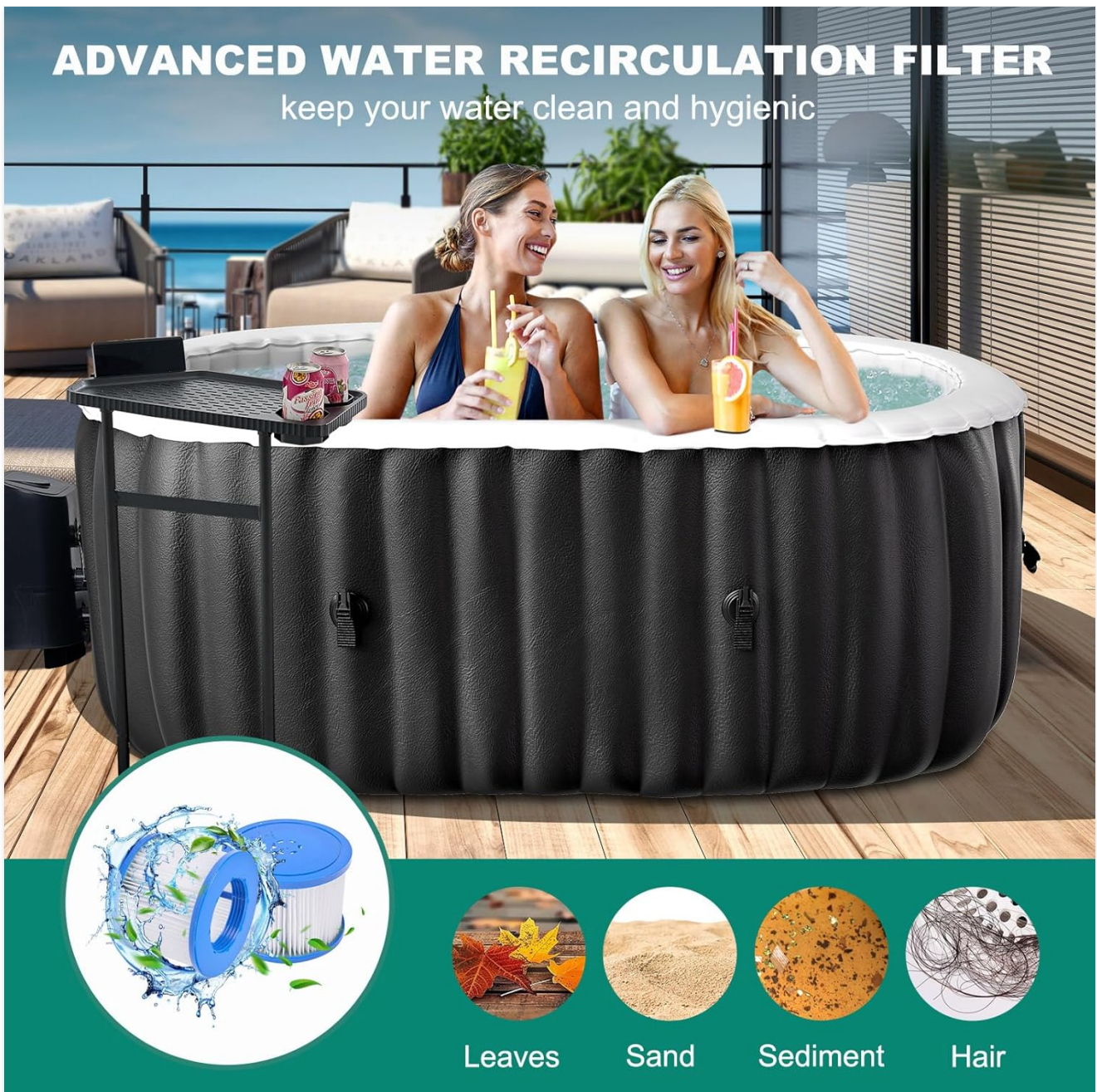
Image: The advanced water recirculation filter system, illustrating how it keeps water clean by removing leaves, sand, sediment, and hair.

Video: A guide on how to replace the Ground Fault Circuit Interrupter (GFCI) for the hot tub's power cord.