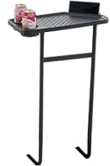
1 x Side Table