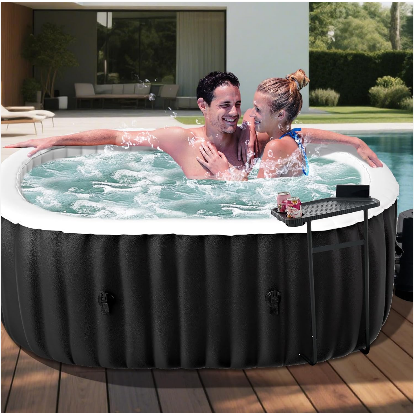
Image: The DoCred 1-2 Person Inflatable Hot Tub, showcasing its oval shape and compact design suitable for small outdoor spaces.