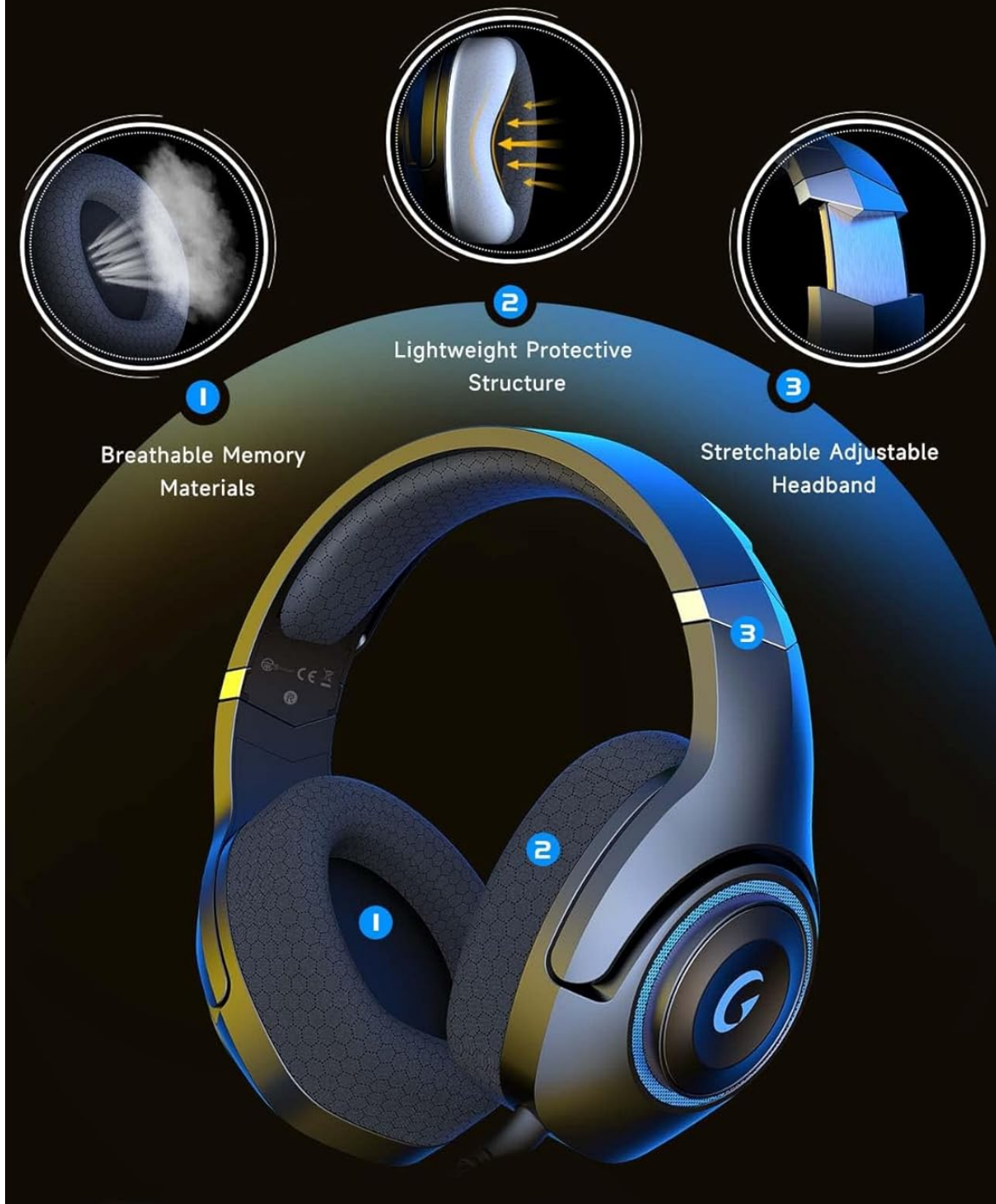
Figure 6: Ergonomic design features contributing to headset comfort and durability.