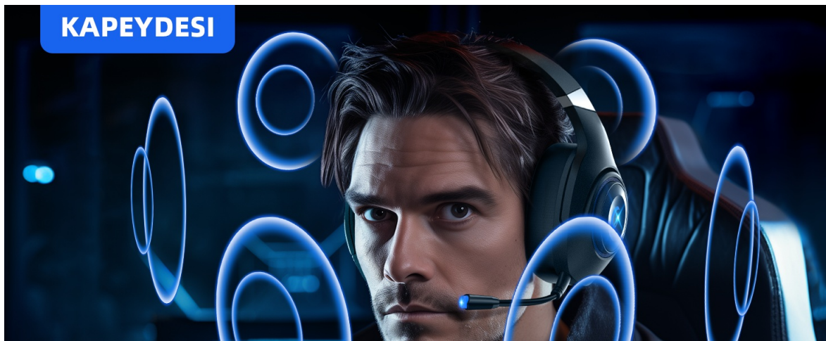
Figure 1: KAPEYDESI Captain 400 Wireless Gaming Headset in Midnight Blue.

This manual provides detailed instructions for the proper use and maintenance of your KAPEYDESI Captain 400 Wireless Gaming Headset. Please read this manual thoroughly before using the product to ensure optimal performance and longevity.