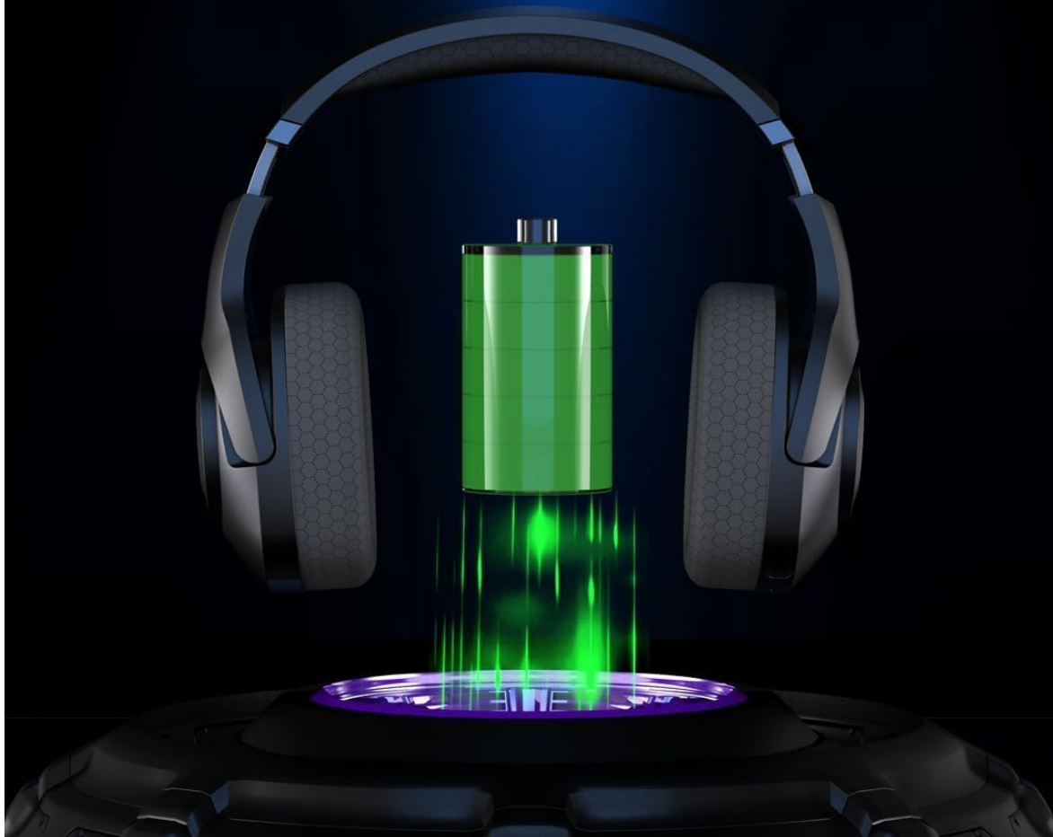
Figure 5: Battery life and charging information for the headset.