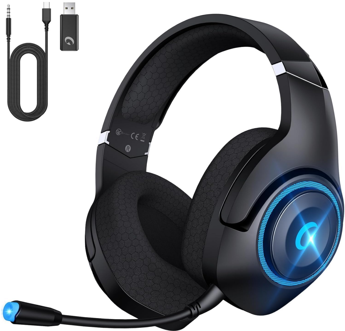
Figure 2: Headset with included USB transmitter, Type-C charging cable, and 3.5mm Aux cable.