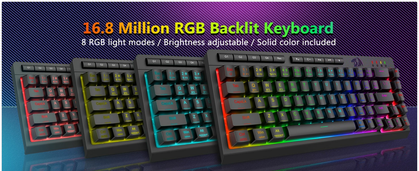
Image: Multiple views of the keyboard showcasing various RGB lighting effects and colors.