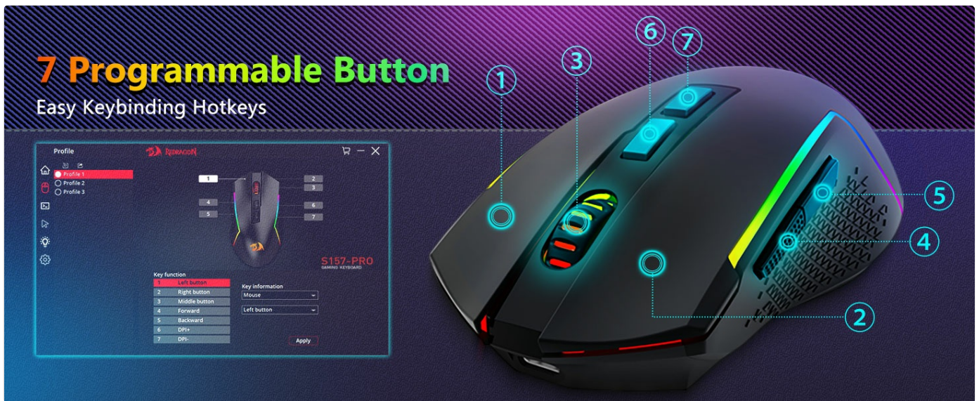
Image: A diagram of the mouse highlighting its 7 programmable buttons and a screenshot of the software interface for keybinding.