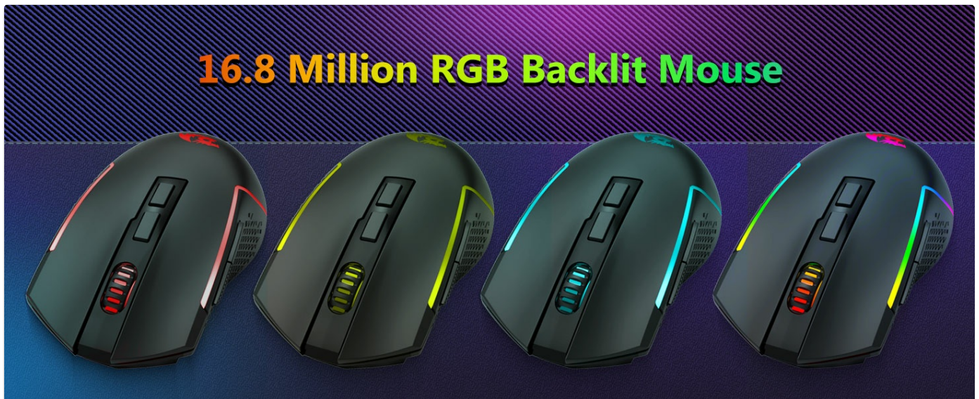
Image: Multiple views of the mouse showcasing various RGB lighting effects and colors.

The mouse also features 16.8 million RGB colors, complementing the keyboard's lighting effects.