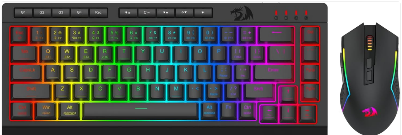
Image: The Redragon S157-PRO keyboard and mouse combo, showcasing its RGB backlighting.

The Redragon S157-PRO is a versatile wireless gaming keyboard and mouse combo designed for multi-device compatibility and enhanced gaming and productivity. It features tri-mode connectivity (Bluetooth 5.0, 2.4GHz wireless, and USB-C wired), customizable RGB backlighting, and programmable macro keys for both the keyboard and mouse.