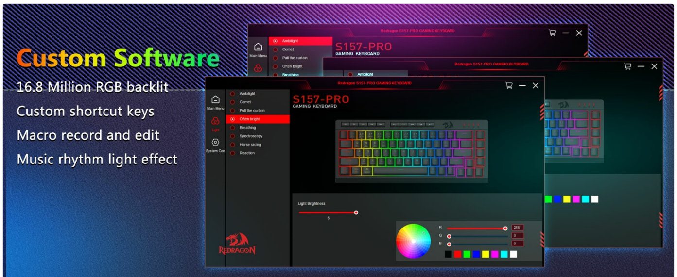
Image: Screenshots of the custom software interface for the keyboard, showing options for RGB backlight control, custom shortcut keys, macro recording, and music rhythm light effects.