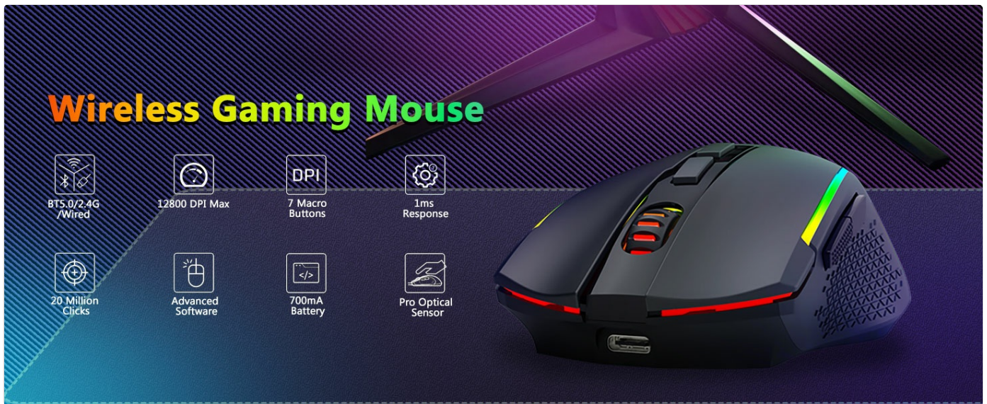
Image: An overview of the mouse's features, including BT5.0/2.4G/Wired connectivity, 12800 DPI Max, 7 Macro Buttons, and 700mAh battery.

The S157-PRO mouse offers high precision and customization for gaming.