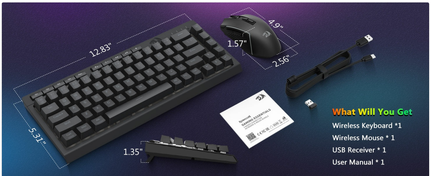
Image: An illustration showing the keyboard, mouse, USB receiver, USB-C cable, and user manual included in the package.