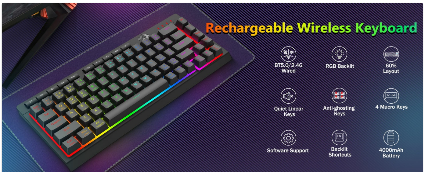
Image: An overview of the keyboard's features, including 60% layout, RGB backlighting, 4000mAh battery, and anti-ghosting keys.

The S157-PRO keyboard is designed for optimal gaming and typing performance.