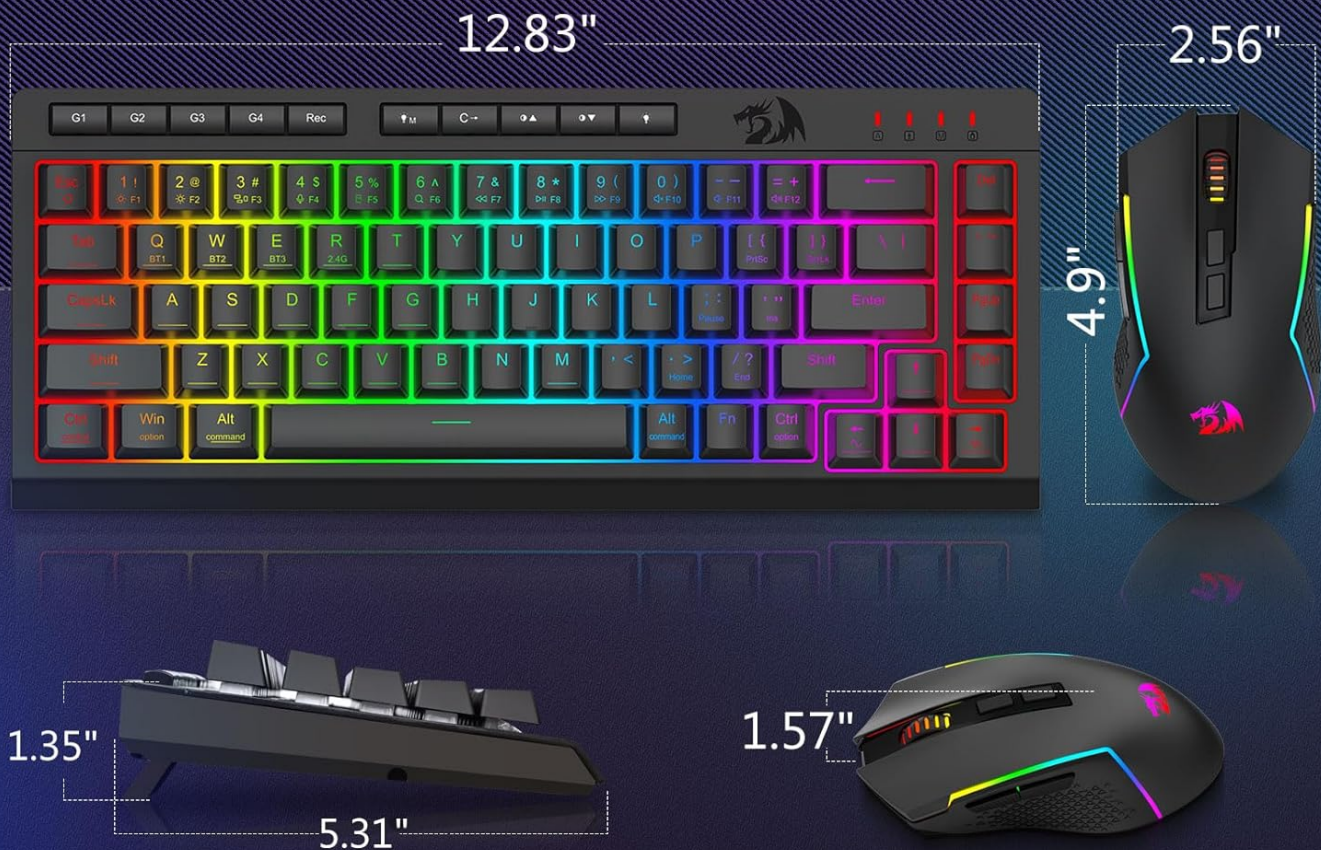
Image: A diagram showing the dimensions of both the keyboard and mouse.