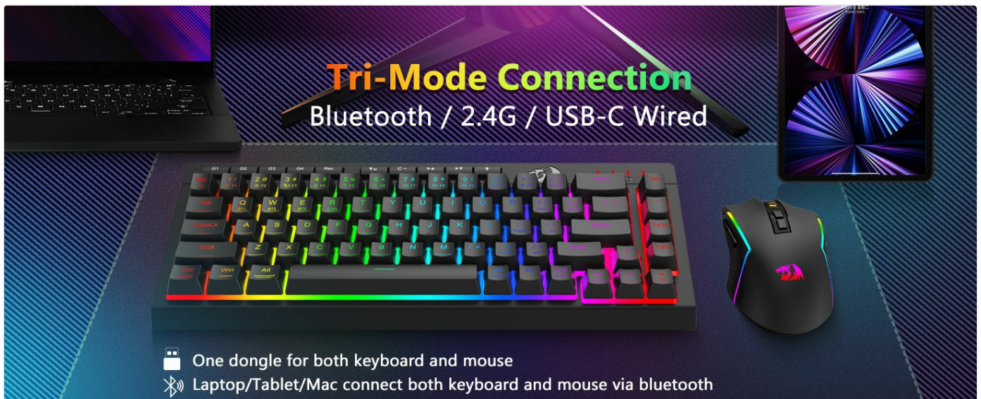
Image: The keyboard and mouse connected to a laptop and tablet, illustrating the tri-mode connection capability.

You can connect the keyboard and mouse to up to three different devices (PC, Mac, tablets, phones, PS/XBOX) and switch between them effortlessly.