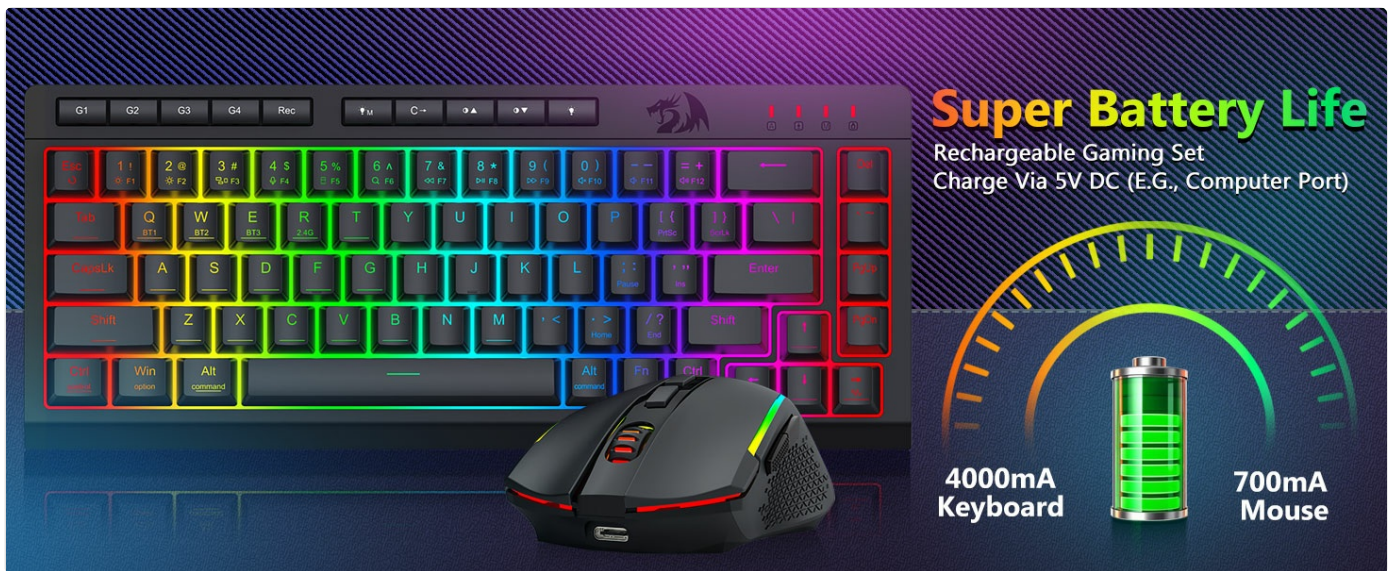
Image: An illustration showing the 4000mAh battery capacity of the keyboard and 700mAh battery capacity of the mouse, emphasizing super battery life.