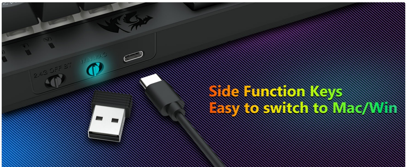
Image: A close-up of the keyboard's side, showing the 2.4G/OFF/BT switch, Win/Mac switch, and USB-C port, with the USB receiver detached.