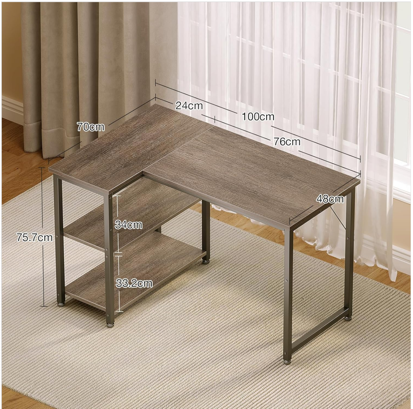
Image: Overview of the desk with key dimensions, illustrating the overall structure.

Place the desktop panels onto the assembled frame. Secure them using the designated screws. Ensure the panels are aligned correctly before fully tightening.