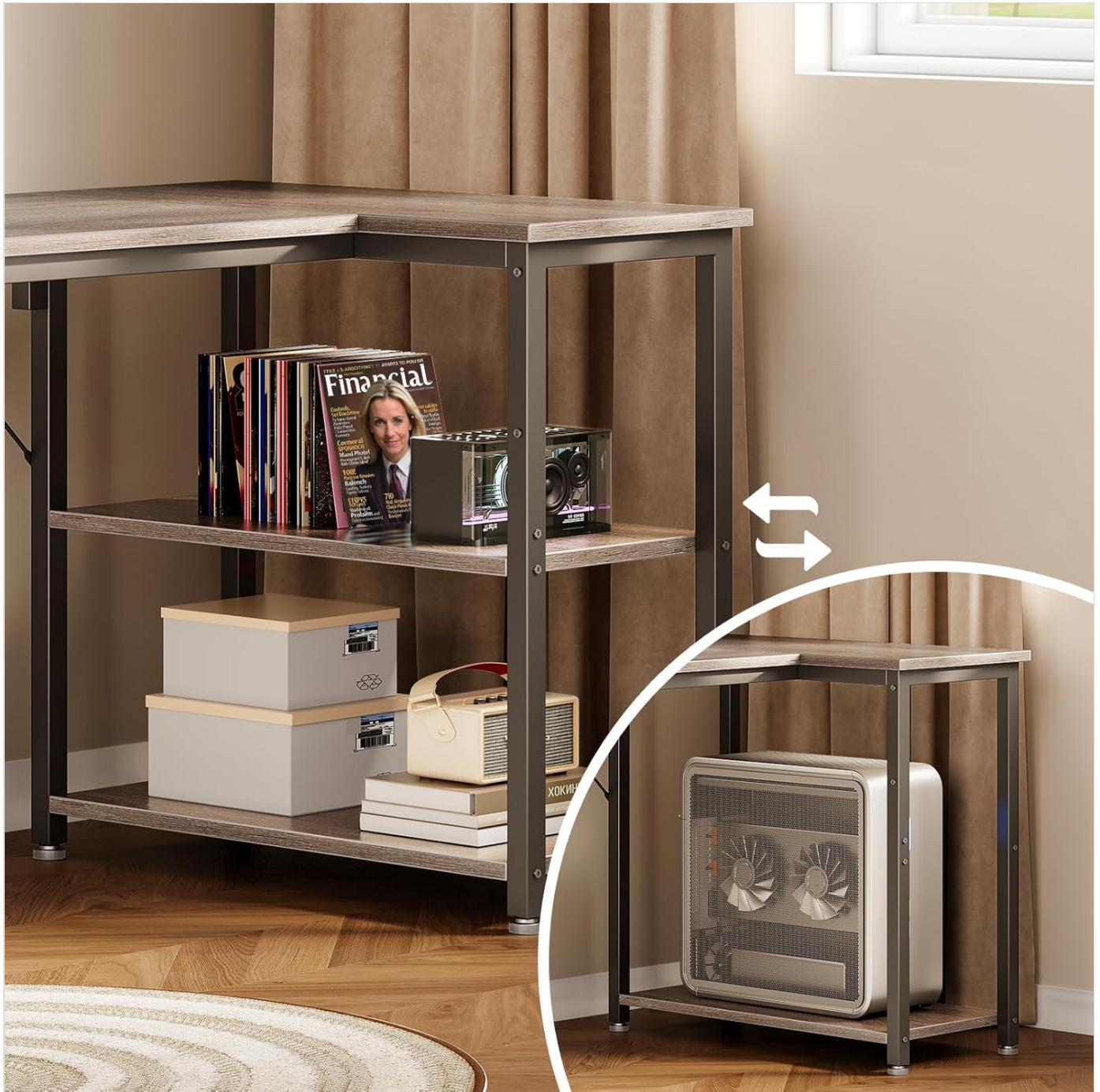
Image: Detail showing the reversible storage shelves, highlighting their flexible placement.

The storage shelf unit can be installed on either the left or right side of the desk. Attach the shelf frame to the main desk frame, then insert the two shelf panels. Secure all connections. The middle shelf can be removed if you need space for a PC tower.