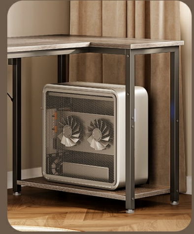
Image: Illustration of the removable middle shelf, allowing space for a computer tower.