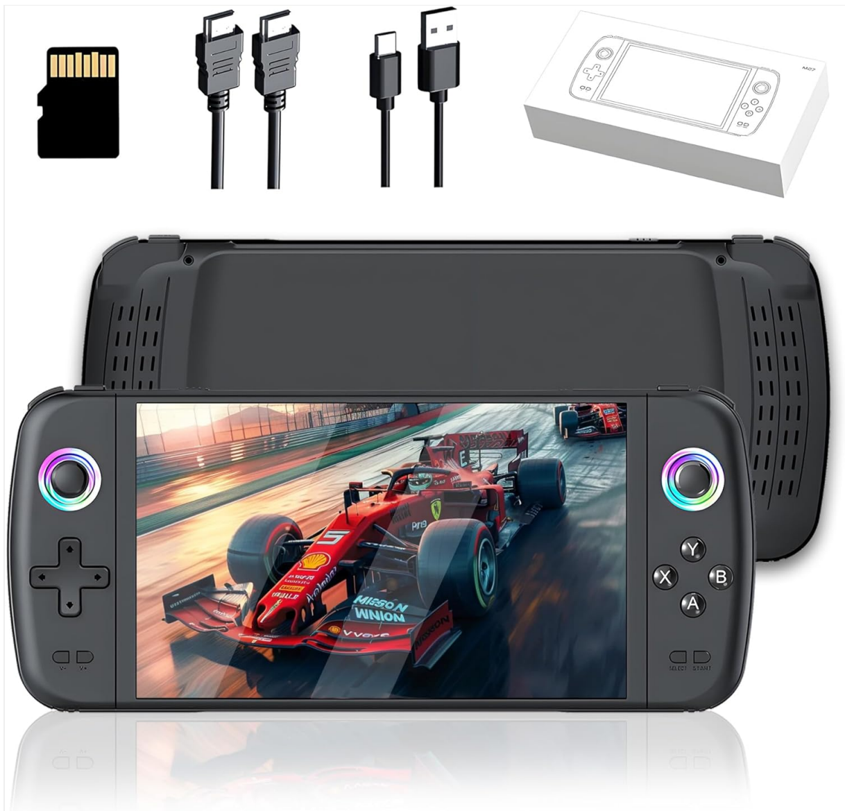
Image: The KINMRIS M27 Retro Gaming Console, along with its data cable, instruction manual, and a storage card.