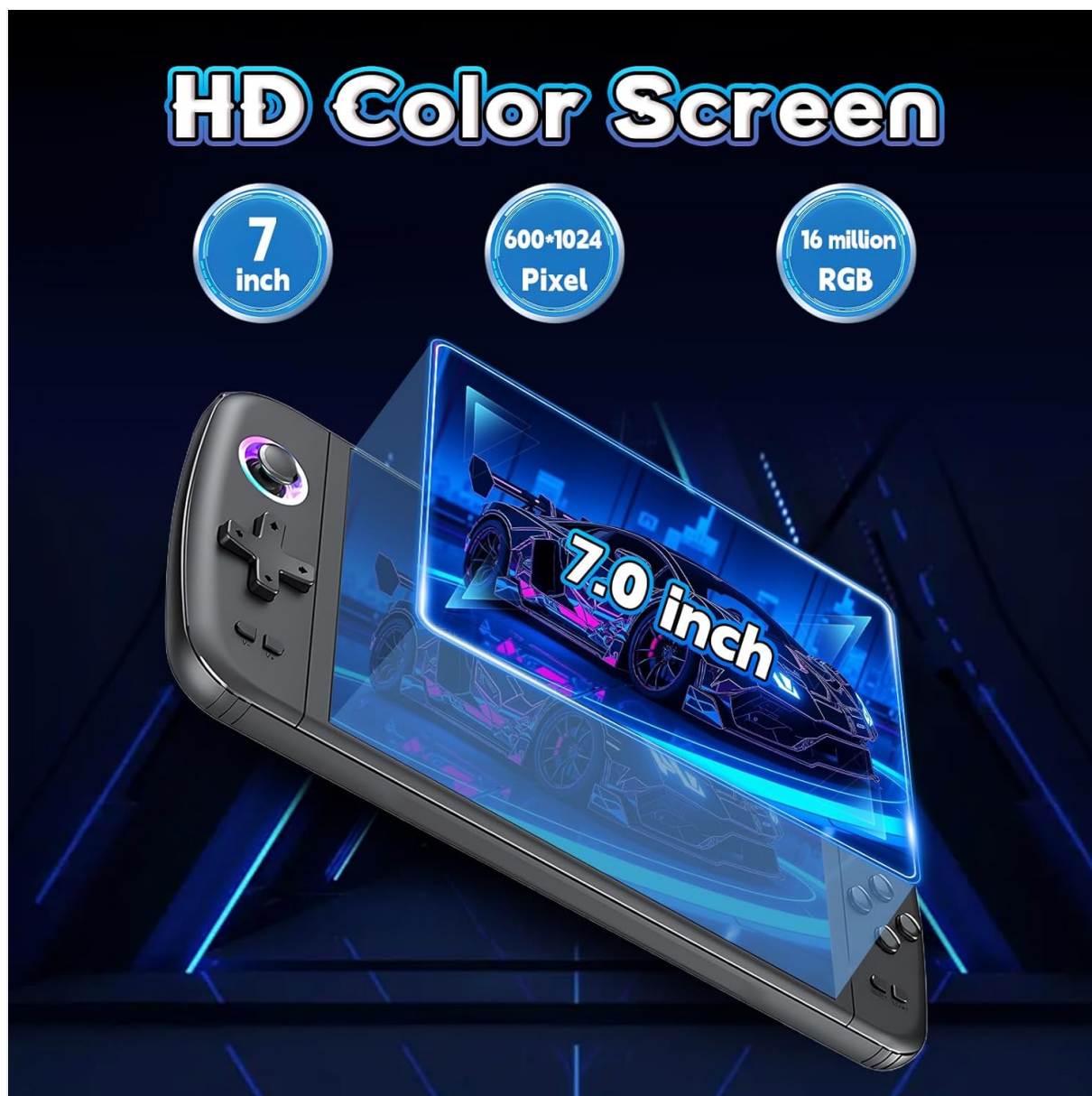
Image: Close-up of the M27 console highlighting its 7-inch IPS HD color screen with 600x1024 pixel resolution.