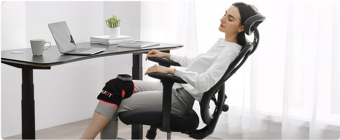
Visual guide for operating the Kaoudt 3D Knee Massager.

during use. Briefly press the power button again to deactivate.