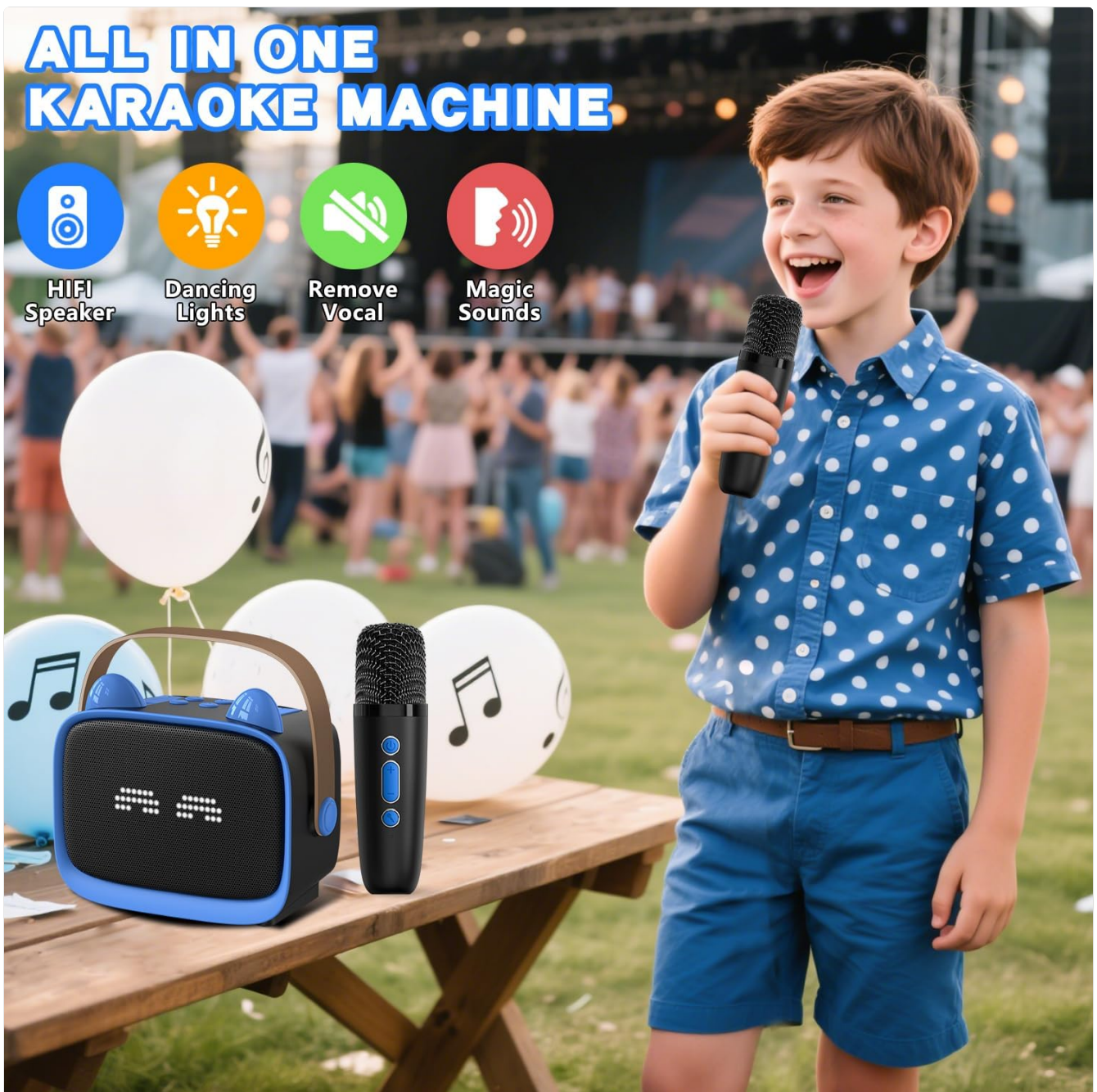
Image: The MgaoLo Mini Karaoke Machine speaker and its two wireless microphones.

Your browser does not support the video tag.