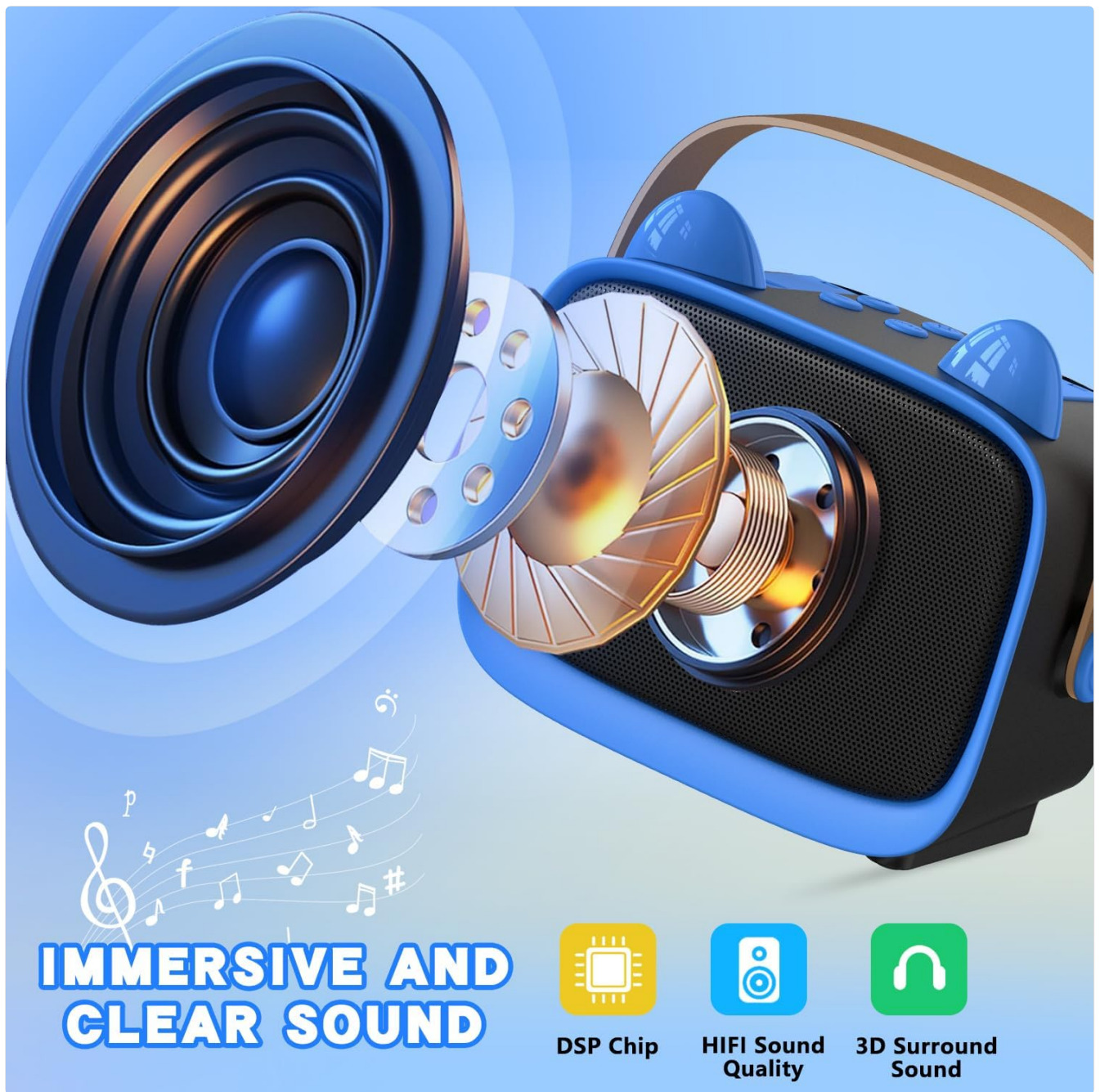
Image: Detailed view of the speaker's internal components, highlighting its sound quality.