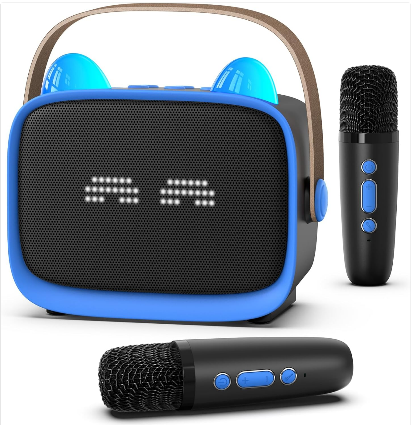
Image: All components included in the MgaoLo Mini Karaoke Machine package.