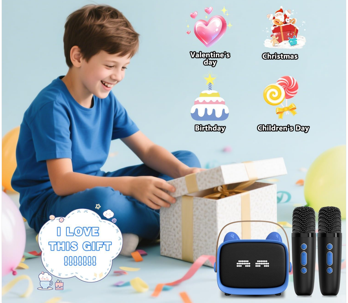
Image: Highlights the compact and portable design of the karaoke machine and microphones.