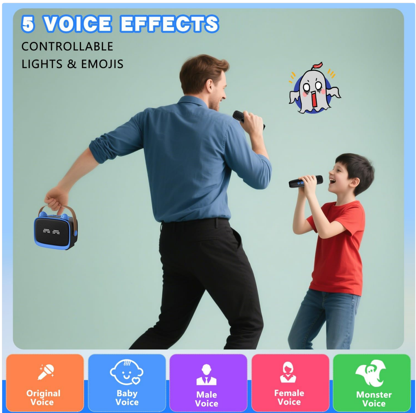
Image: Illustrates the five different voice effects available on the microphones.