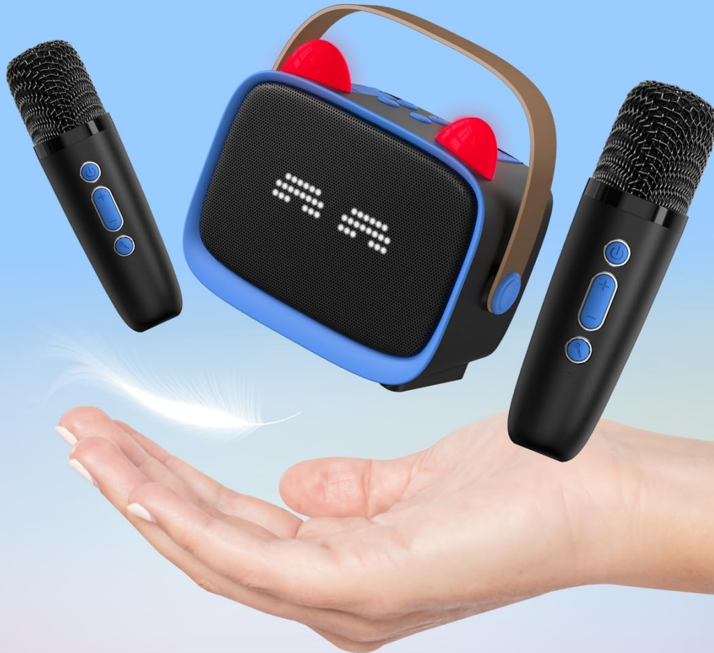
Image: Details the battery life and charging time for extended karaoke sessions.

MIKE 138*38*38mm 5.43*1.49*1.49 in 65G 2.29oz