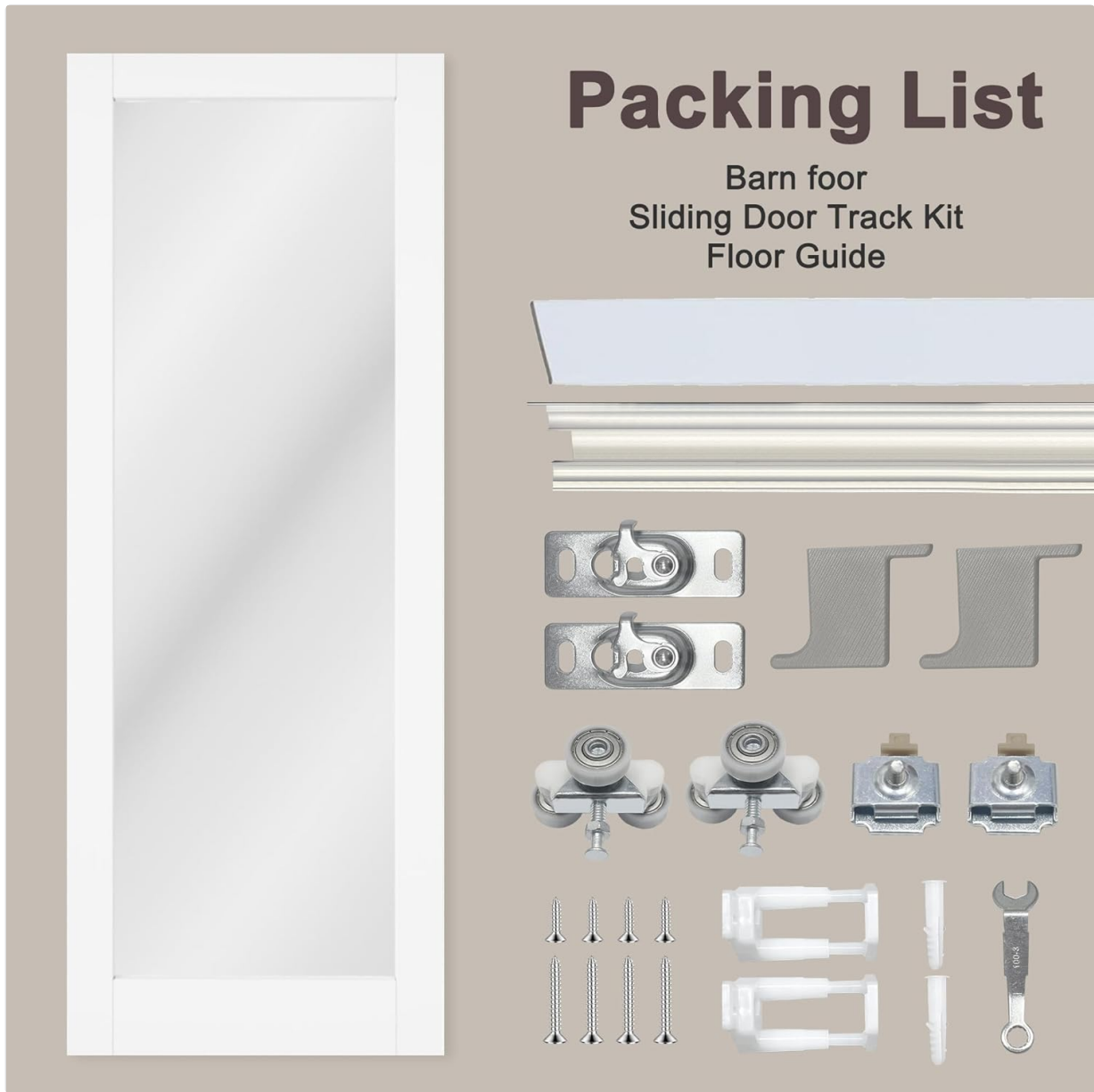
Image: Detailed packing list showing the barn door slab, sliding door track kit, floor guide, rollers, screws, and a wrench.