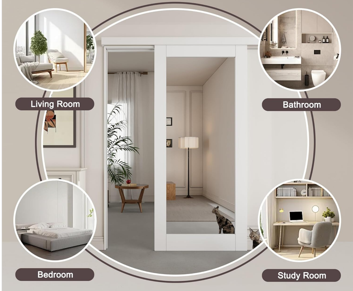
Image: Collage showing the mirrored sliding barn door being used in a living room, bathroom, bedroom, and study room, demonstrating its versatility.