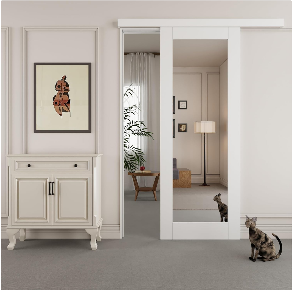
Image: A white mirrored sliding barn door installed in a room, showcasing its aesthetic and functional design.

The WIN STELLAR Mirrored Sliding Barn Door is designed for smooth and quiet operation, providing a space-saving solution for various rooms.