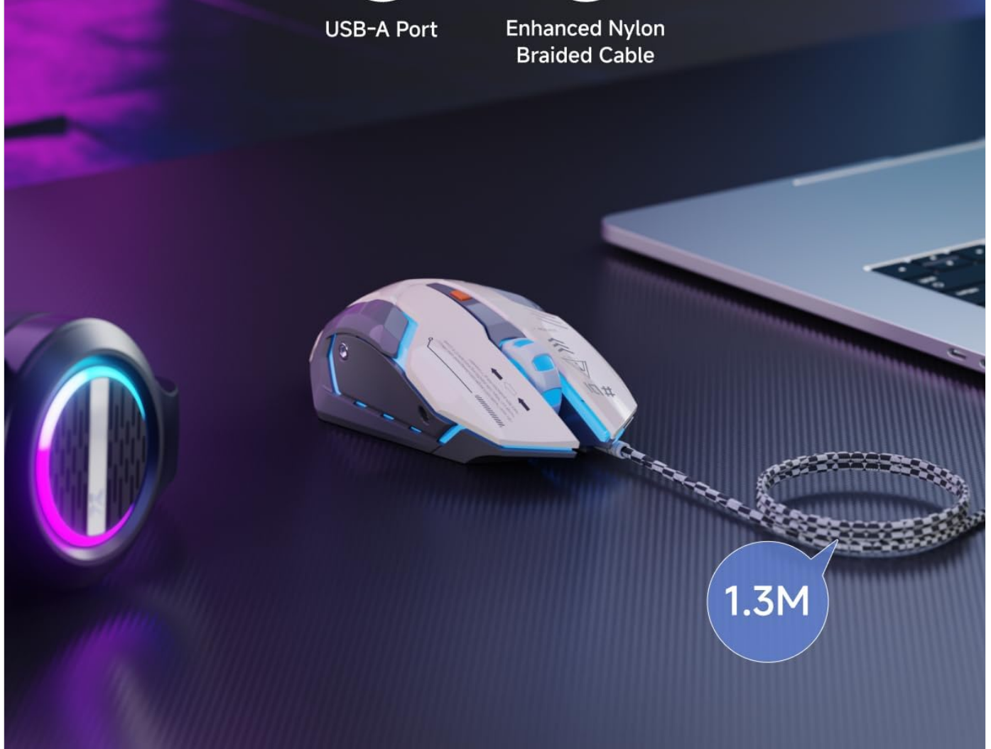
Figure 2: The EWEADN G10 mouse connected to a laptop, highlighting its USB-A port and enhanced nylon braided cable for easy plug-and-play setup.