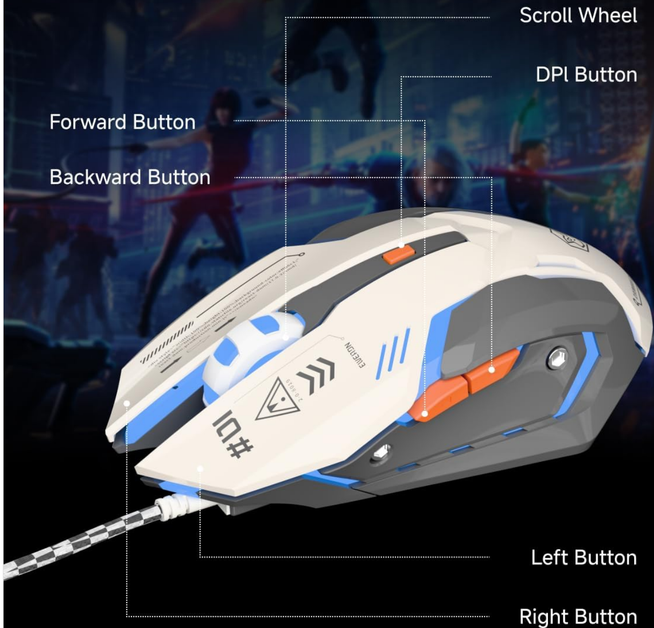
Figure 4: A detailed diagram illustrating the placement and labeling of the six functional buttons on the EWEADN G10 gaming mouse.