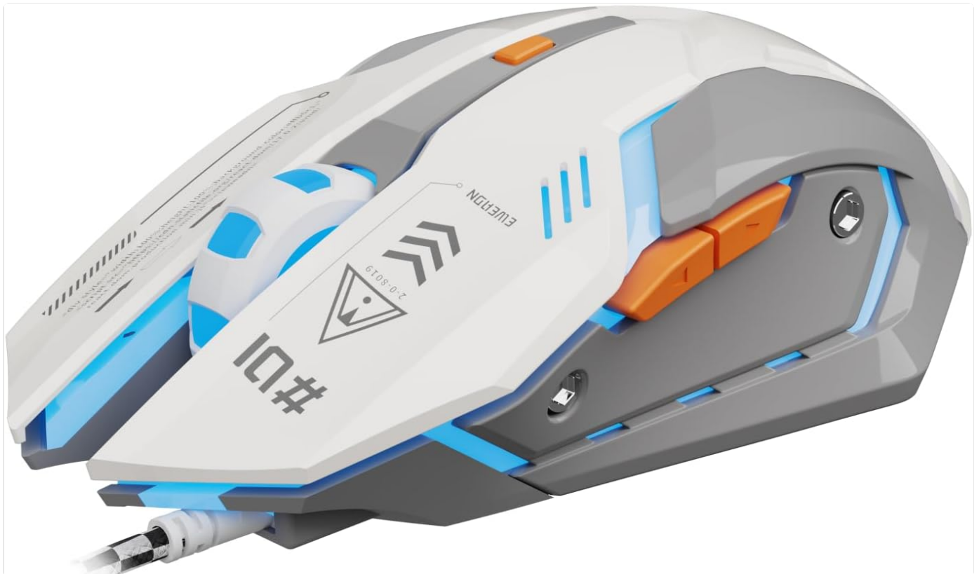
Figure 1: Top-down view of the EWEADN G10 Wired Gaming Mouse, showcasing its white and gray body with blue and orange accents and a braided USB cable.

The EWEADN G10 Wired Gaming Mouse is designed for an optimal gaming and computing experience. It features an ergonomic design, adjustable DPI settings, vibrant RGB backlighting, and quiet click buttons for minimal disturbance.