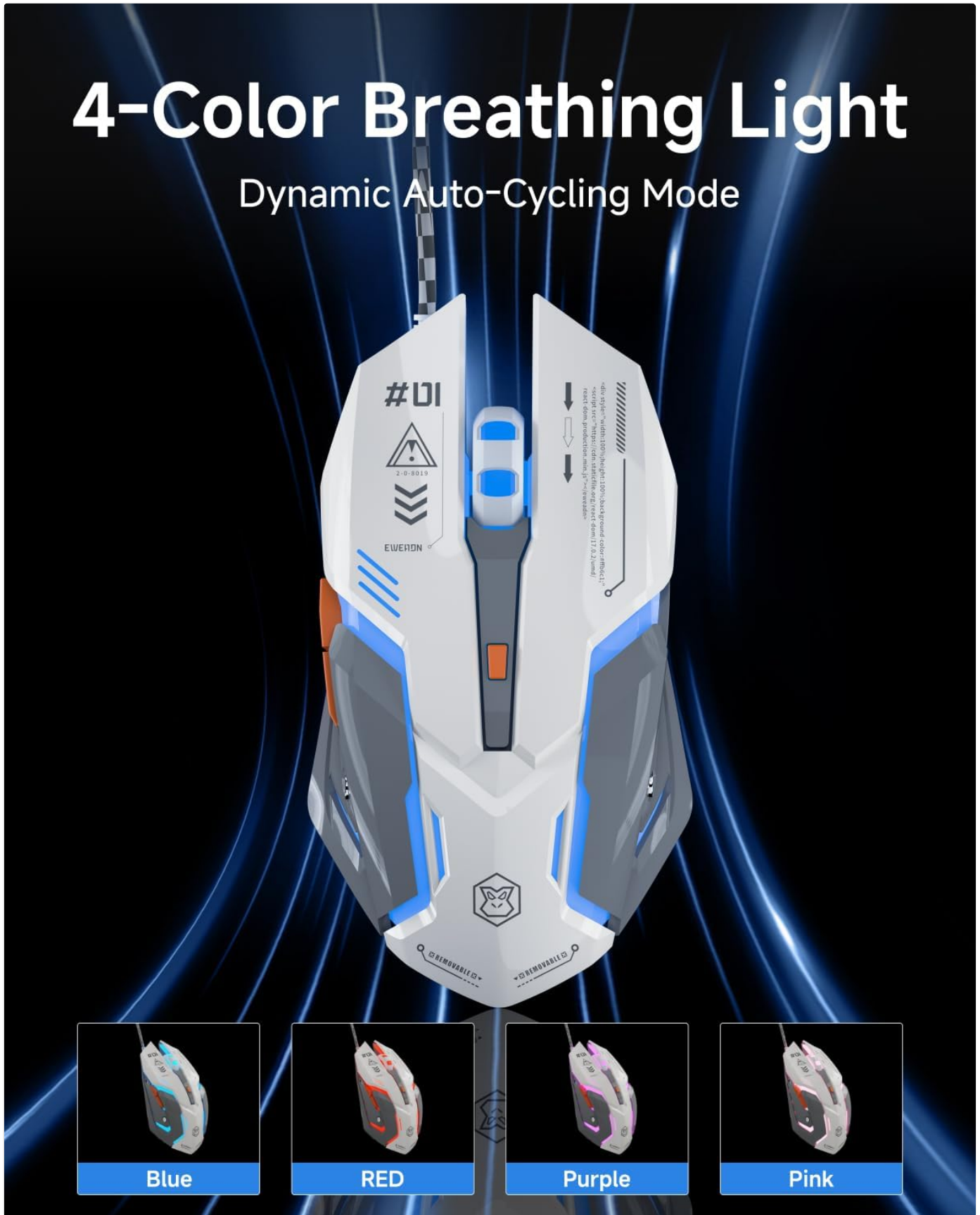
Figure 6: The EWEADN G10 mouse illuminated with its 4-color dynamic breathing light, cycling through blue, red, purple, and pink.