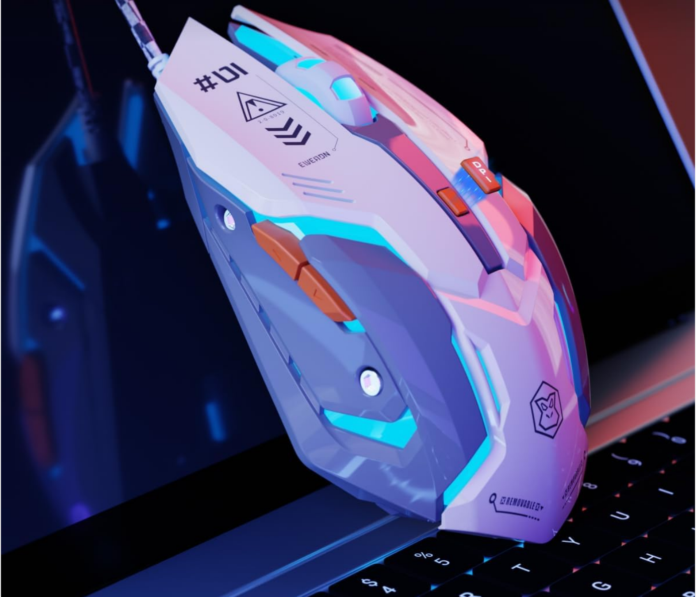
Figure 5: The EWEADN G10 mouse showcasing its adjustable DPI settings, allowing users to switch between 800, 1200, 2400, and 3200 DPI for varied precision needs.