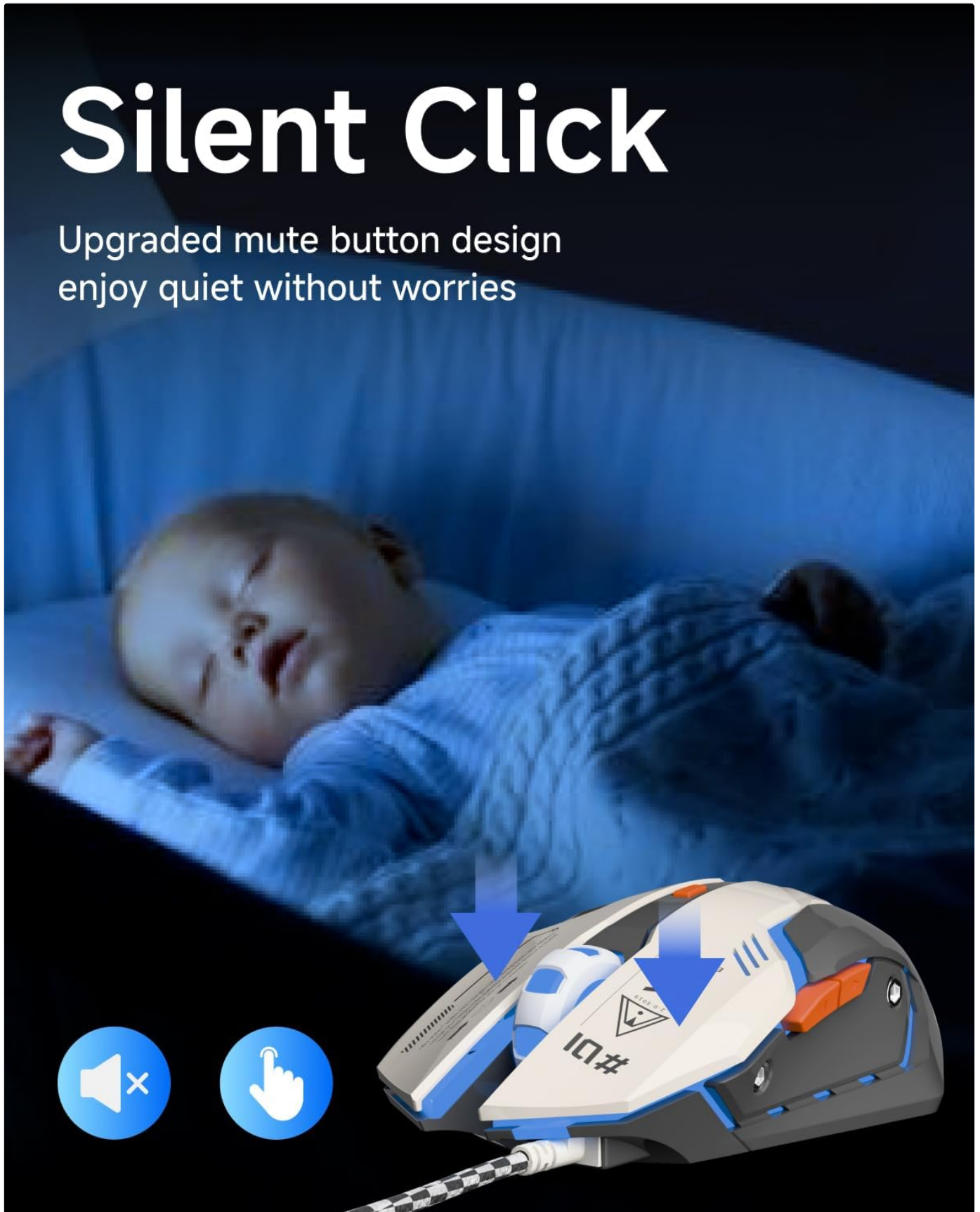
Figure 7: The EWEADN G10 mouse demonstrating its silent click capability, ensuring minimal noise disturbance, even in quiet environments.

Upgraded mute button design enjoy quiet without worries