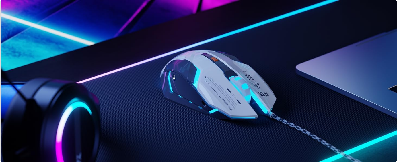
Figure 3: Illustration of the EWEADN G10 mouse's broad compatibility with various Microsoft Windows operating systems.