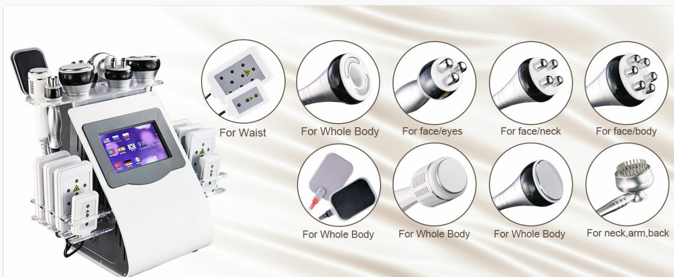
Figure 5: Illustrates the various body areas where the device can be applied, including face, arms, waist, back, buttocks, and legs.

The device is suitable for various body parts: