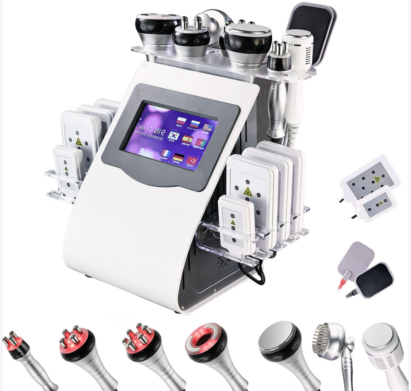
Figure 1: The amilibeaauty 9-in-1 Multifunction Facial & Body Care Device with various handles and accessories.