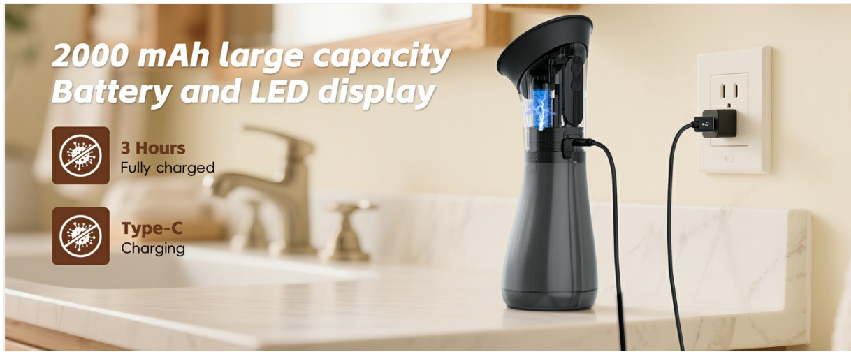
Image: The Temodu Ear Cleaner connected to a charger, highlighting its 2000mAh battery and LED display.