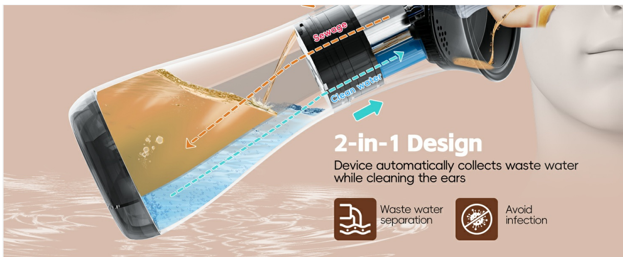
Image: Diagram of the 2-in-1 water tank design, separating clean water from wastewater.