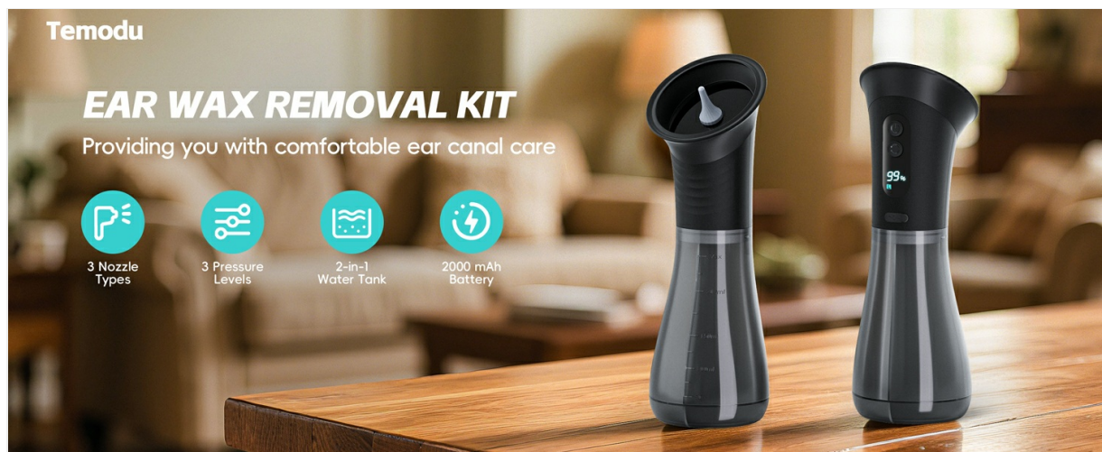
Image: Temodu Ear Wax Removal Kit highlighting key features.

The Temodu Electric Ear Cleaner E80-C is designed to provide a safe and effective solution for ear wax removal at home. This device features an integrated dual-tank system, an LED display, and three adjustable pressure modes to ensure a comfortable and thorough cleaning experience. Please read this manual carefully before use to ensure proper operation and to maximize the lifespan of your device.