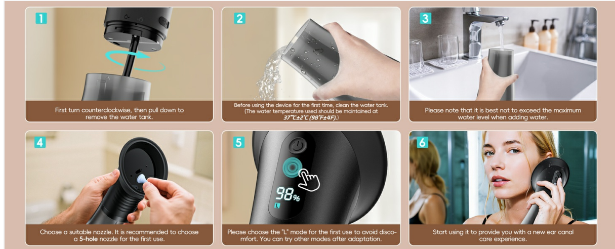
Image: Step-by-step guide for initial setup and use.