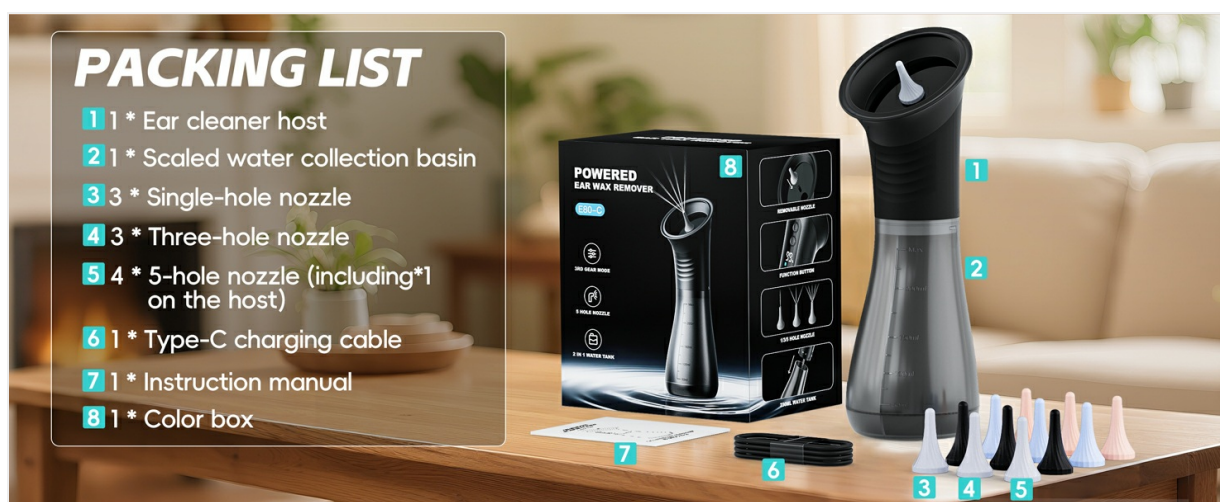
Image: Detailed packing list of the Temodu Ear Wax Removal Kit.