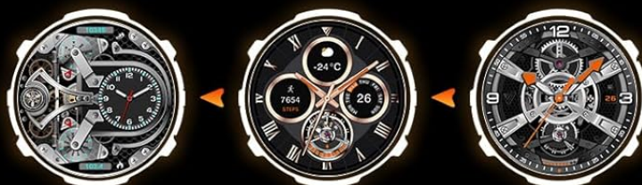
Figure 8: Sports Tracking features.

"Da Fit" dial market offers more than 100 beautiful dials, and you can also use your favorite photos as dials