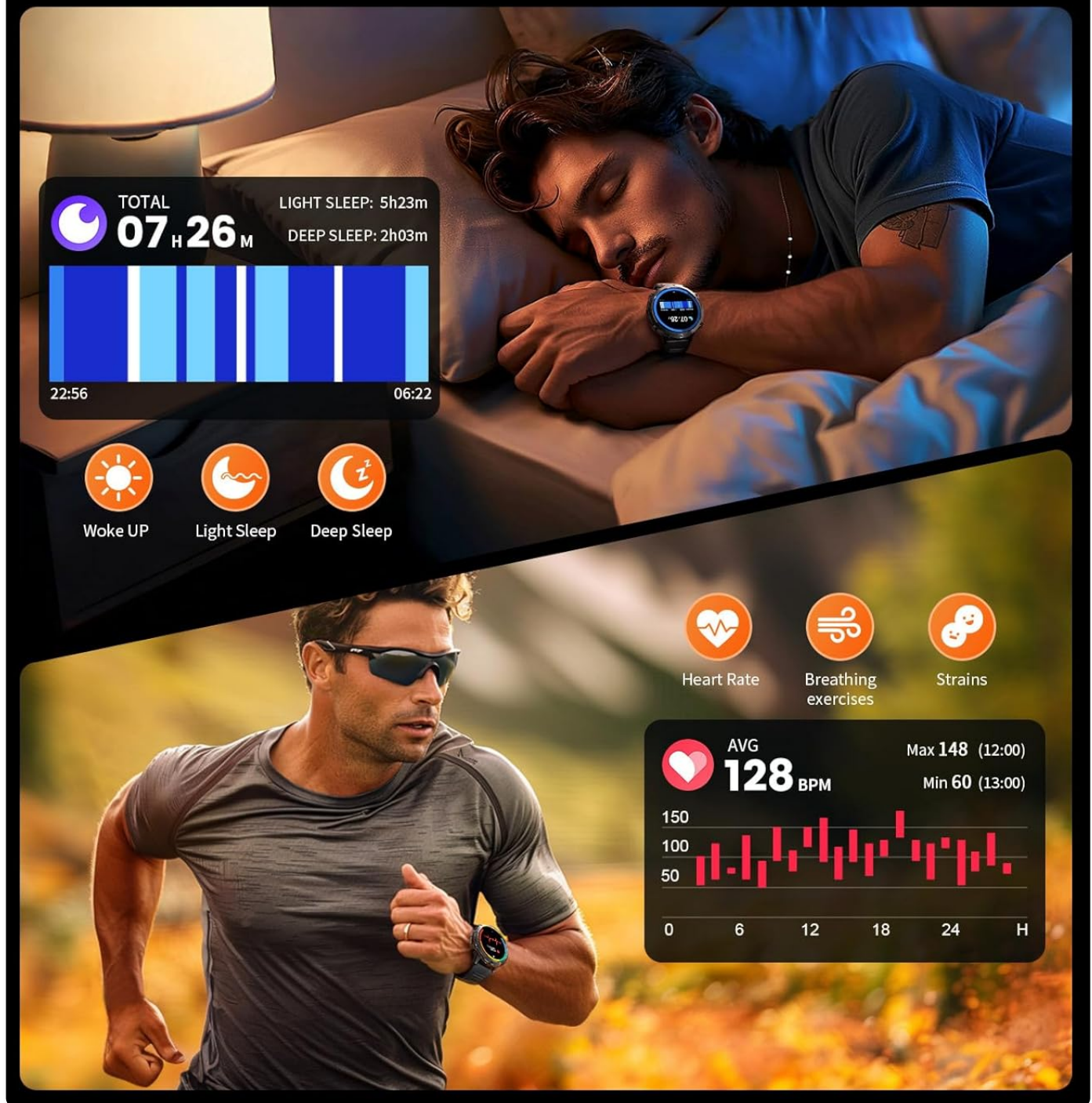
Figure 7: Health Monitoring features.