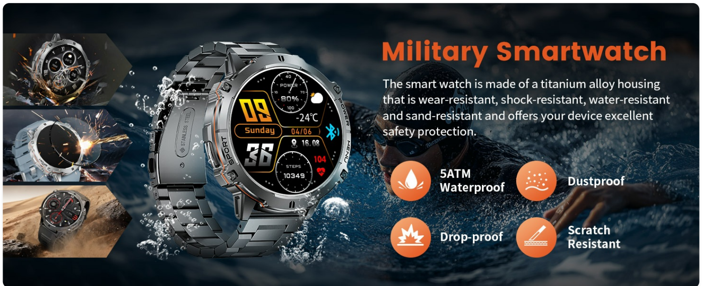
Figure 9: Additional Smartwatch functions.