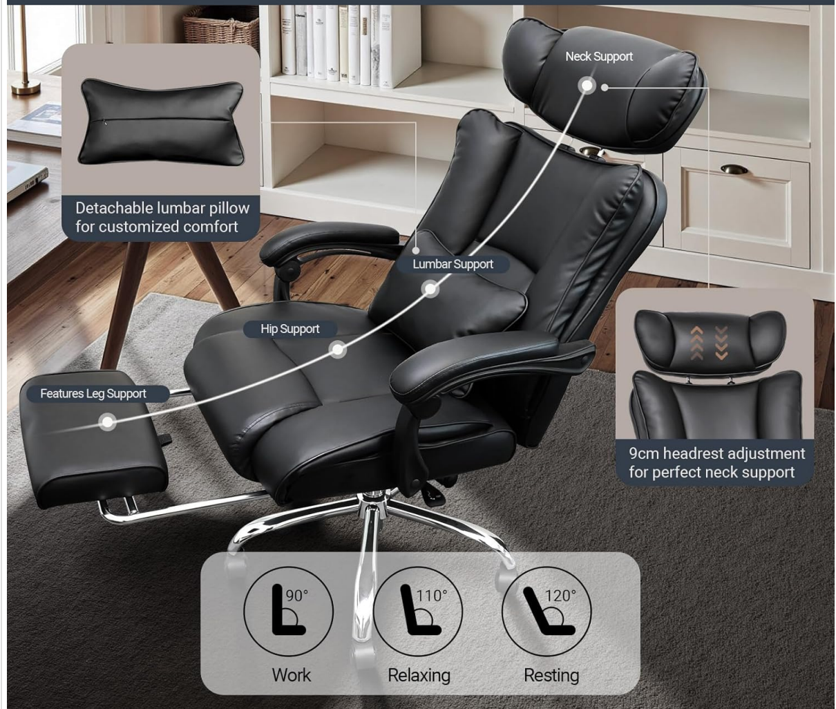
Image: Illustration of the chair's arbitrary angle locking feature from 90° to 120°.