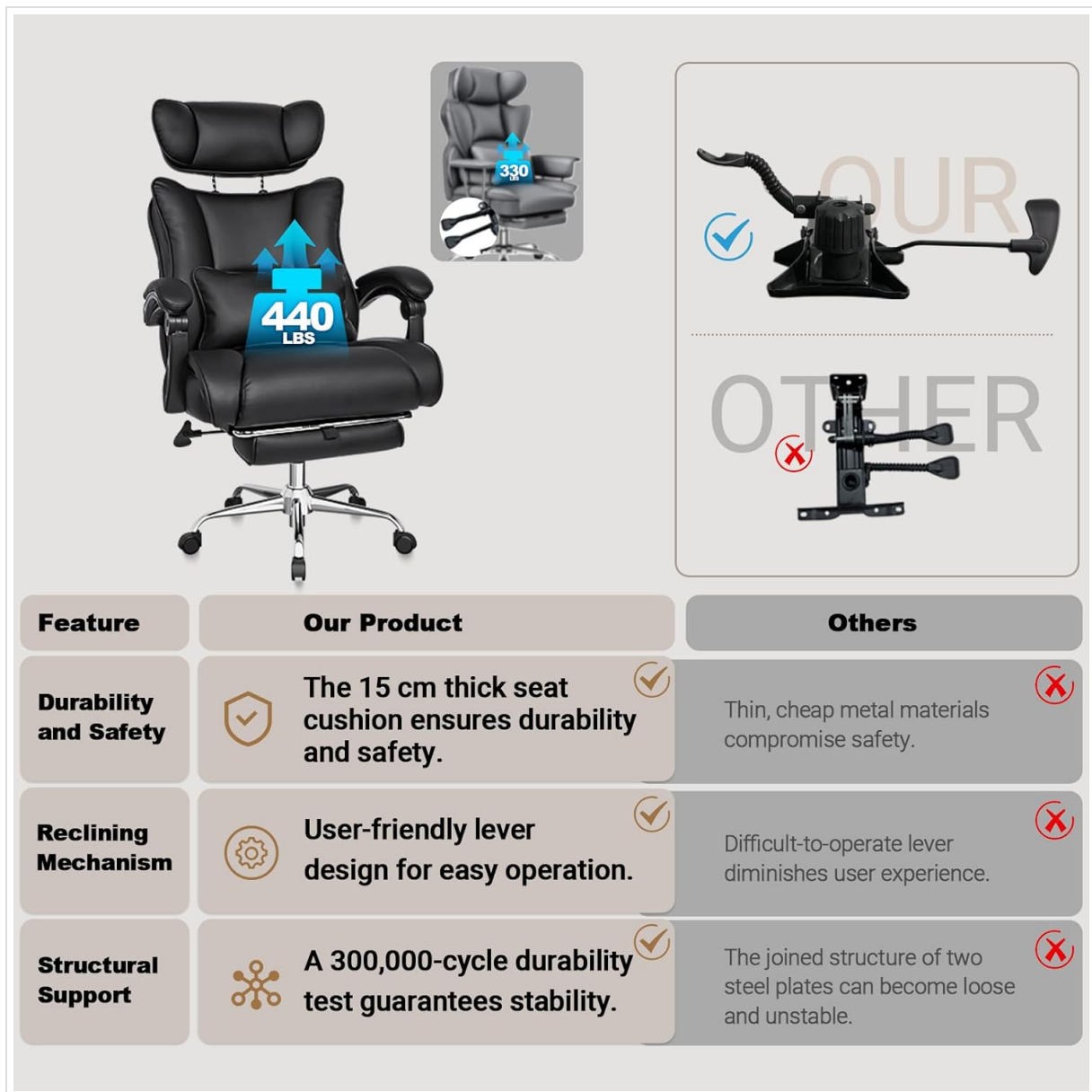
Image: Diagram illustrating the chair's compliance with quality and durability tests, including TÜV certification.