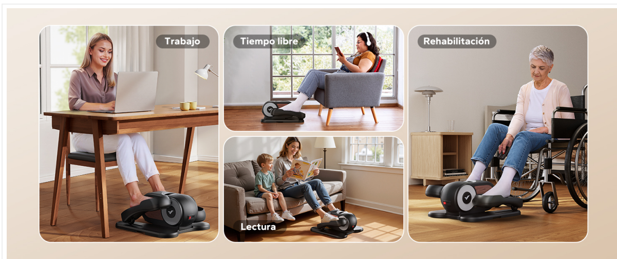
Image: Examples of using the elliptical during work, leisure, rehabilitation, and reading.

The MERACH E32-2025 Mini Electric Elliptical is versatile and can be used in various settings to integrate physical activity into your daily routine.