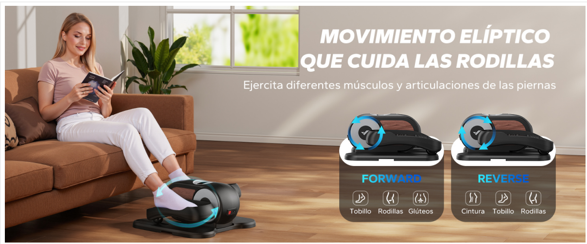
Image: Illustration of the MERACH E32-2025's knee-caring elliptical movement, demonstrating its benefits for various leg muscles and joints.