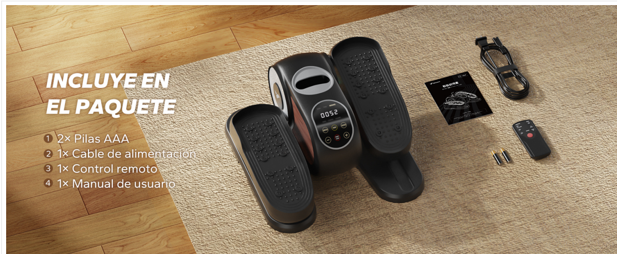
Image: Contents included in the MERACH E32-2025 package: elliptical machine, remote control, power cable, AAA batteries, and user manual.