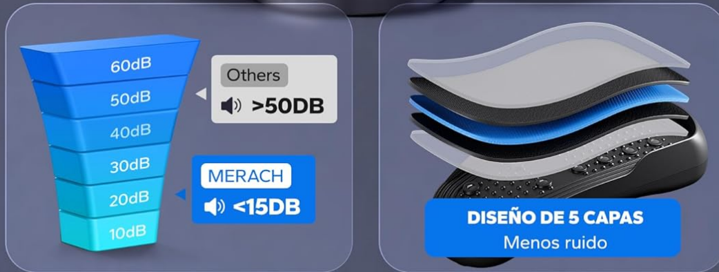
Image: Visual representation of the MERACH E32-2025's lightweight design and low noise output.