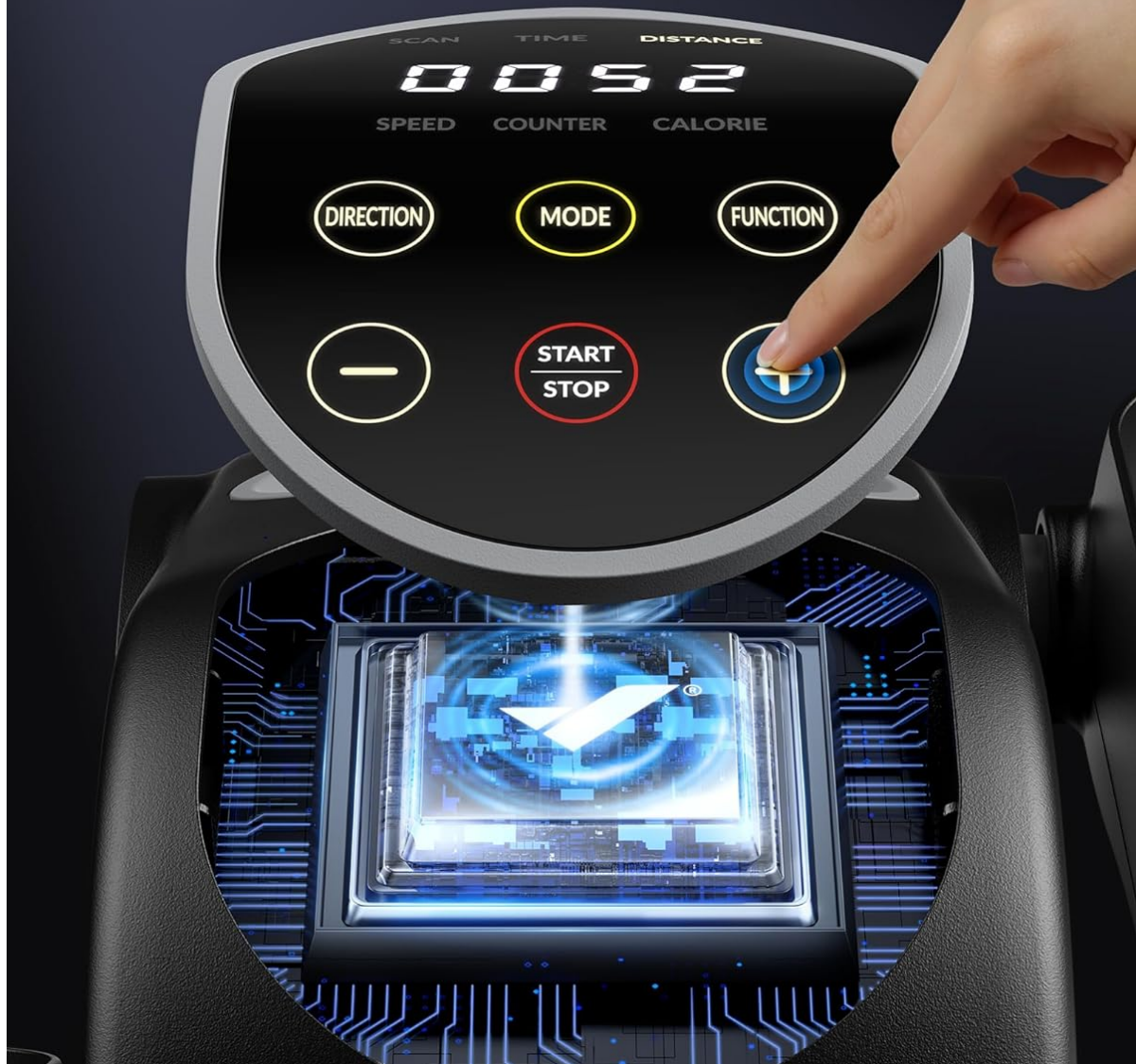
Image: Close-up of the MERACH E32-2025 control panel and remote control, showing various function buttons.

Núcleo inteligente – Velocidad, Precisión, Fiabilidad