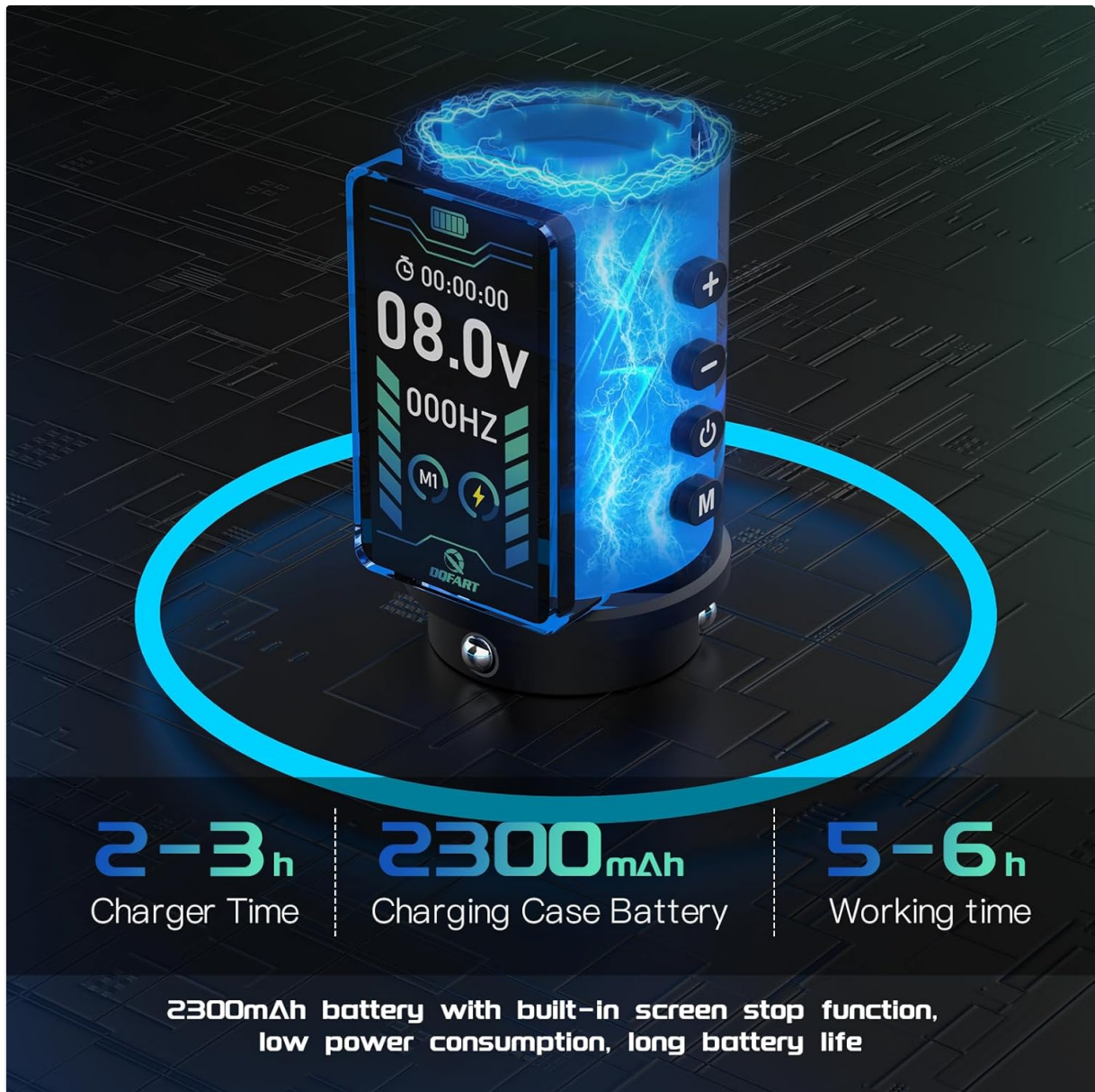
Image: DQFART Wireless Tattoo Machine Battery Charging Information. This image illustrates the charging time, battery capacity, and working time of the machine.