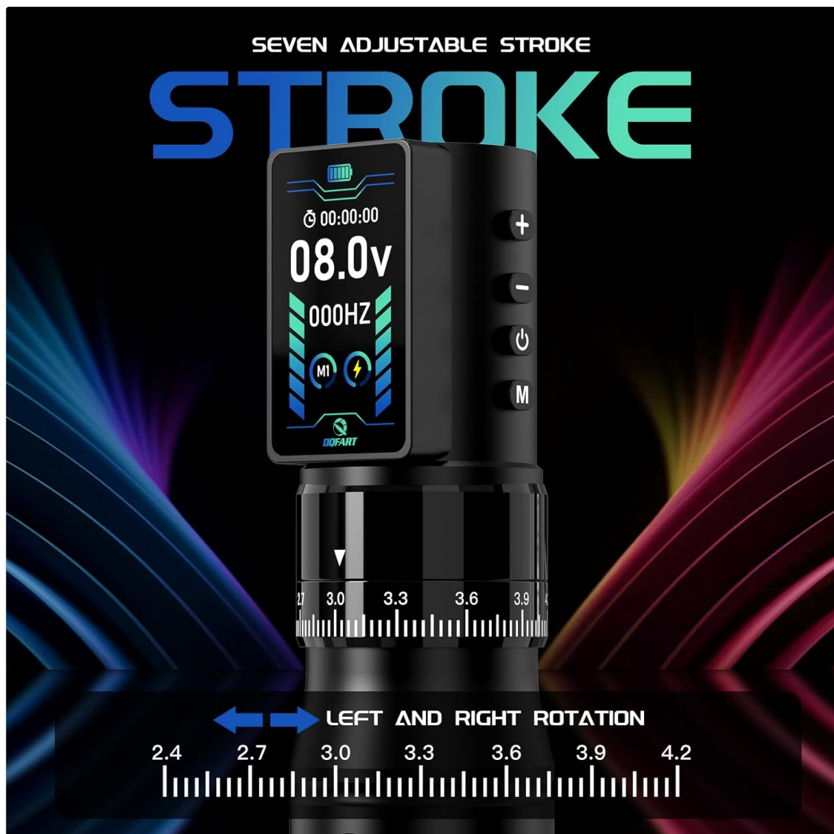
Image: DQFART Wireless Tattoo Machine Adjustable Stroke Length. This image shows the stroke adjustment ring and the range of available stroke lengths from 2.4mm to 4.2mm.

The DQFART Wireless Tattoo Machine offers 7 adjustable stroke lengths from 2.4mm to 4.2mm. To adjust: