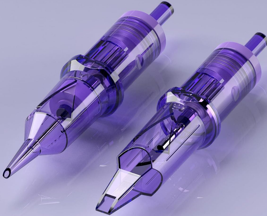
Image: DQFART Tattoo Cartridge Needle Nozzle. This image shows the transparent design of the needle nozzle for clear visibility.

The side of the needle shell is shaped like an arrow Transparent like glass, the needle thread runs clearly and is easy to observe