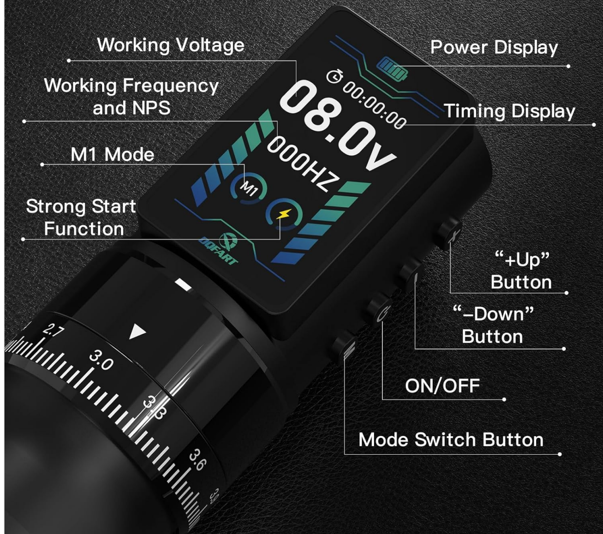
Image: DQFART Wireless Tattoo Machine LCD Display and Controls. This image highlights the various indicators and buttons on the machine's display and body.