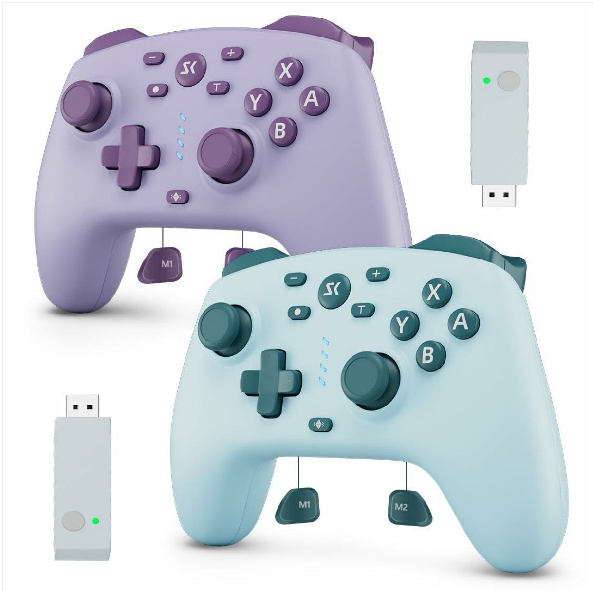
Image 1: Boowen Wireless Controllers in Lake Blue and Purple, showcasing the overall design.