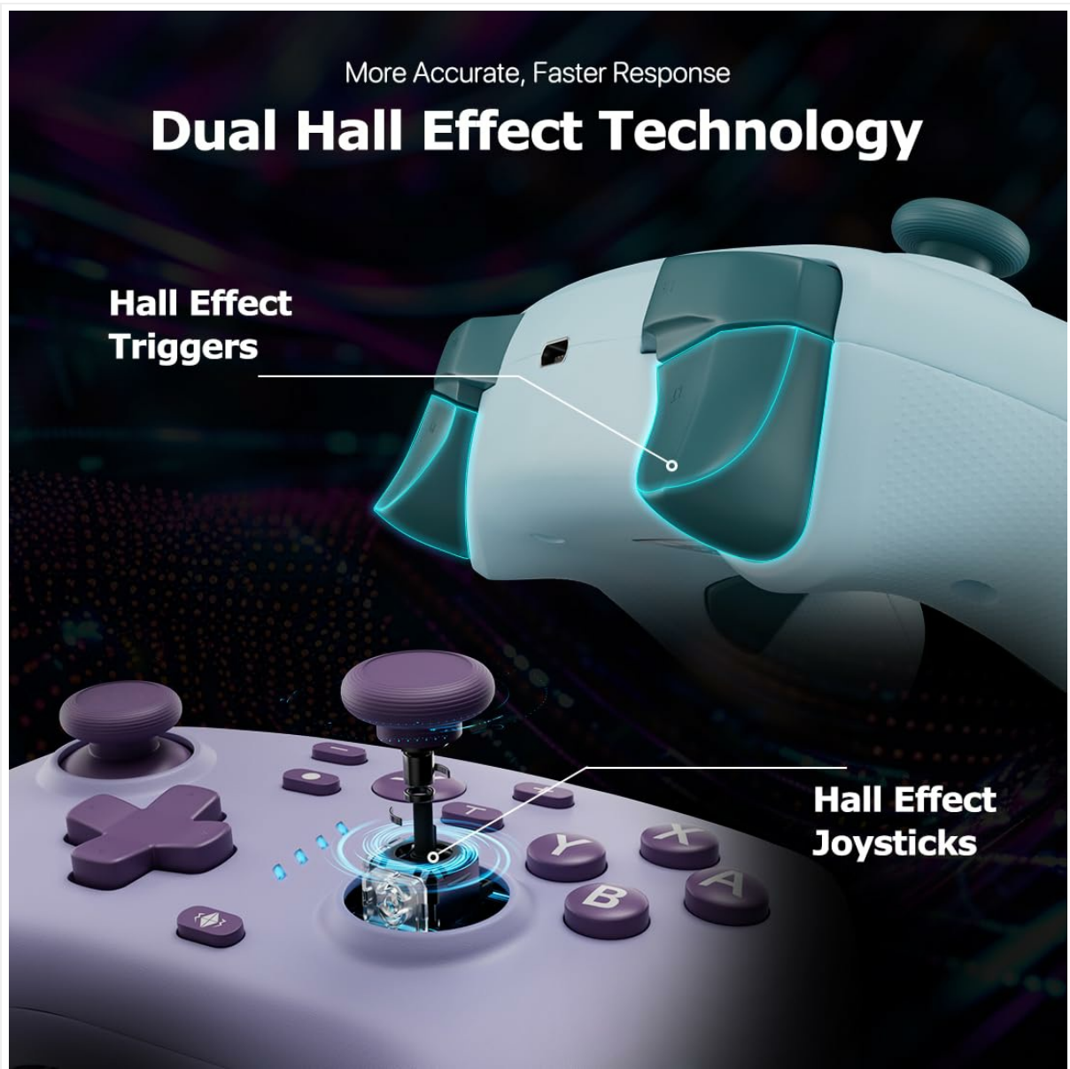
Image 2: Detailed view highlighting the Hall Effect Joysticks and Triggers for enhanced precision and durability.