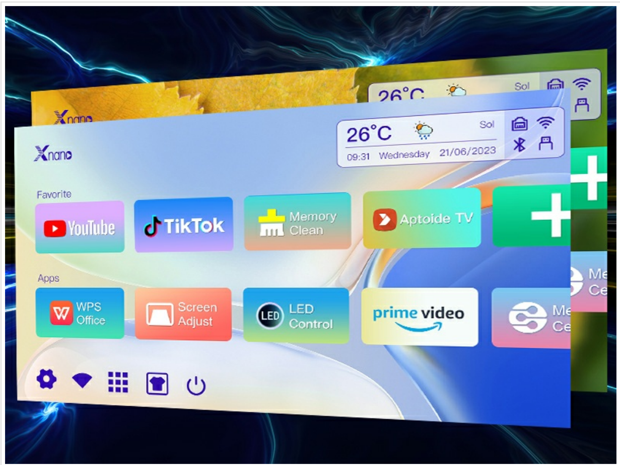
Image: A screenshot of the XNANO projector's user interface, displaying various apps and settings options.