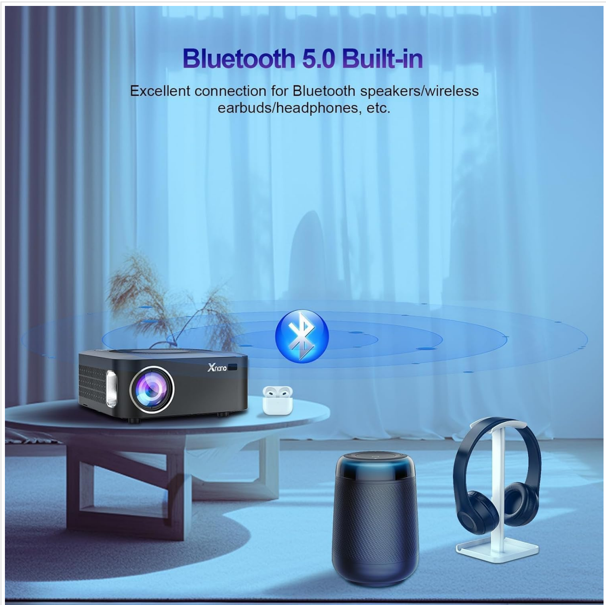
Image: The projector connected via Bluetooth to a wireless speaker and headphones, demonstrating Bluetooth 5.0 functionality.

Excellent connection for Bluetooth speakers/wireless earbuds/headphones, etc.