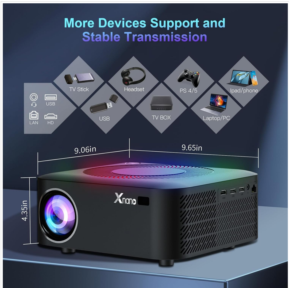
Image: A diagram showing the projector's ports (LAN, HD, USB) and various compatible devices such as TV sticks, headsets, gaming consoles, iPads/phones, and laptops/PCs.