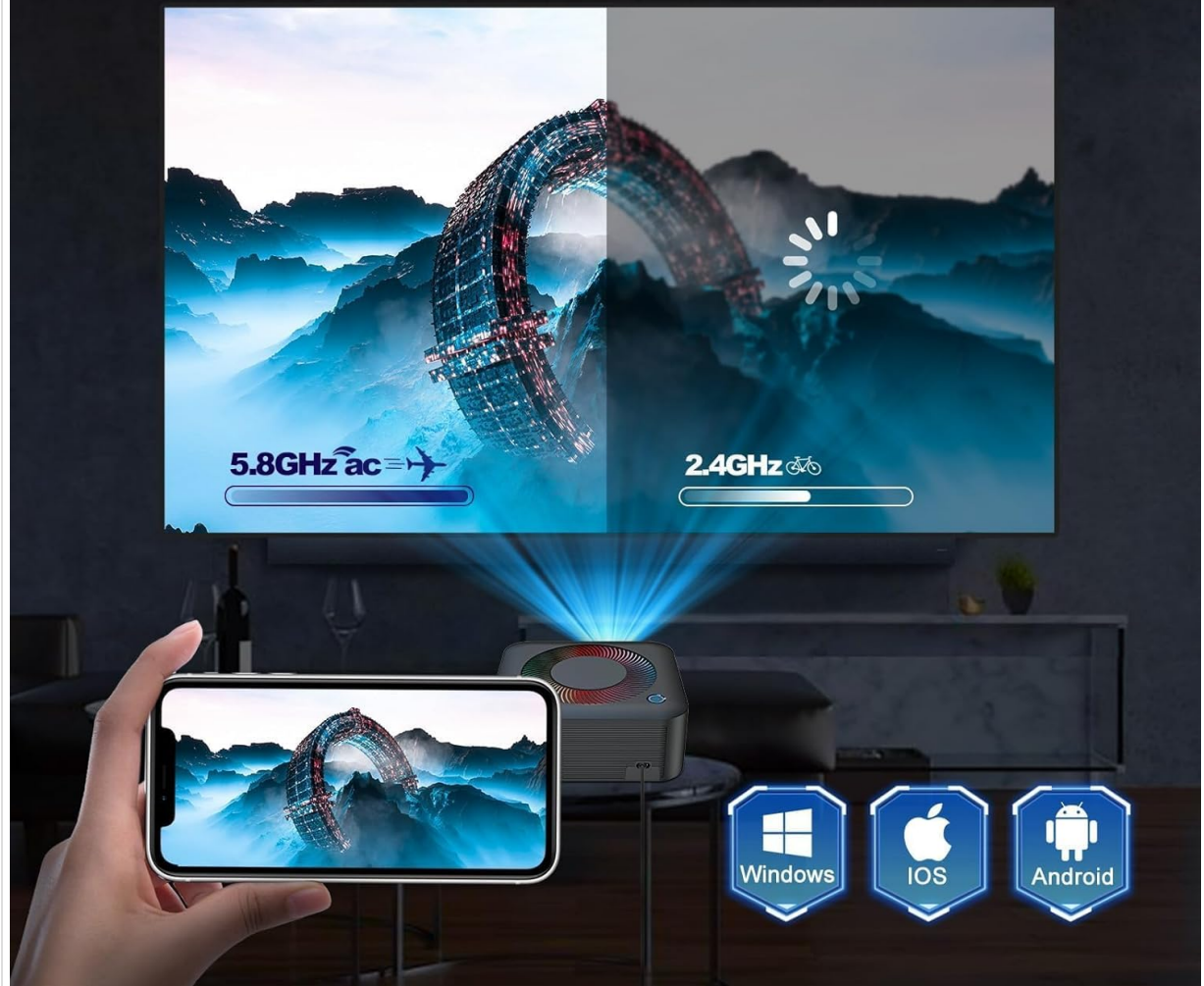
Image: Illustration of the projector's dual-band 2.4GHz and 5GHz WiFi capabilities, showing improved wireless connectivity.

Enhance wireless connectivity stability and speed to provide you with a better experience.