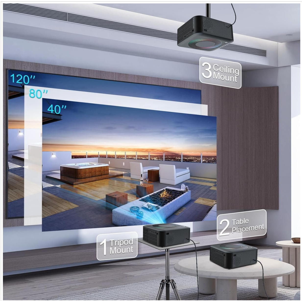
Image: Diagram illustrating various projector placement options including tripod, table, and ceiling mounting for different screen sizes (40", 80", 120").