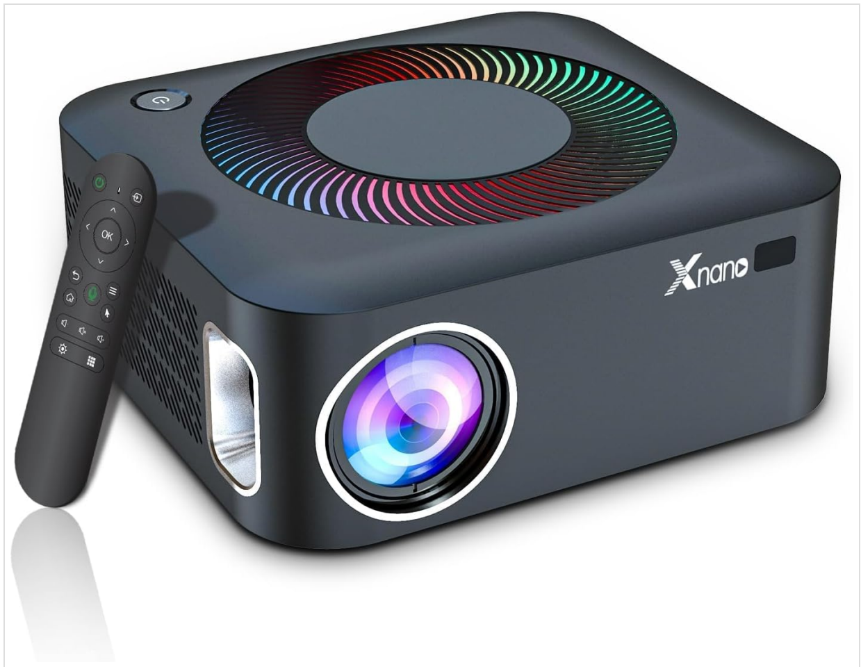
Image: The XNANO X5A projector shown with its accompanying remote control.