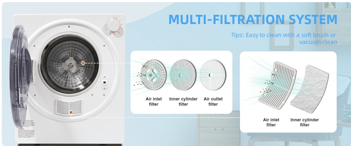
Figure 6: Illustration of the dryer's multi-filtration system and recommended cleaning method.