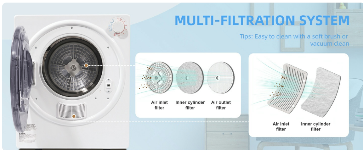
Figure 2: Diagram illustrating the multi-filtration system, including air inlet filter, inner cylinder filter, and air outlet filter.