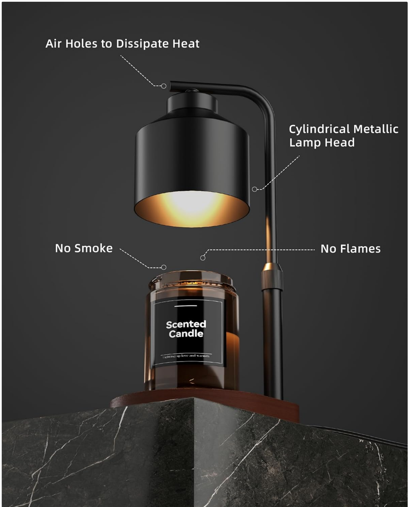
Figure 2: Flameless and smokeless operation of the candle warmer lamp.