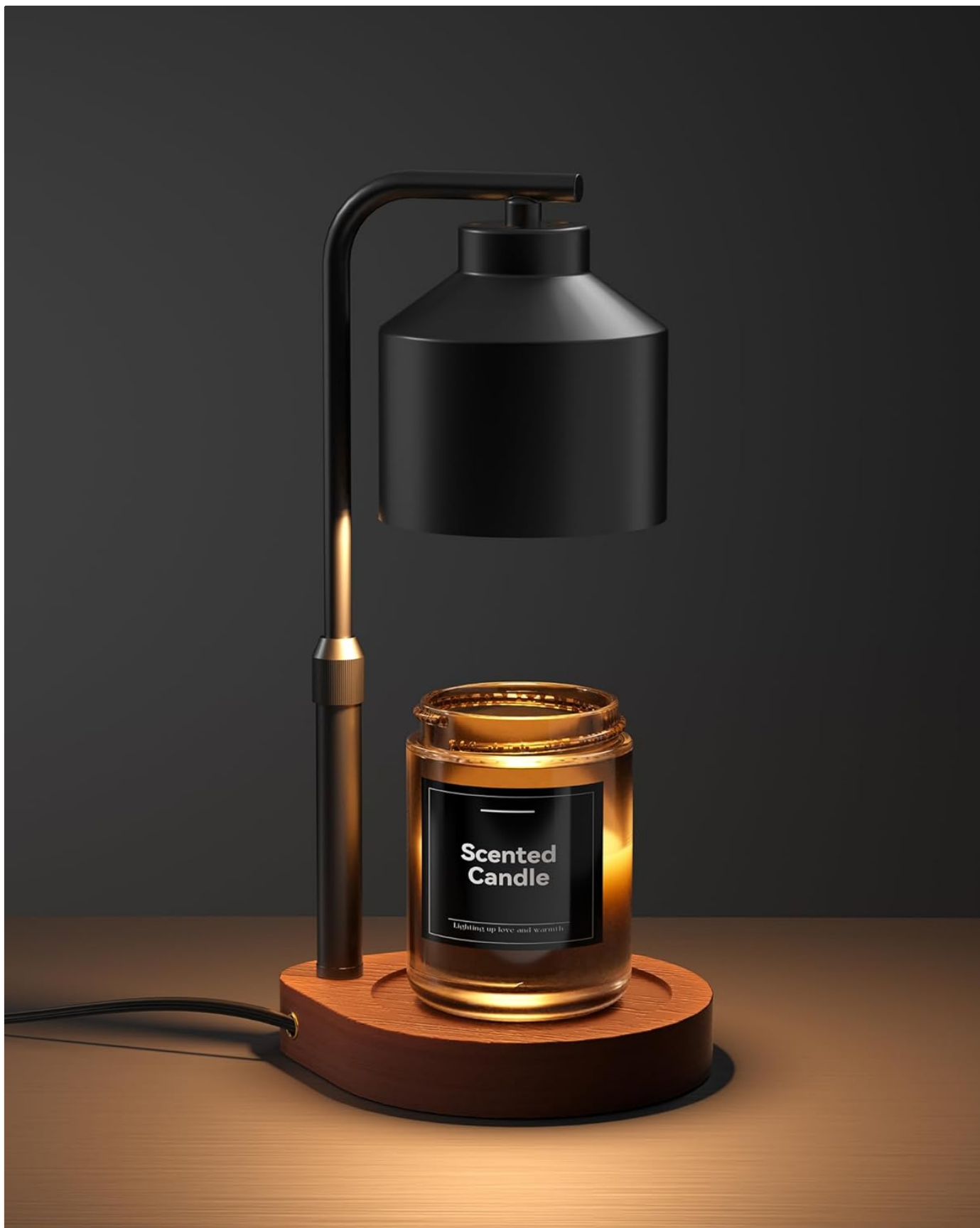
Figure 1: Cozmara Candle Warmer Lamp in black with a scented candle.