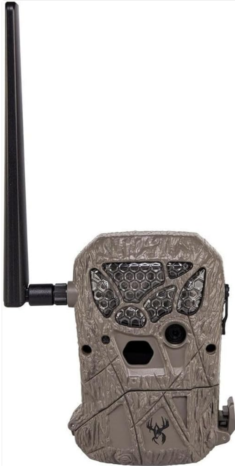
Figure 1: Front view of the Encounter Trail Cellular Camera with antenna attached.