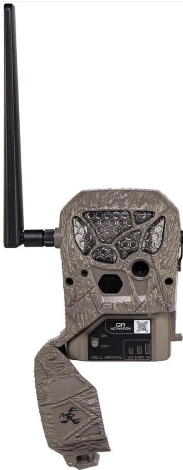
Figure 2: Side view of the Encounter Trail Cellular Camera, highlighting the QR code for activation.