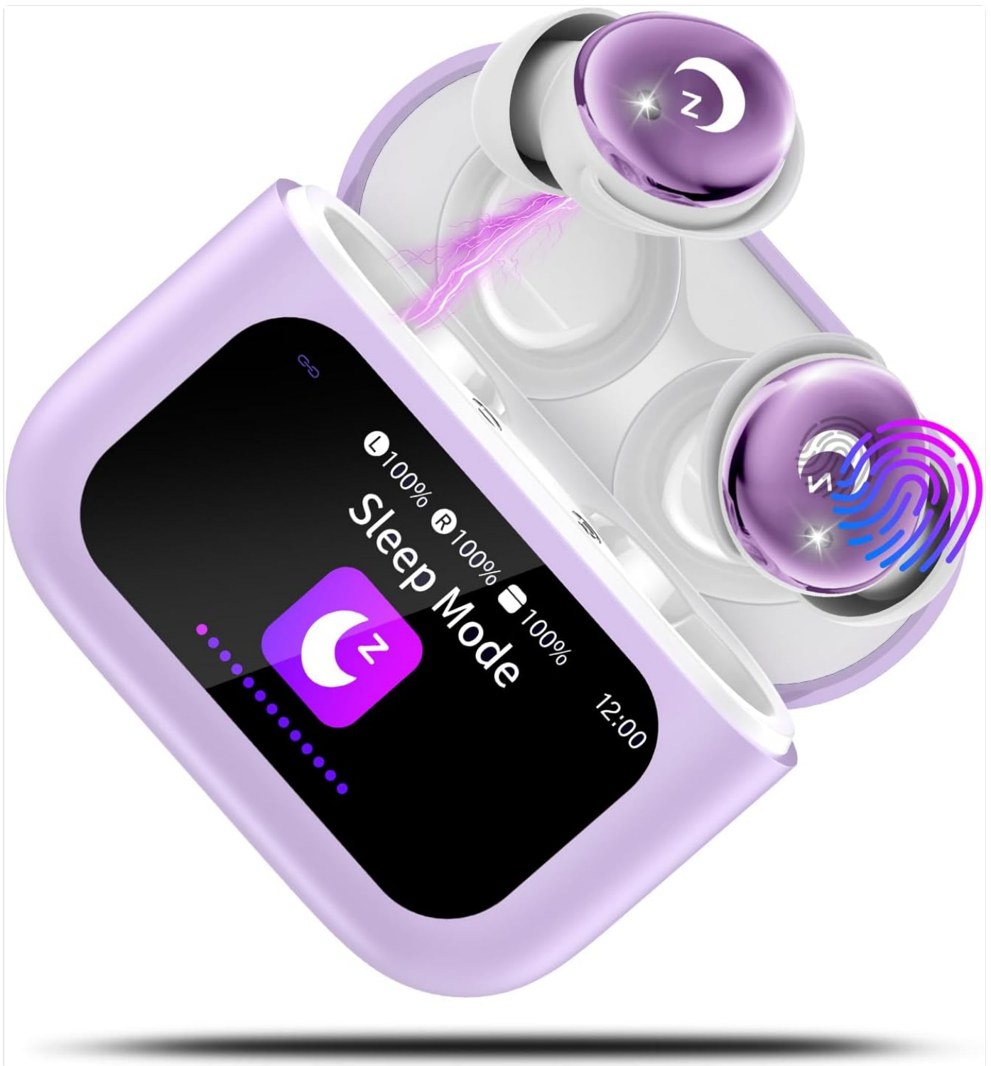
Image: The VEKJ L8 Pro Sleep Earbuds and their charging case. The earbuds are purple and are shown partially inserted into the charging case, which features a digital display indicating battery levels and "Sleep Mode".