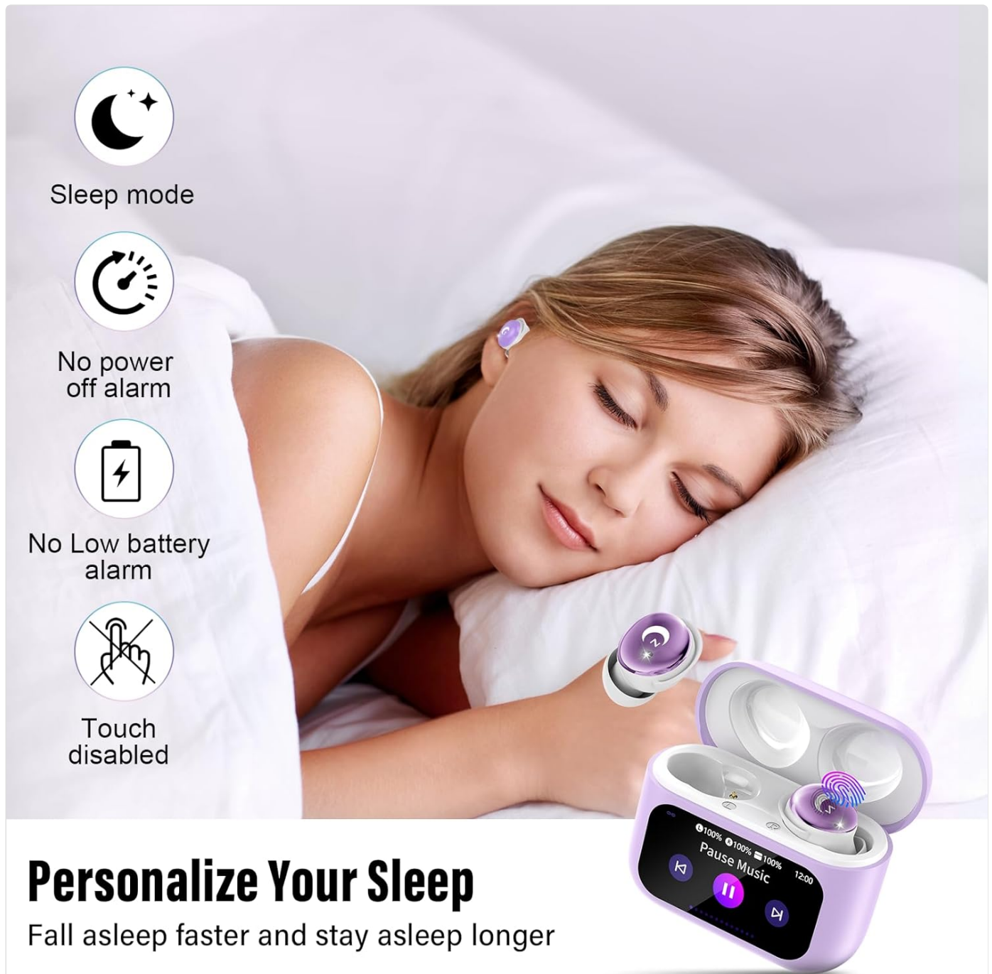
Image: A person sleeping peacefully while wearing the VEKJ L8 Pro earbuds. The image highlights the "Personalize Your Sleep" feature and icons representing sleep mode, no power off alarm, no low battery alarm, and touch disabled functions.