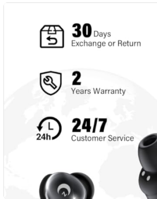
Image: Icons depicting key customer service aspects: 30 Days Exchange or Return, 2 Years Warranty, and 24/7 Customer Service, ensuring comprehensive support for the product.