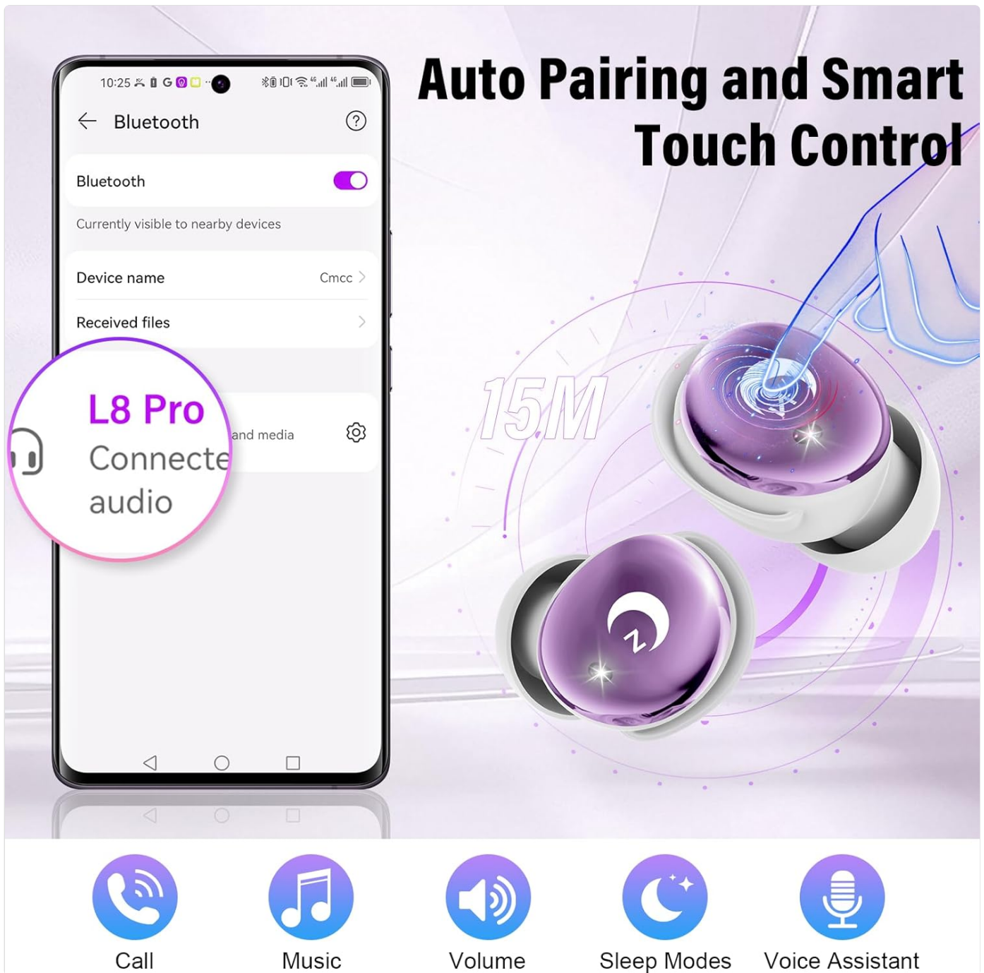
Image: A smartphone screen displaying Bluetooth settings with "L8 Pro Connected audio" visible. The image also shows the L8 Pro earbuds and charging case, emphasizing automatic pairing and smart touch control.