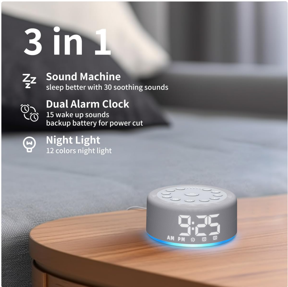
Figure 2: Overview of the 3-in-1 functionality.