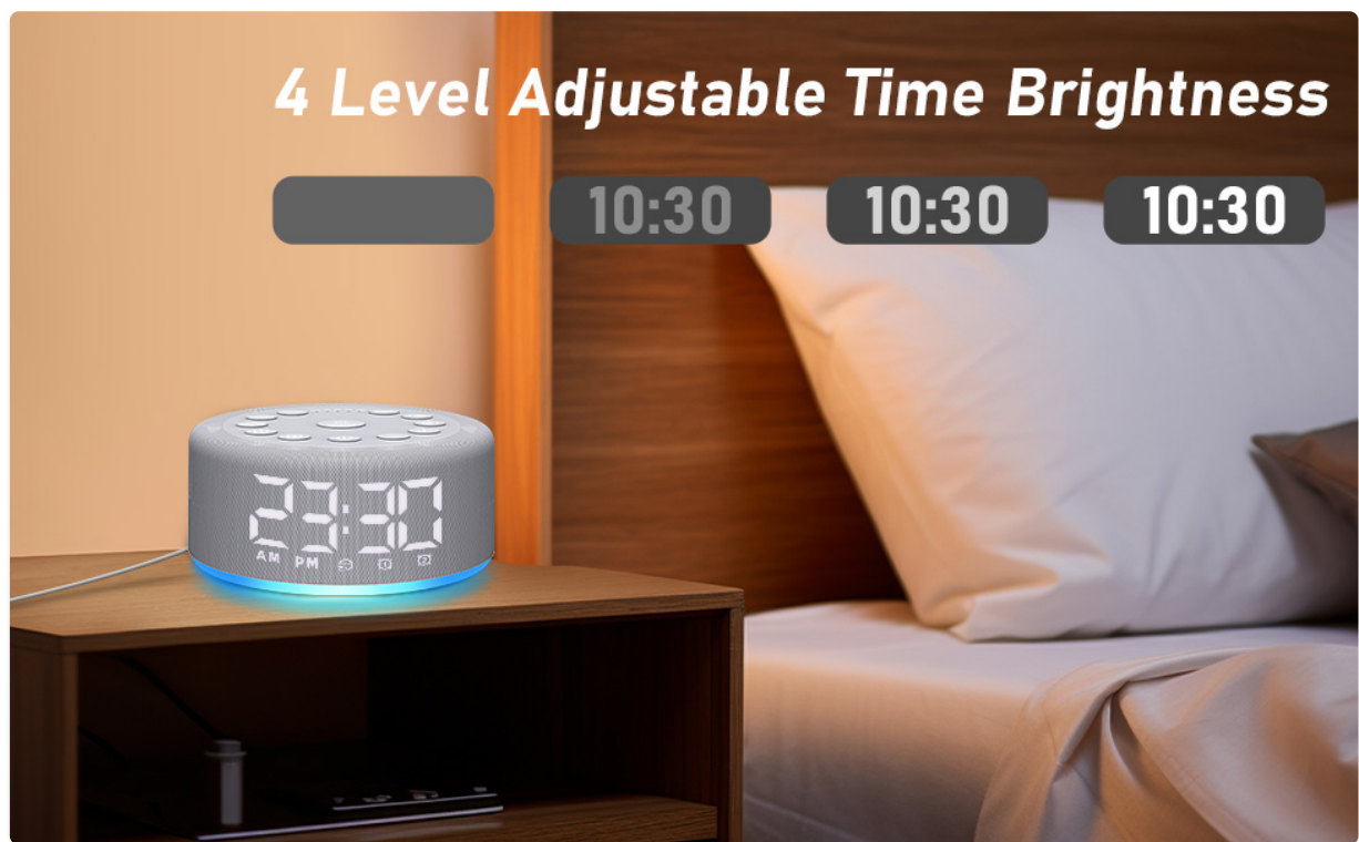
Figure 9: Adjustable time display brightness levels.