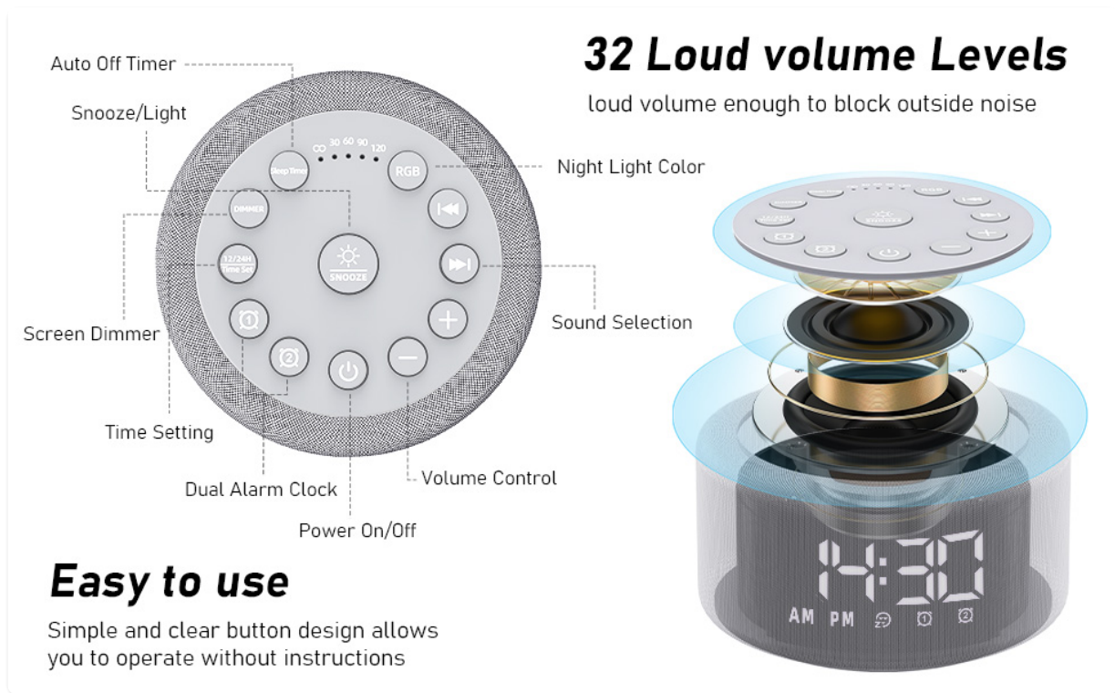
Figure 4: Button layout and functions for easy operation.