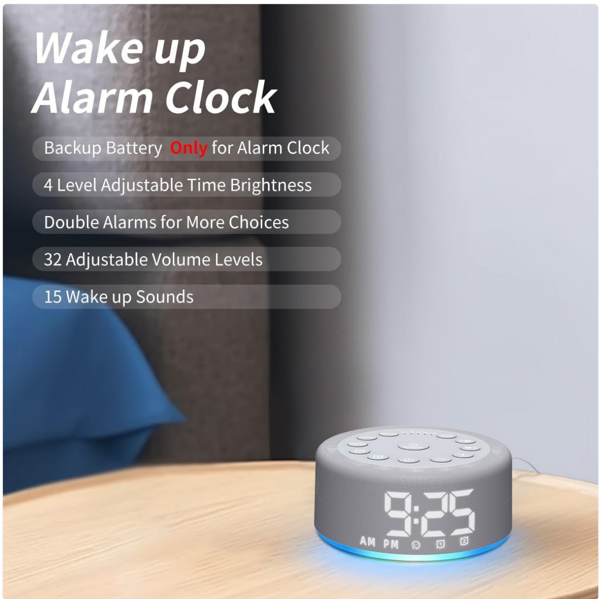
Figure 5: Key features of the alarm clock function.