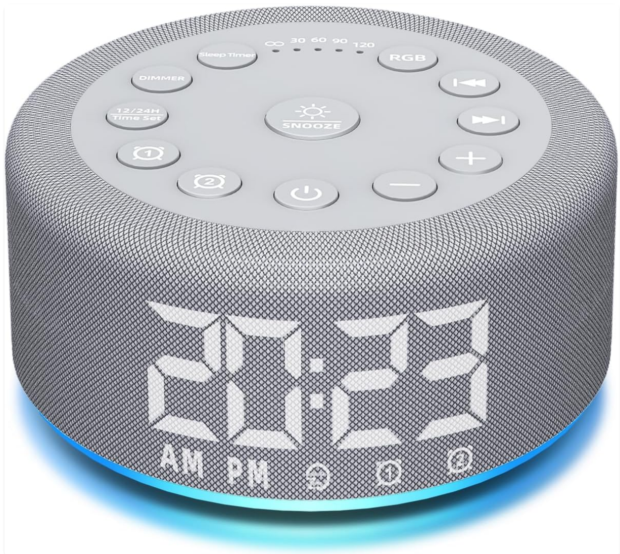
Figure 1: Front view of the Hushing Sound Machine Alarm Clock F4.