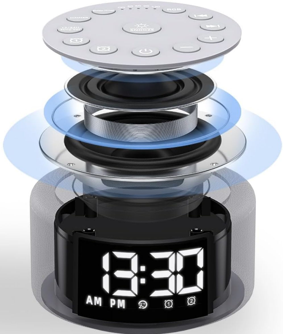
Figure 7: Internal speaker design and volume capabilities.