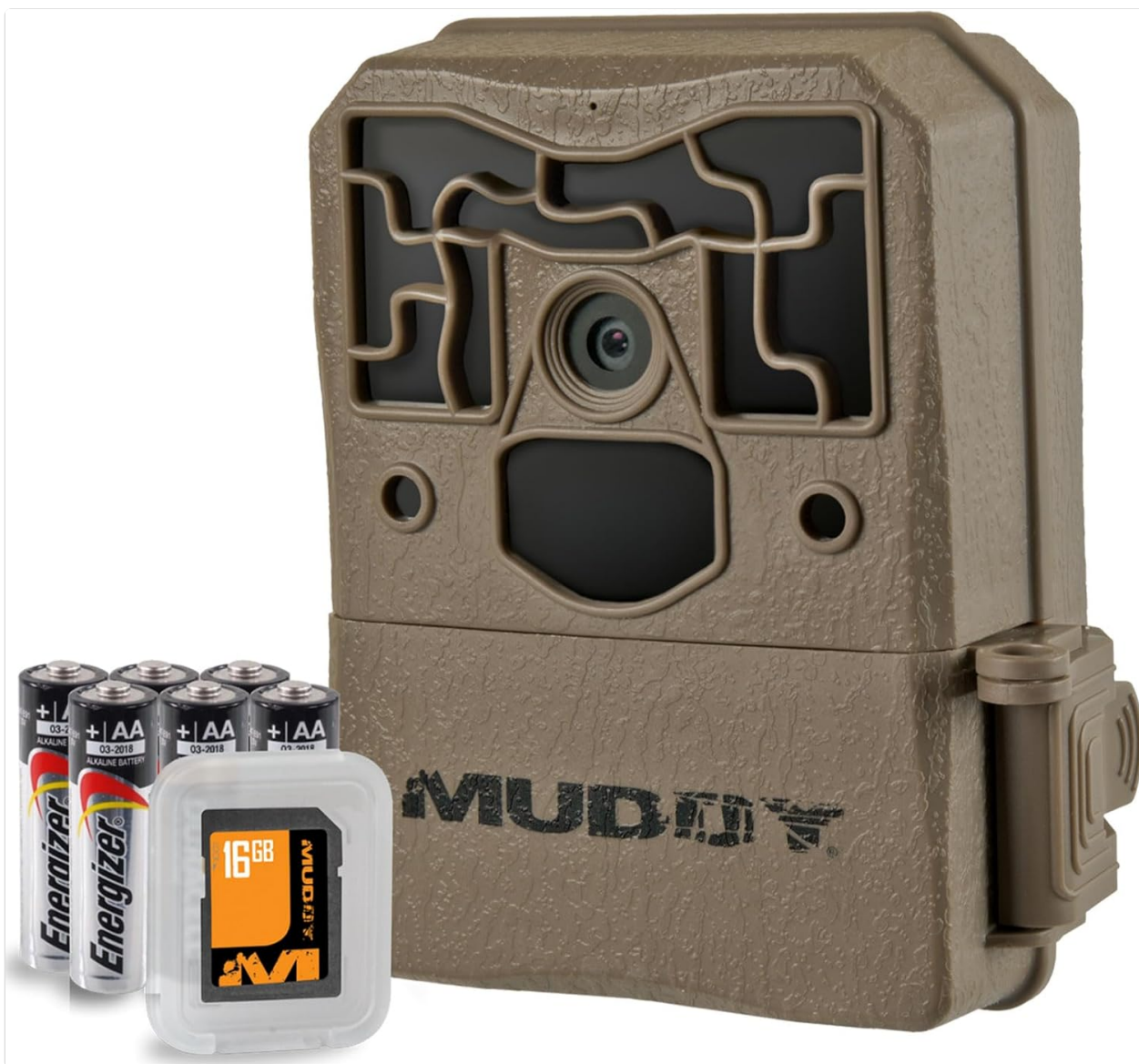
Image: The Muddy Pro Cam 18 Bundle, featuring the trail camera, six AA batteries, and a 16GB SD card.

The Muddy Pro Cam 18 Bundle is a high-performance trail camera system designed for outdoor scouting and monitoring. This bundle includes the 18MP Pro Cam trail camera, a 16GB SD card, and six AA batteries, providing a complete solution for capturing high-quality images and videos in various outdoor conditions. Its robust design and advanced features make it an ideal tool for wildlife observation and property surveillance.