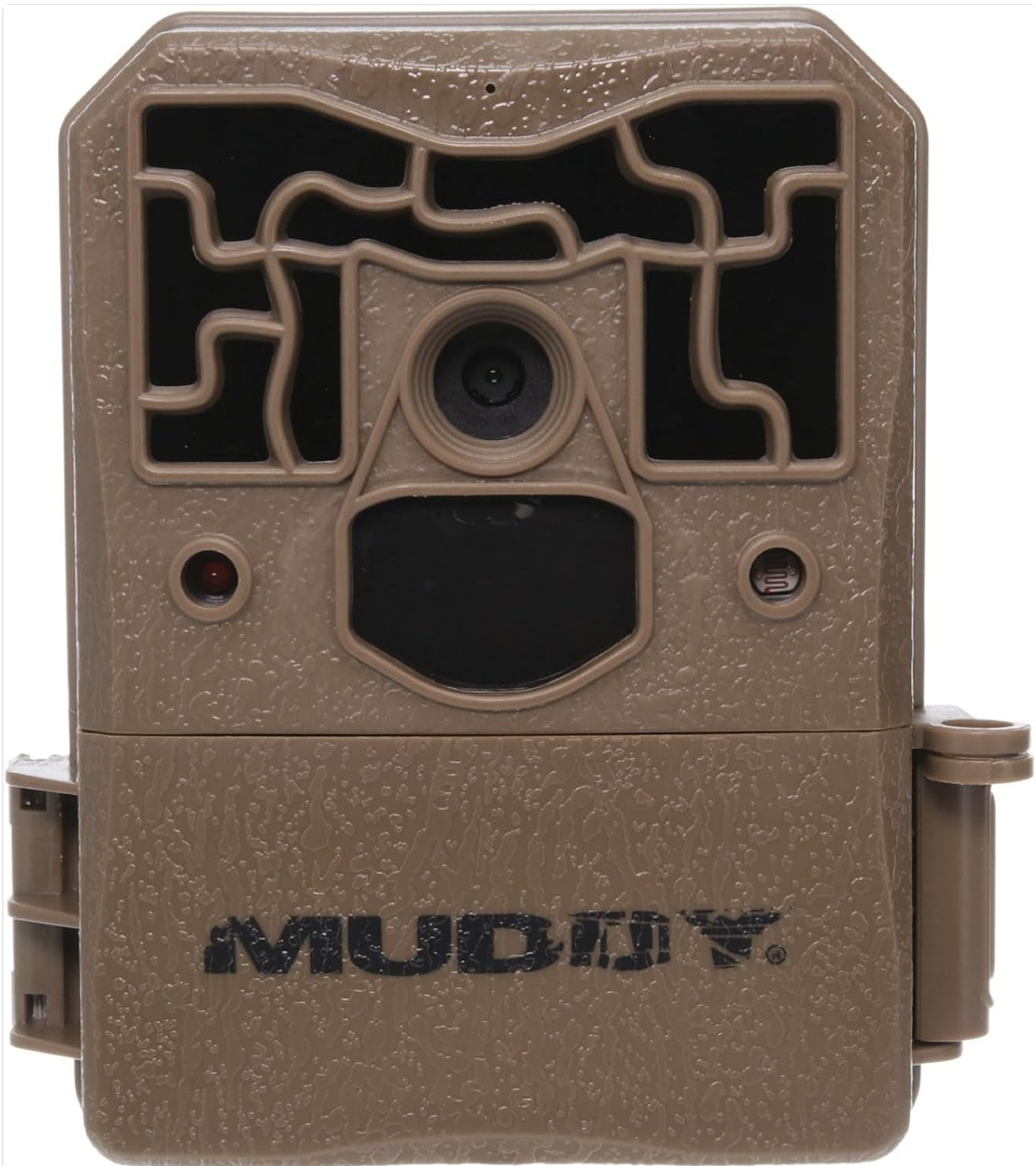
Image: Front view of the Muddy Pro Cam 18 trail camera, showing the lens and IR emitters.