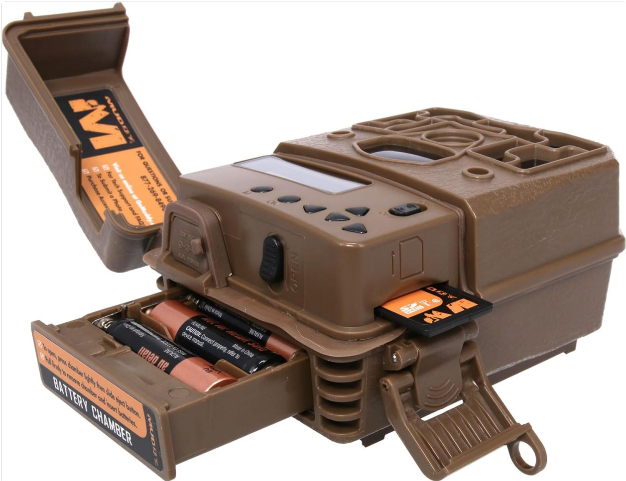
Image: The Muddy Pro Cam 18 with batteries and the SD card correctly installed in their respective compartments.