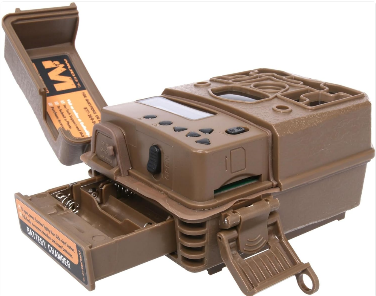
Image: The Muddy Pro Cam 18 with its battery chamber open, ready for battery insertion.