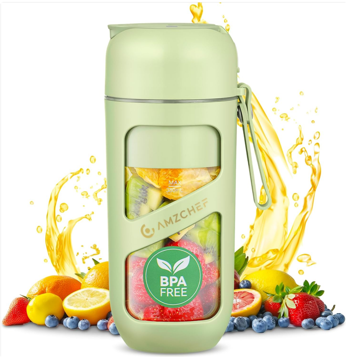
Image: The AMZCHEF Portable Blender, shown with various fruits around it, highlighting its use for fresh beverages.