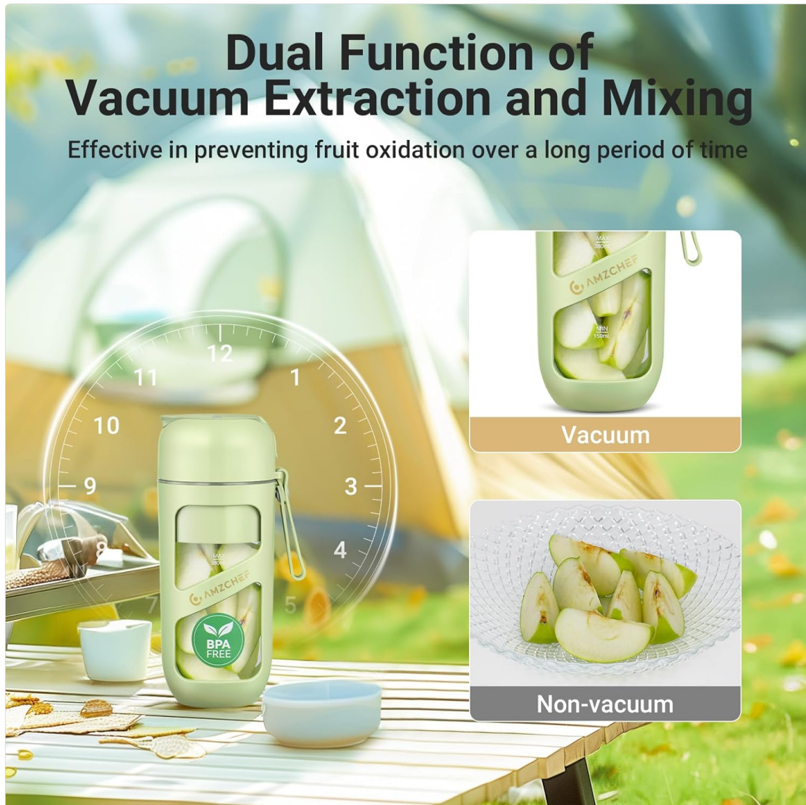
Image: Diagram illustrating the dual function of vacuum extraction and mixing, showing how vacuum prevents fruit oxidation.

The AMZCHEF Portable Blender features vacuum extraction technology to minimize oxidation, keeping your smoothies fresher and more nutritious for longer, while preventing separation and foam formation.