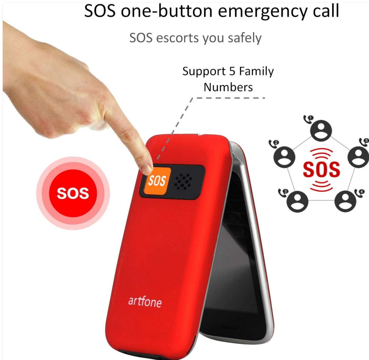
Figure 4.1: Using the one-button SOS emergency call feature.