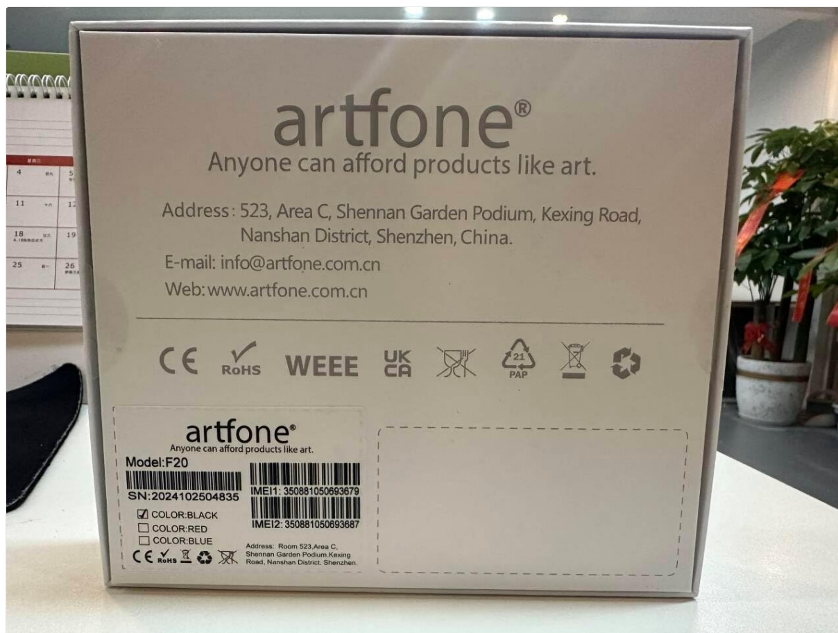
Figure 9.1: Manufacturer contact details from product packaging.