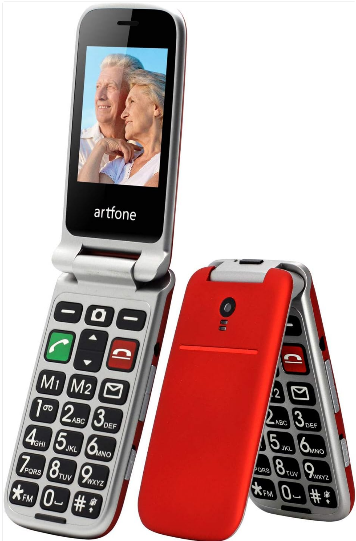
Figure 1.1: The artfone CF241A Flip Phone, showcasing its design with large buttons and a clear display, suitable for easy use.