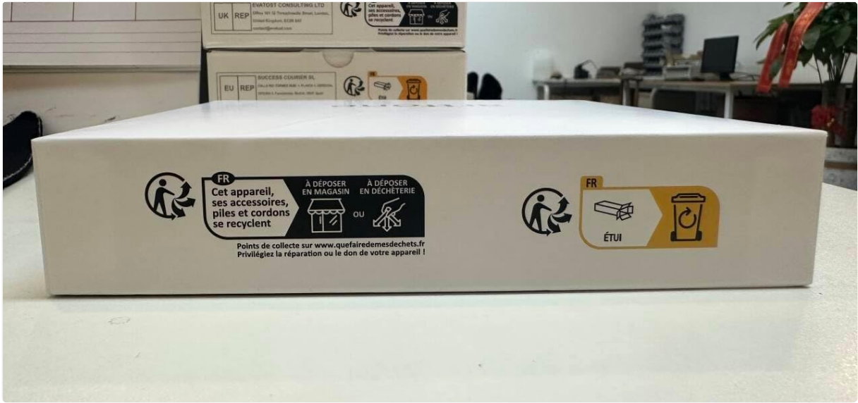
Figure 5.1: Recycling information for the product and its components.