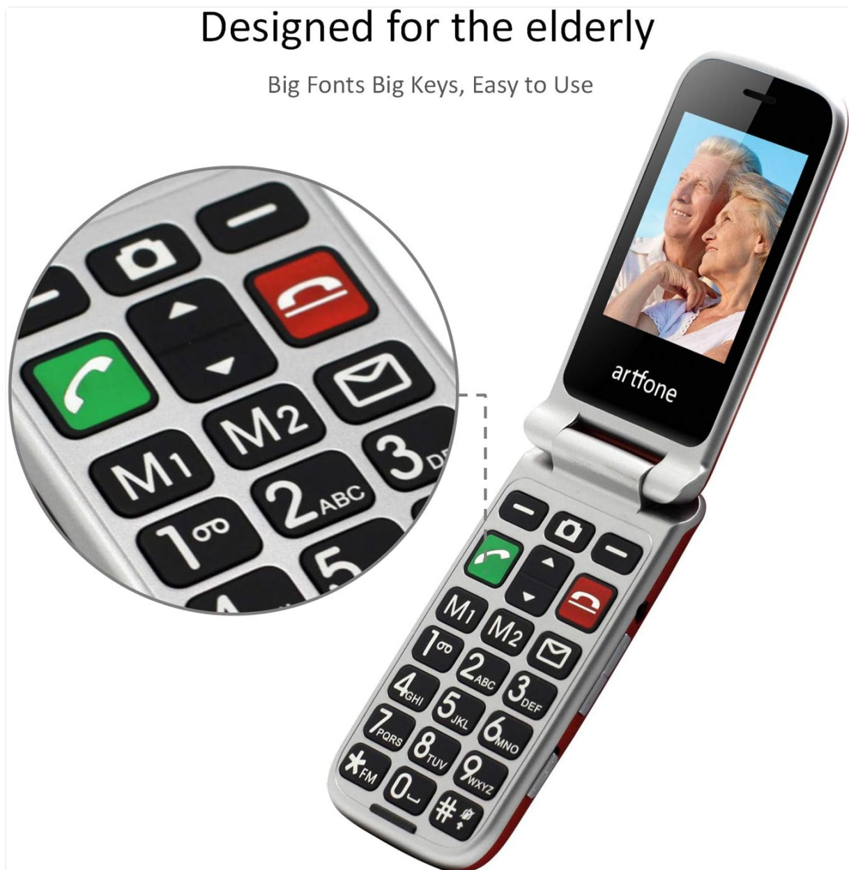
Figure 2.1: Detail of the large, easy-to-read buttons and clear display of the artfone CF241A.