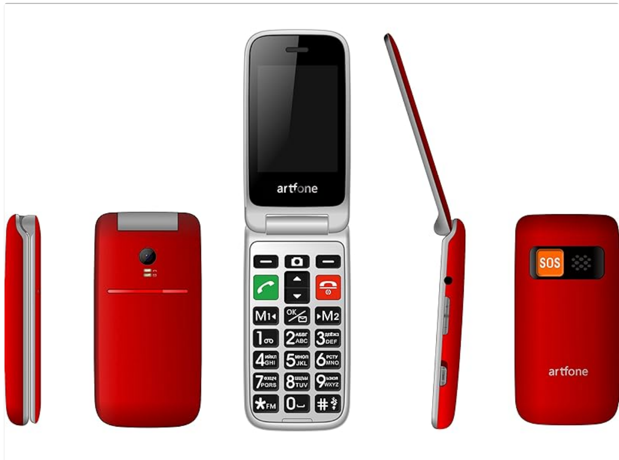
Figure 2.2: Overview of the artfone CF241A's features, including battery, flashlight, and user-centric design.