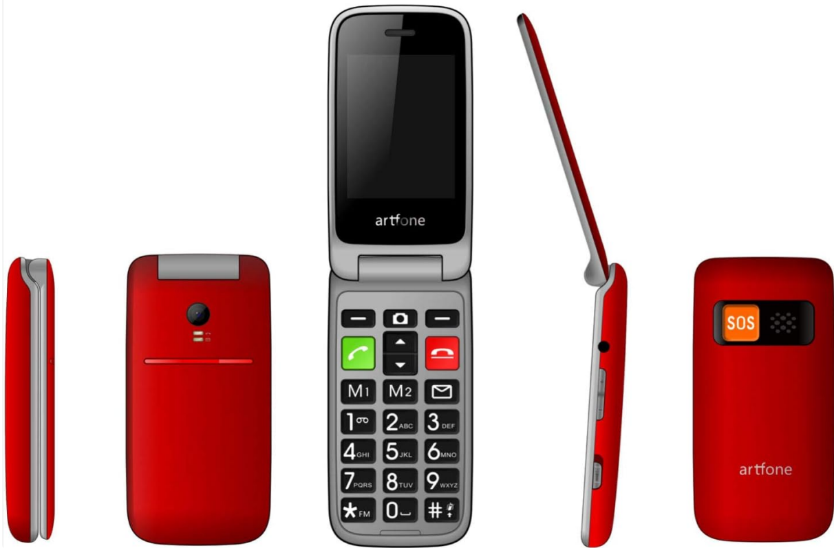
Figure 7.1: Physical dimensions of the artfone CF241A.

Dimensions: 4.01 inch(L)x2 inch(W)x 0.69 inch(T)