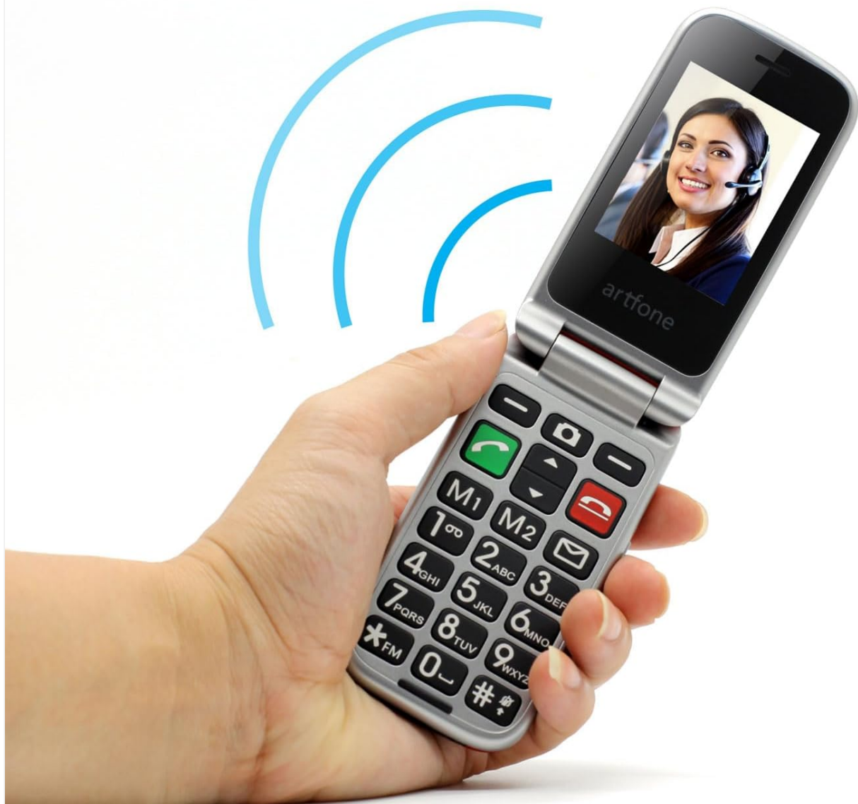
Figure 4.4: The voice number broadcast feature in action.

Easy to use for very clear voice playback