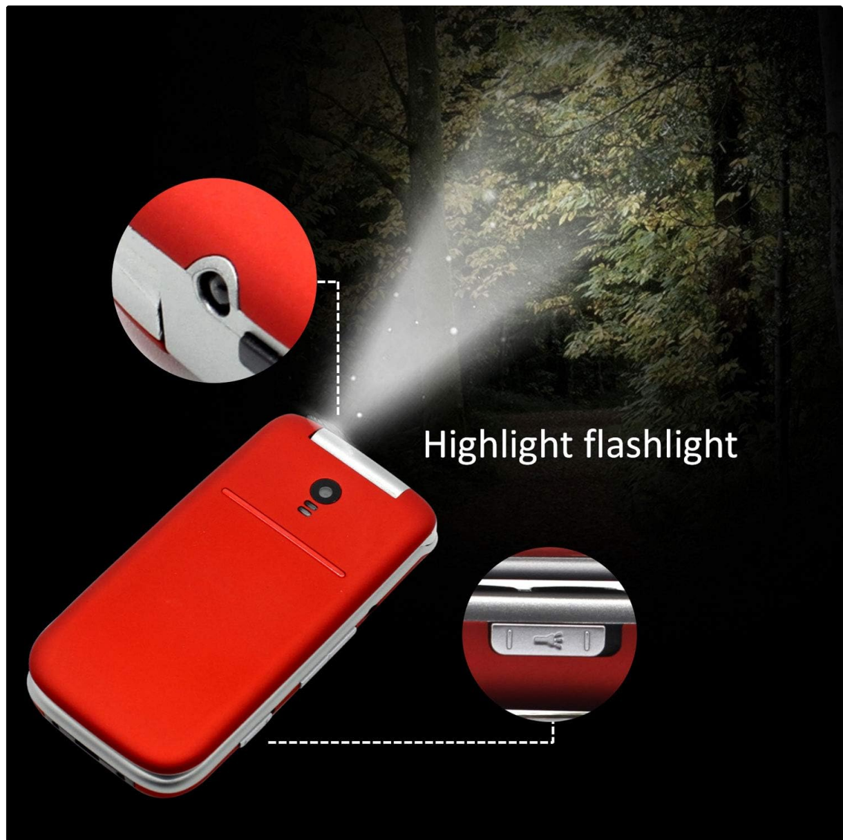
Figure 4.3: The integrated flashlight feature in use.