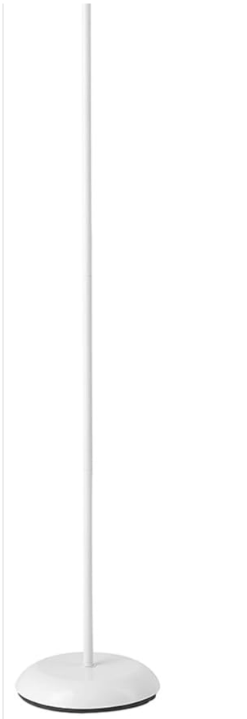
Image 1: The Globe Electric 67136 Torchiere Floor Lamp in matte white with frosted shades.