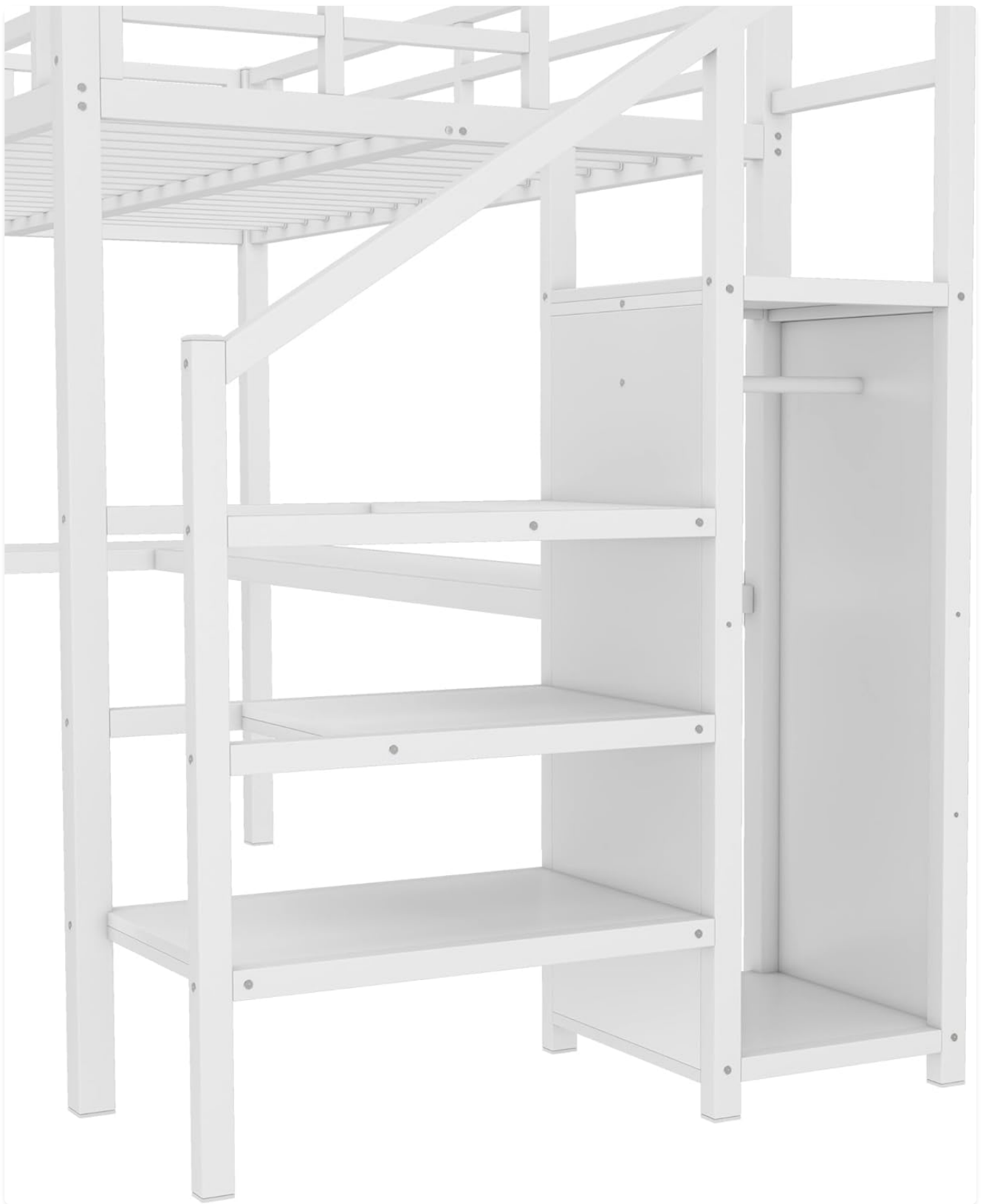
Figure 4: Detail of the staircase storage and wardrobe interior.

This image provides a closer look at the functional staircase, revealing the storage compartments within each step, and the interior of the wardrobe section, including the hanging rod and adjustable shelf.