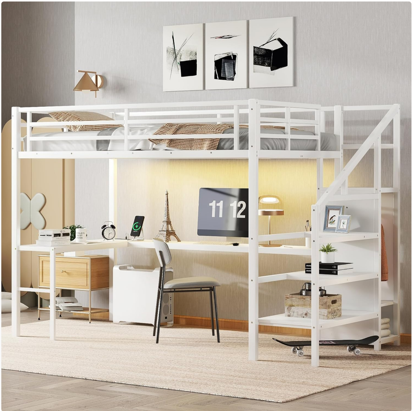
Figure 1: Overall view of the Twin XL Loft Bed with L-Shaped Desk and Wardrobe.

This image displays the complete loft bed setup, highlighting the upper sleeping area, the L-shaped desk underneath, and the integrated staircase with storage and wardrobe. The white finish and modern design are visible.