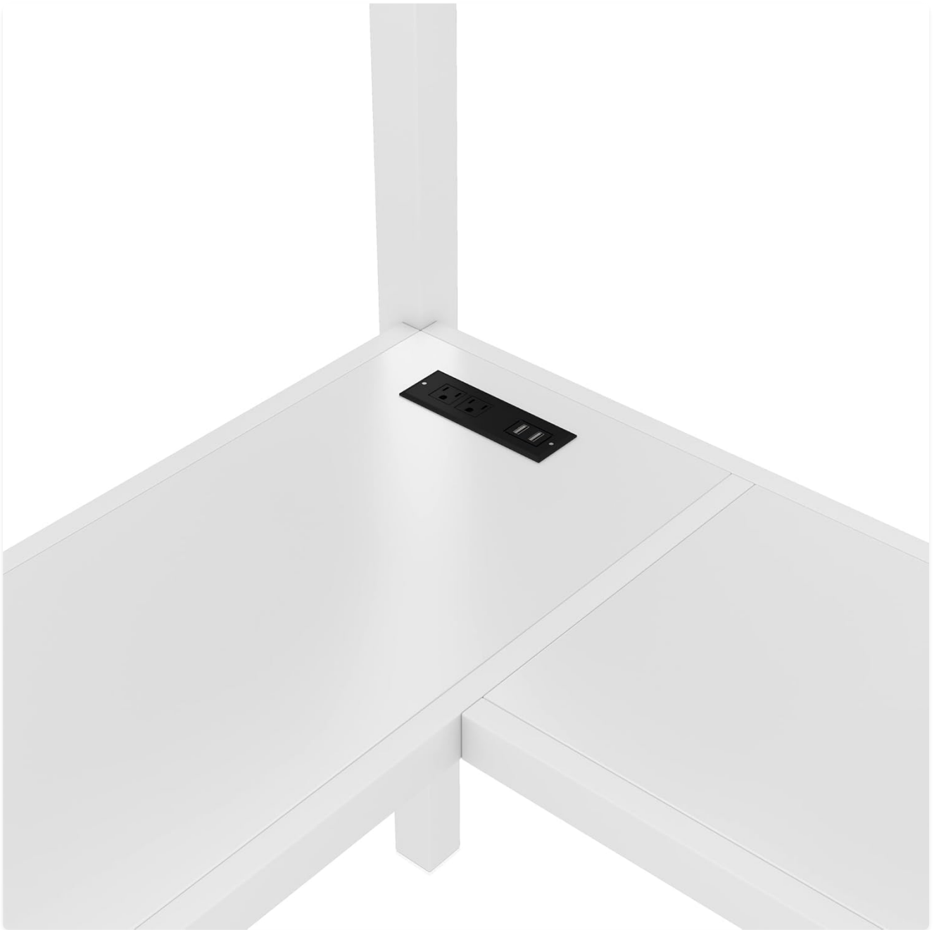
Figure 3: Detail of the integrated USB charging station.

This image shows a close-up of the USB charging station and power outlets embedded in the L-shaped desk surface, providing convenient access to power for electronic devices.