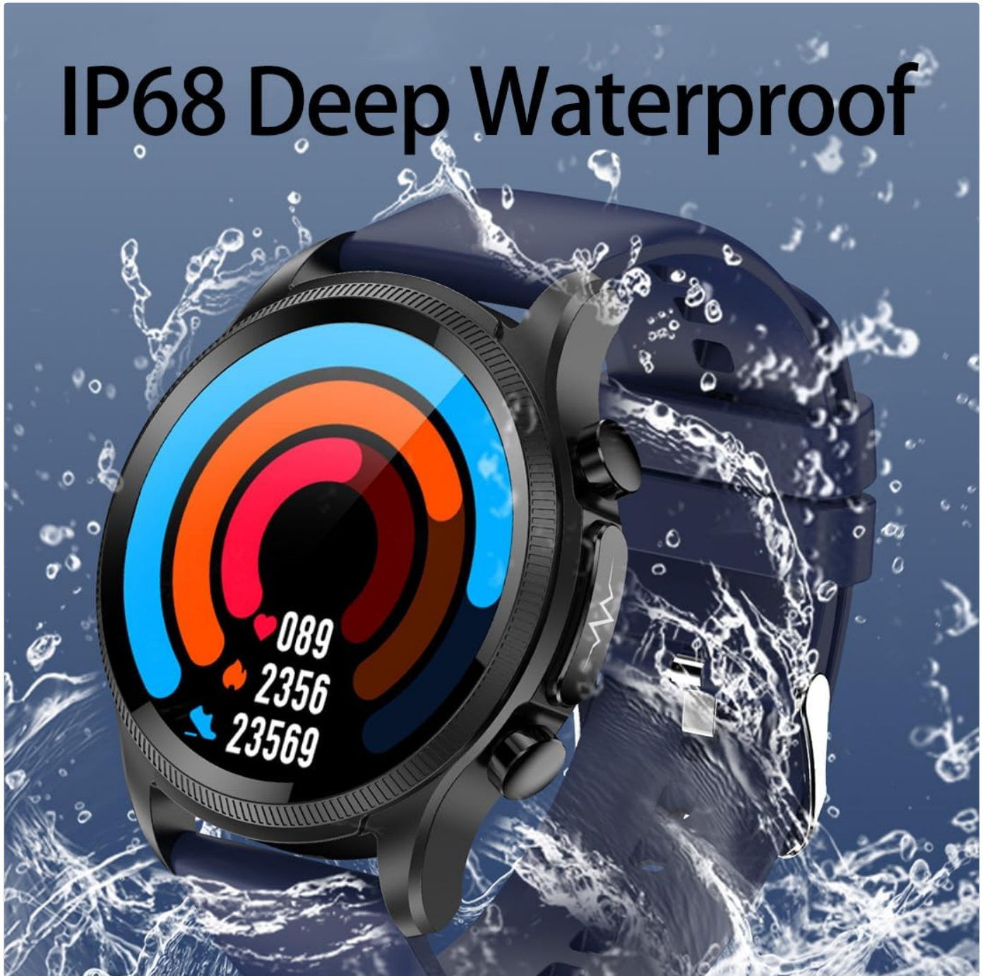
Image 8.1: The Aptofit Trackpro Watch submerged in water, illustrating its IP68 deep waterproof rating, suitable for various daily activities.

up to 1.5 meters for 30 minutes. It is suitable for daily use, hand washing, and light rain. However, it is not recommended for hot showers, saunas, or diving, as steam and hot water can damage the seals.