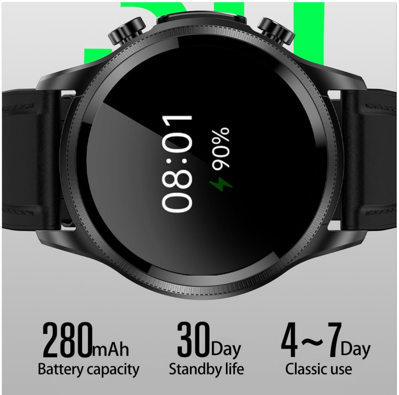
Image 3.1: Visual representation of the watch's battery capacity (280mAh), standby life (30 days), and classic use duration (4-7 days), indicating long-lasting performance.