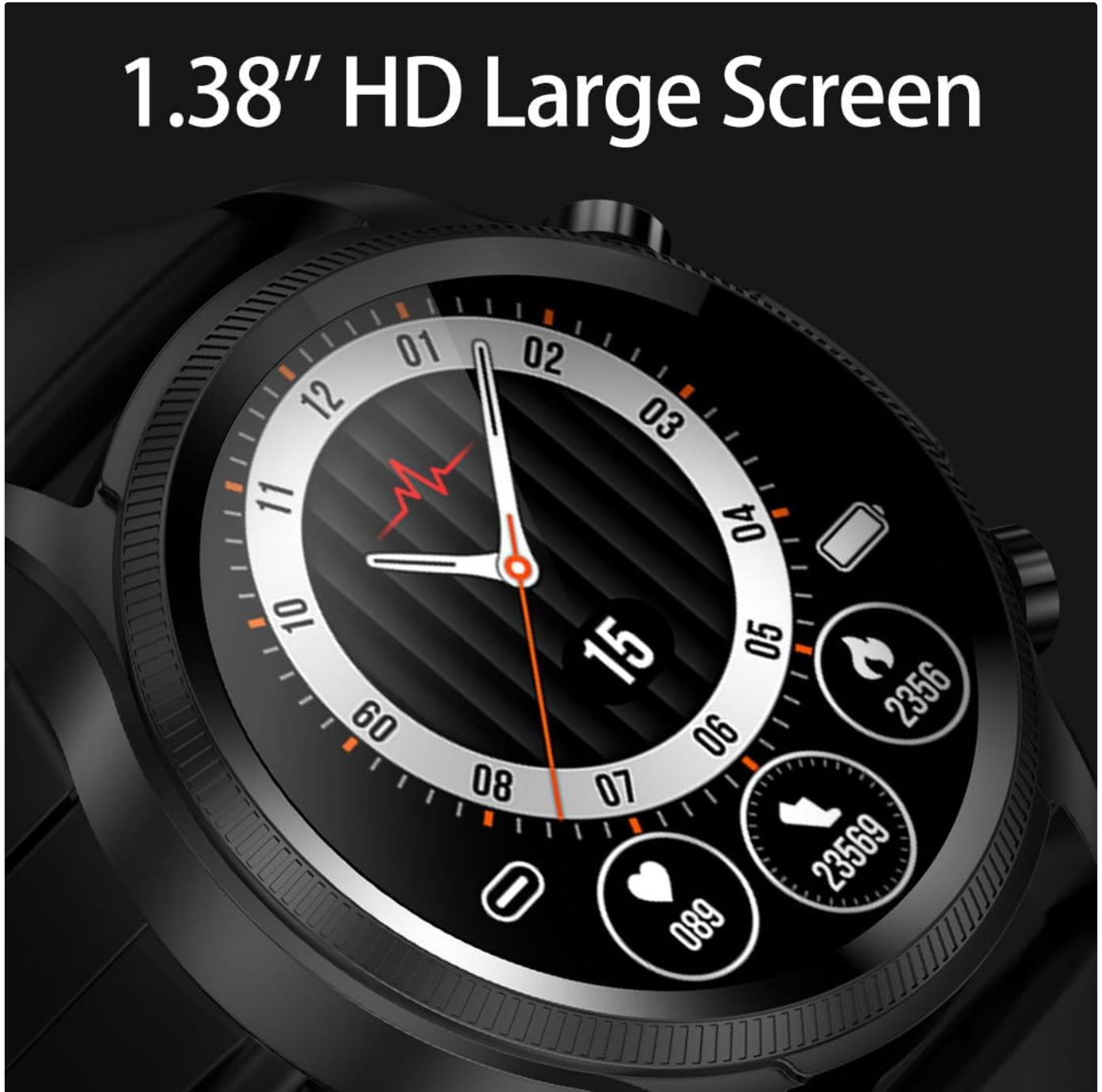
Image 4.1: Close-up view of the watch's 1.38-inch HD large screen, showcasing its clear display and vibrant colors.