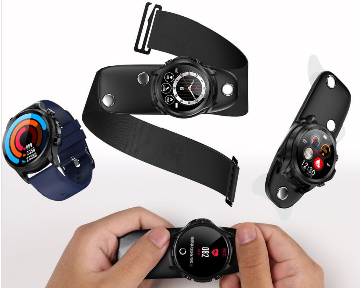
Image 5.1: Illustration of the four different wearing modes for the Aptofit Trackpro Watch: wrist, handheld, heart rate belt, and chest patch detection, emphasizing comprehensive and accurate monitoring.

Supports heart rate belt, bracelet detection, chest patch detection, handheld detection, four wearing modes, all-round more accurate!