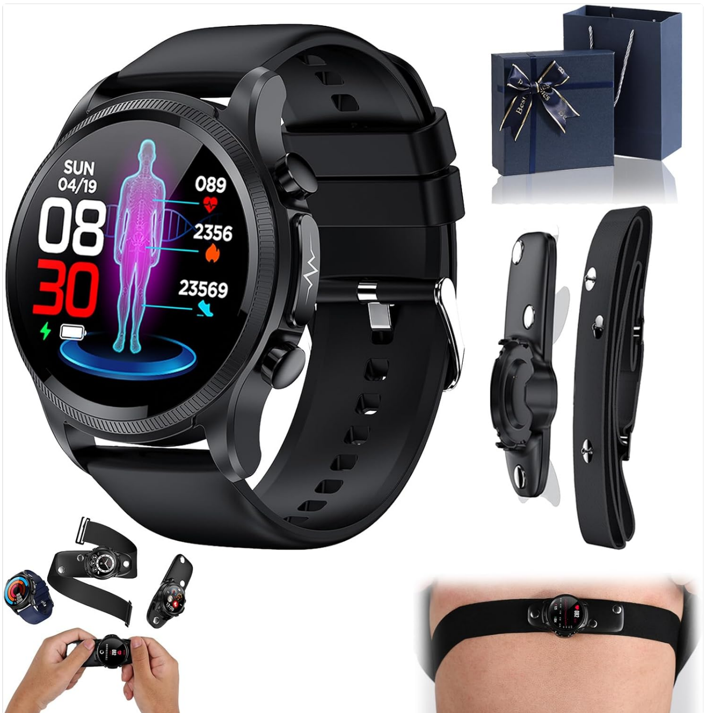
Image 2.1: A complete view of the Aptofit Trackpro Watch package contents, including the smartwatch, EGC-Bandages, chest stickers, and gift bags.