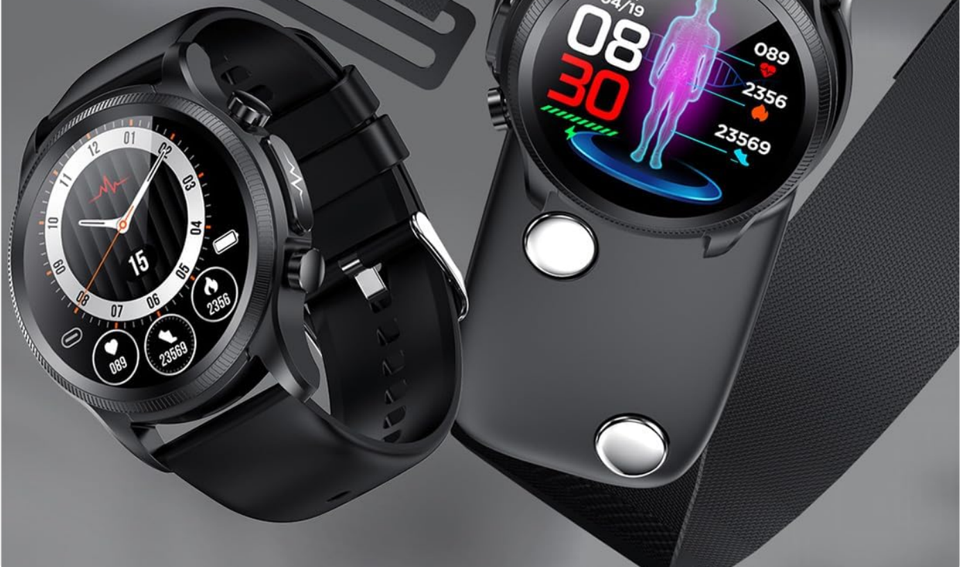
Image 1.1: The Aptofit Trackpro Watch, highlighting its capability to accurately measure health metrics. This image shows the watch face displaying health data alongside the text "Aptofit Trackpro Watch Accurately Measures Your Health".