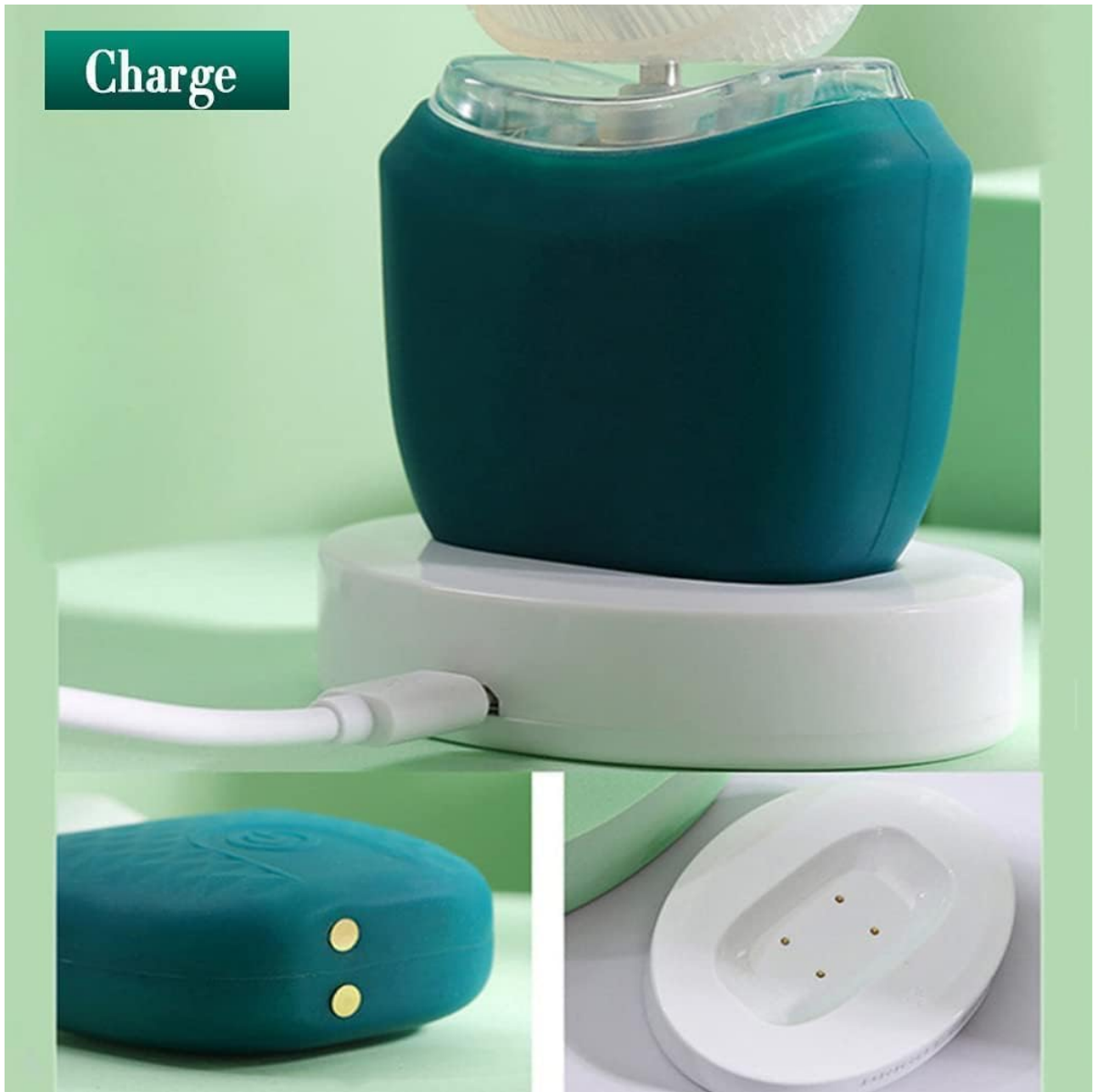
Figure 3: Wireless Charging. This image illustrates the wireless charging mechanism, showing the toothbrush placed on its charging base. The base features charging contacts for convenient power replenishment.