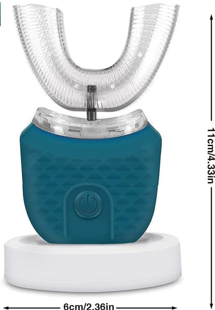
Figure 1: Product Dimensions. This image displays the Automatic Ultrasound Brush, highlighting its compact dimensions of approximately 11 cm (4.33 inches) in height and 6 cm (2.36 inches) in width, making it suitable for various users.