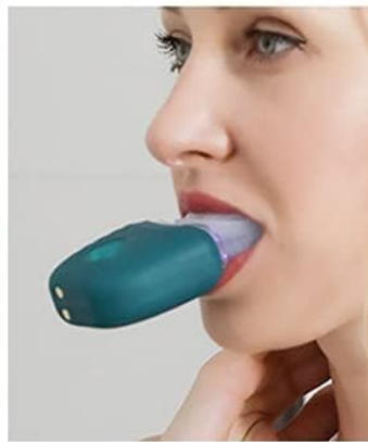
Figure 4: Waterproof Design. This image demonstrates the IPX7 waterproof rating of the toothbrush, showing it being rinsed under water. It also depicts the user placing the U-shaped brush head into their mouth for brushing.