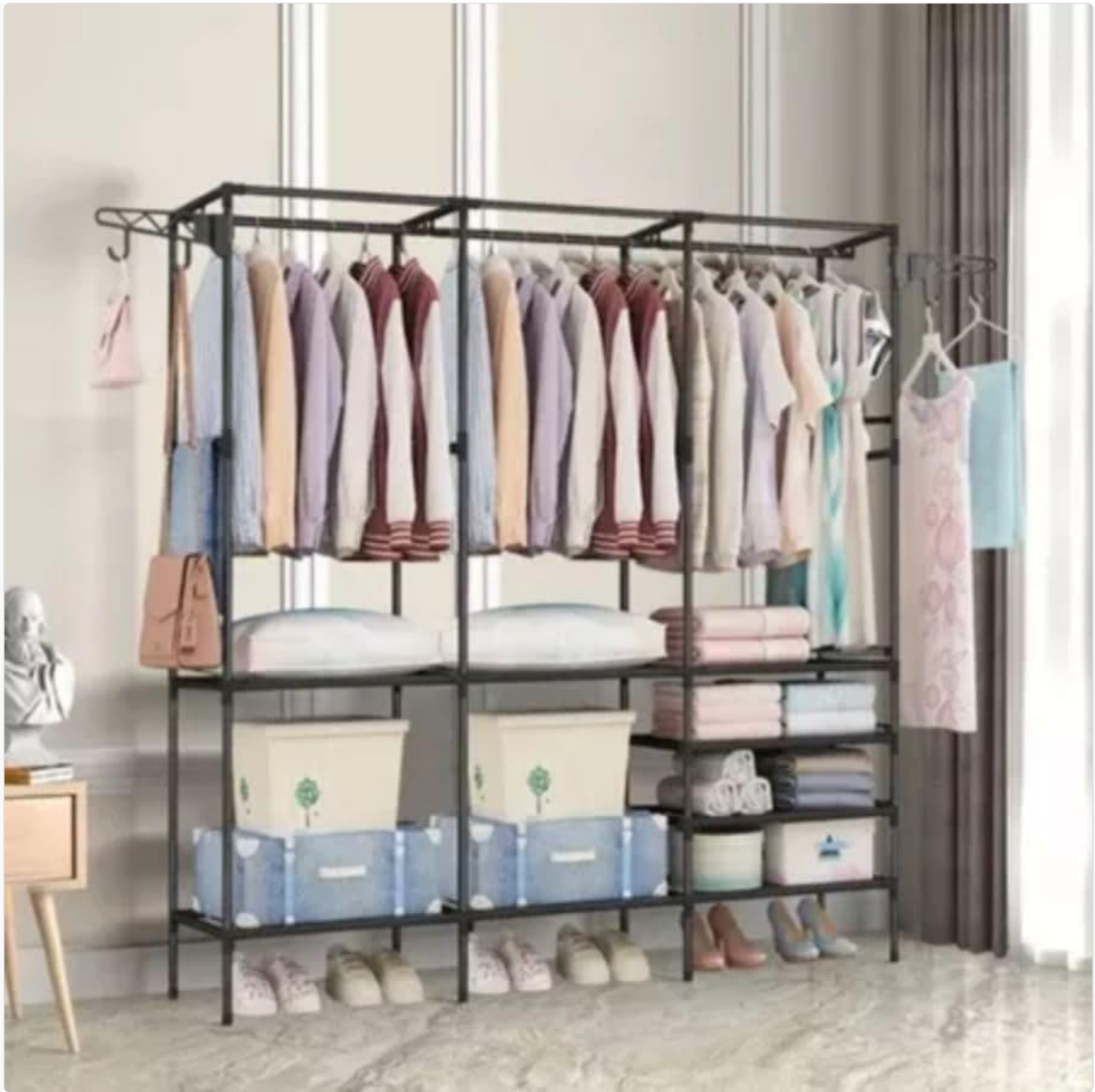
Image 1.1: Fully assembled Triple Clothes Rack Wardrobe, showcasing its capacity for hanging clothes and storing items on shelves.