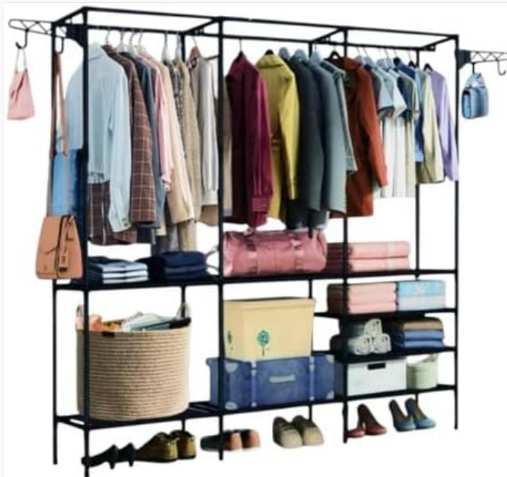
Image 4.1: An example of the assembled clothes rack, illustrating the three hanging bars and multiple shelf levels.