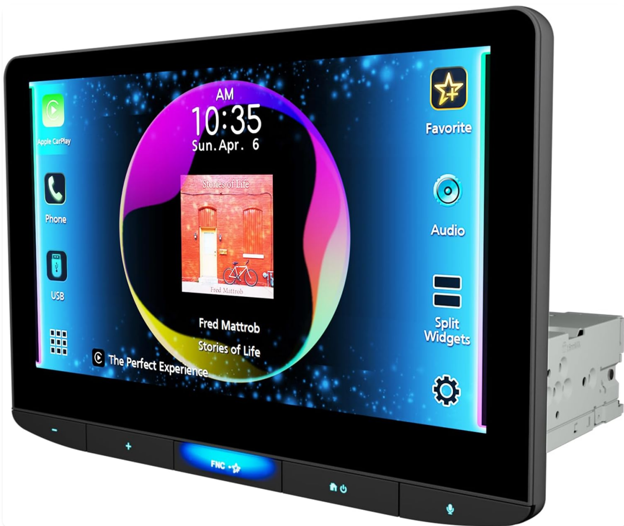
Image: The JVC KW-Z1001W Car Stereo's main display, showcasing its intuitive home screen interface with various functions.