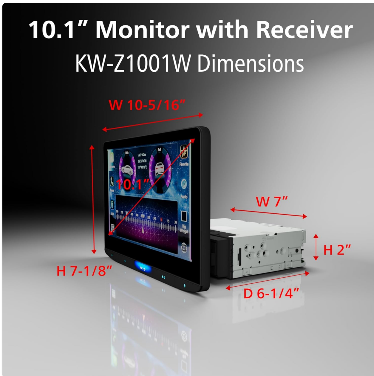
Image: Detailed dimensions of the 10.1-inch monitor and the receiver chassis, crucial for pre-installation planning.