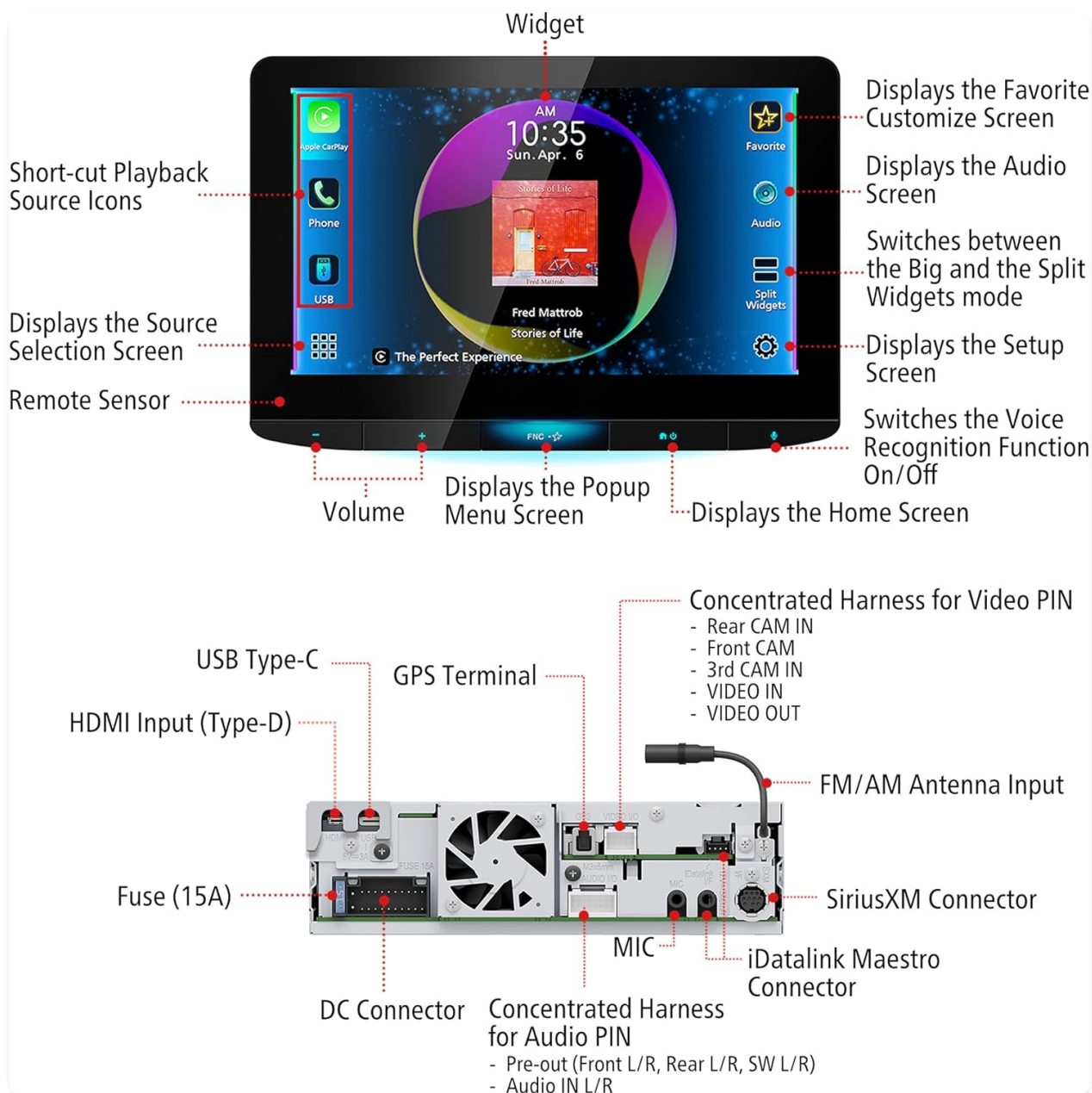
Image: The rear panel of the KW-Z1001W, illustrating the various connection points for power, audio, video, and external devices.