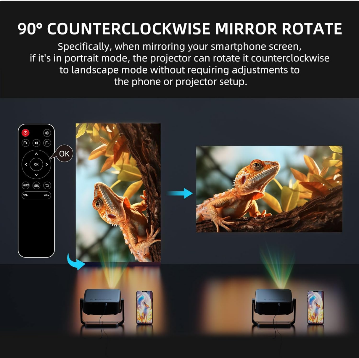
Image: A visual guide demonstrating the 90-degree counterclockwise mirror rotation feature of the ONAYO AY3 Mini

For screen mirroring from your smartphone, the projector supports 90° counterclockwise mirror rotation. This allows you to project content from a portrait-oriented phone screen into a landscape format without needing to adjust the phone or projector setup.