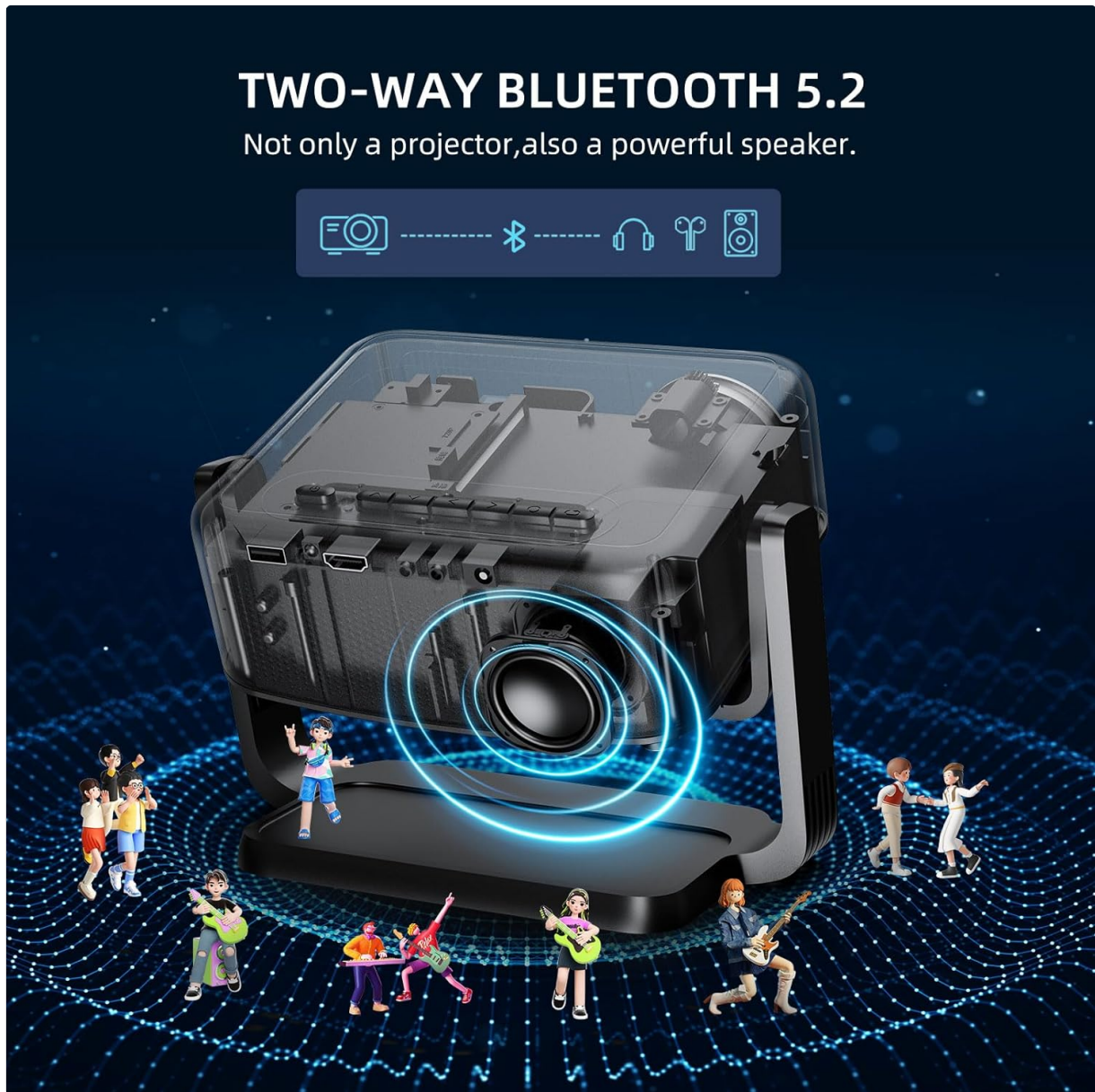
Image: An illustration emphasizing the two-way Bluetooth 5.2 capability of the ONOAYO AY3 Mini Projector, showing it can connect to external Bluetooth devices for audio output or function as a standalone Bluetooth speaker.

The AY3 has a built-in speaker. For a more immersive audio experience, connect external Bluetooth speakers or a soundbar.