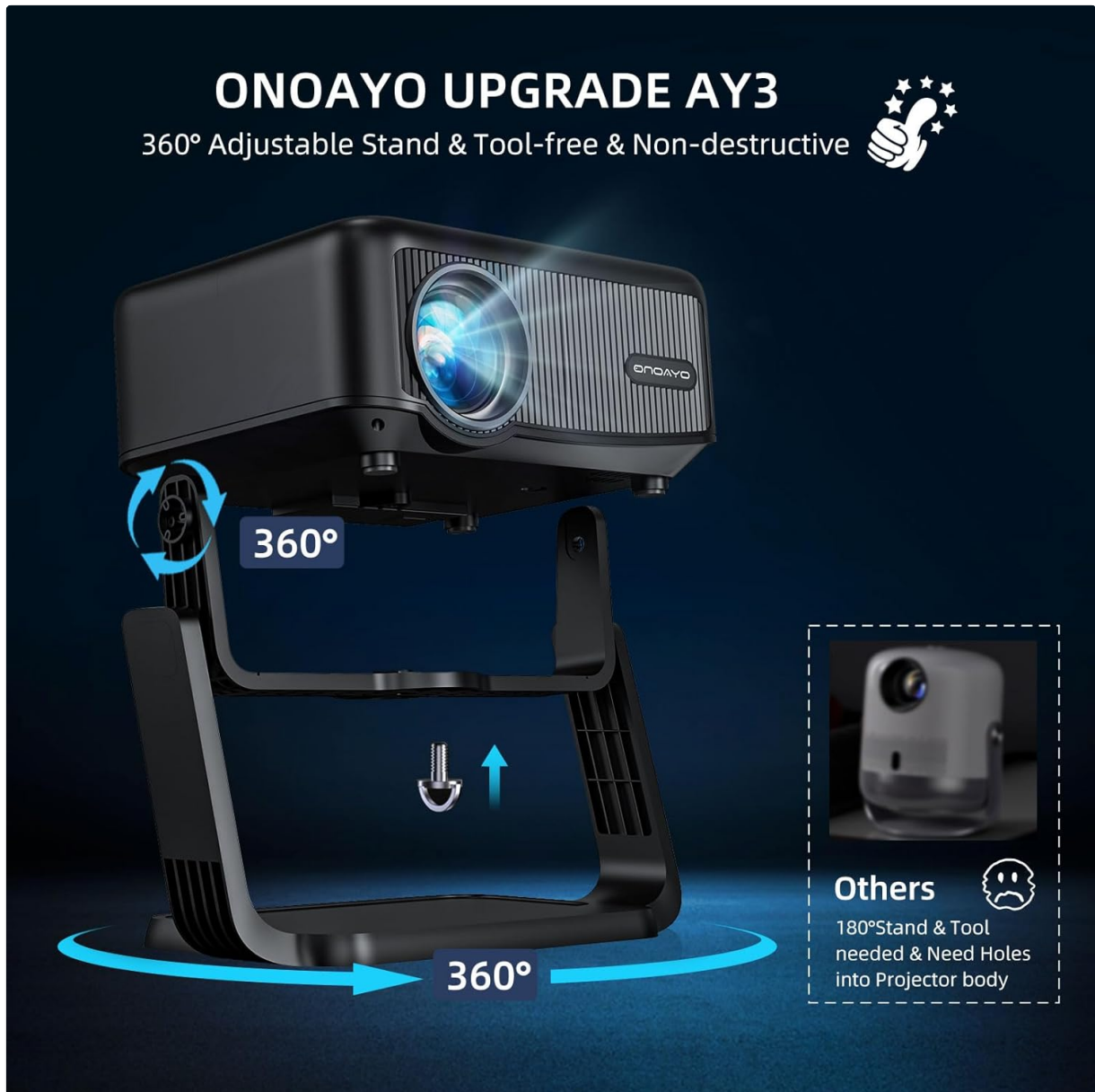
Image: The ONOAYO AY3 Mini Projector shown with its 360-degree adjustable stand, highlighting the tool-free rotation capability. An inset image shows a comparison with other projectors that may require tools and drilling.