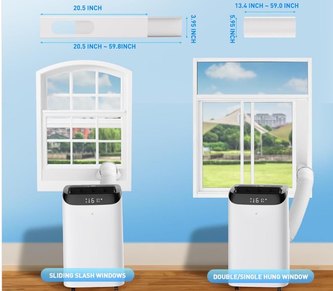
Image: Diagram illustrating the installation of the portable air conditioner's window kit for both sliding and double/single hung windows, showing how the exhaust hose connects.