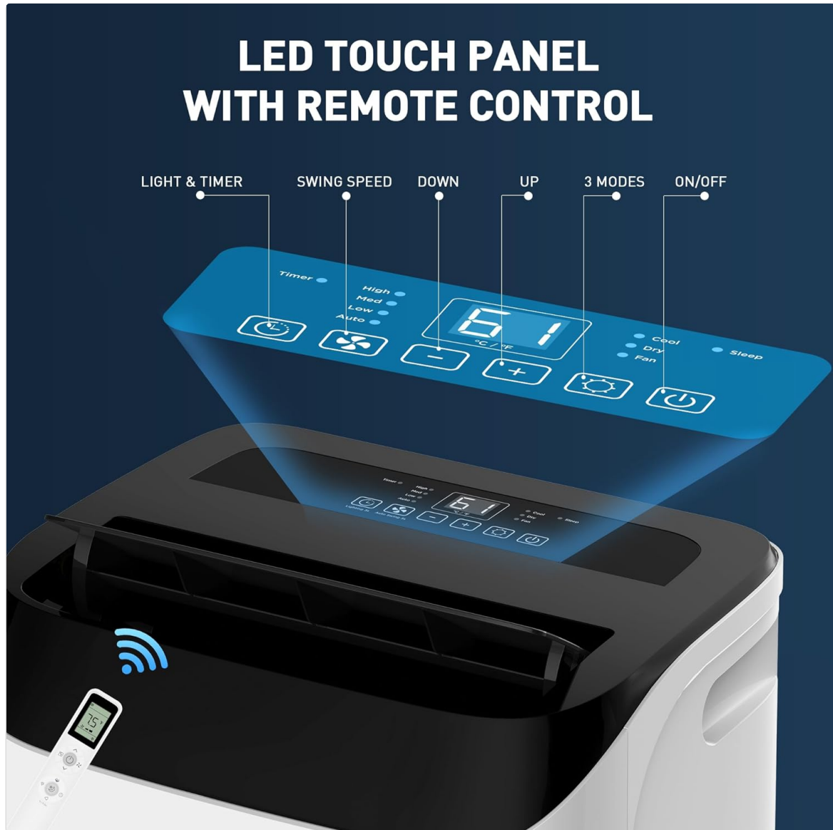
Image: Close-up view of the LED touch panel and remote control, highlighting various functions like timer, swing speed, temperature adjustment, and mode selection.

The unit features a digital display and touch controls on the top panel. A full-function remote control with a 28 ft effective distance is also included for convenient operation. The remote allows you to adjust temperature, mode, fan speed, timer, and activate sleep or turbo modes.