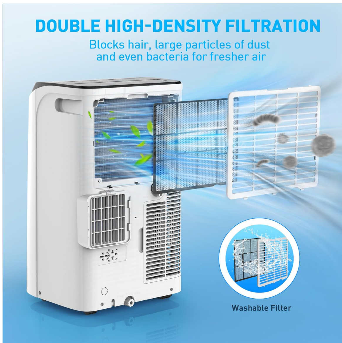
Image: Shows the double high-density filtration system, highlighting how it blocks hair, dust, and bacteria for cleaner air, with a removable washable filter.