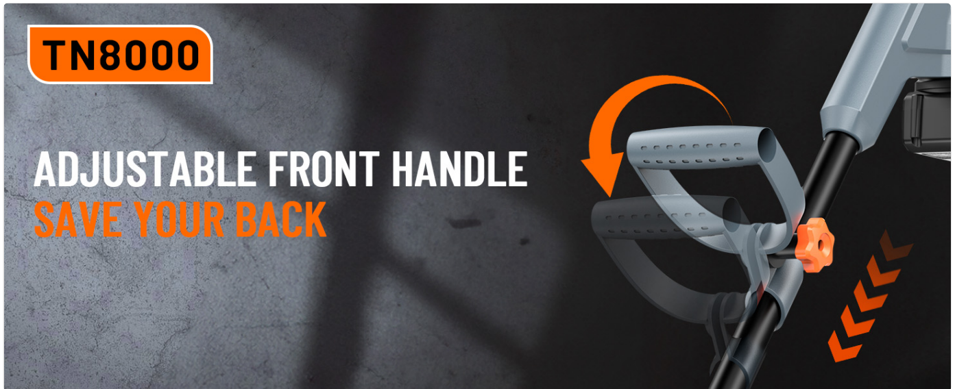
Figure 4.1: Straightforward installation involves inserting the lock knob and rotating to secure the handle sections.