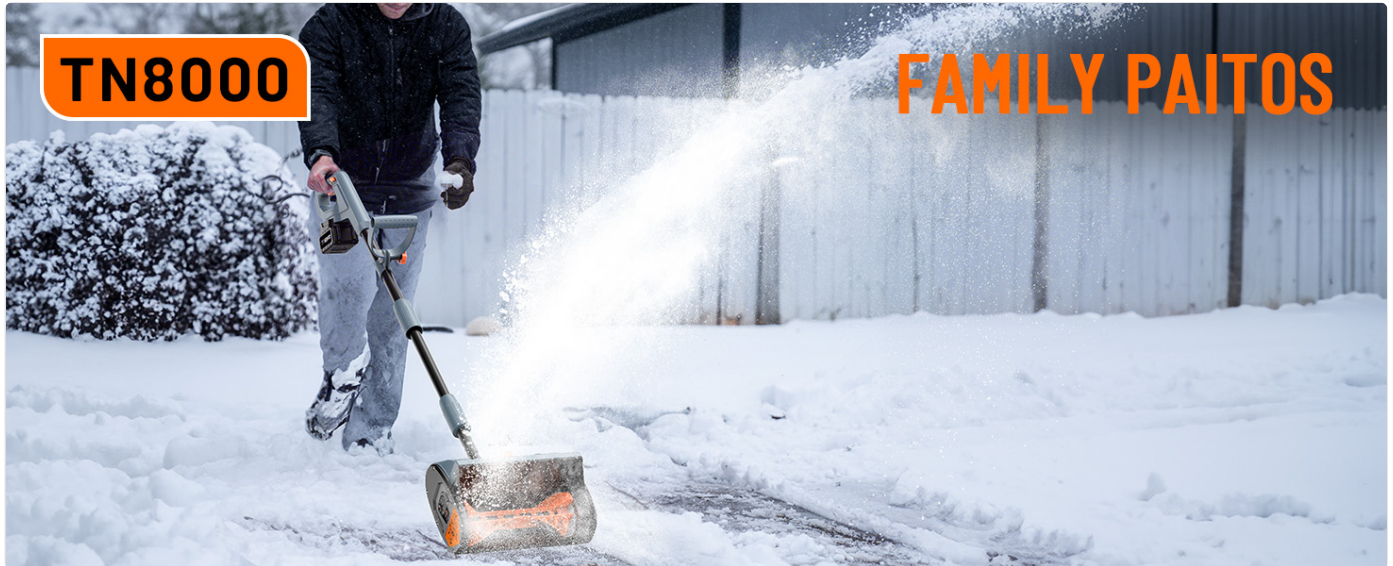
Figure 2.1: The TaskStar TN8000 is designed for legerity and agility, weighing only 9.6 pounds for easy handling.