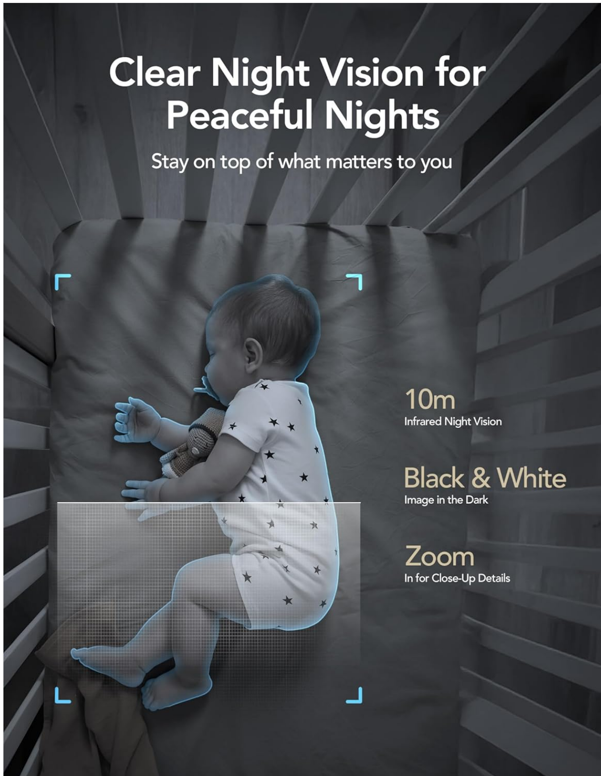
Image: A baby sleeping in a crib, demonstrating the camera's clear night vision capabilities in a dark environment.