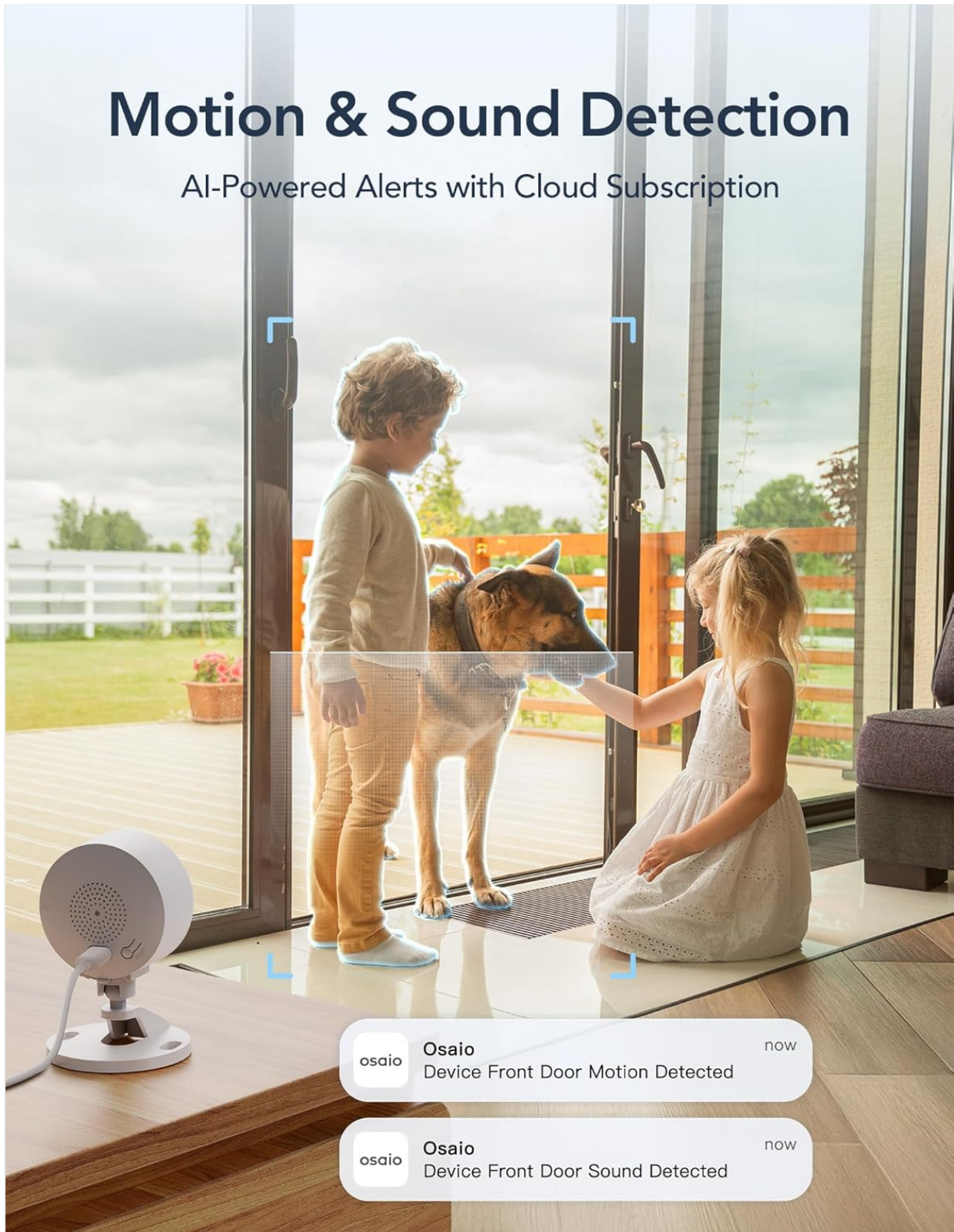
Image: Children and a dog triggering motion and sound detection, with example alert notifications shown.

AI-Powered Alerts with Cloud Subscription