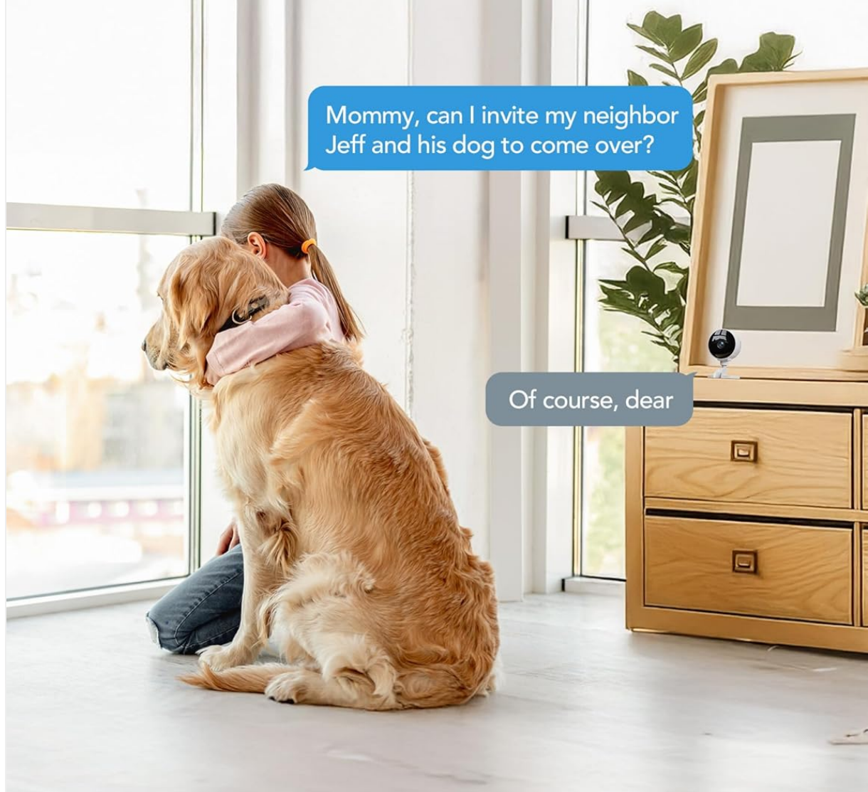
Image: A visual representation of the two-way audio feature, showing a child and a pet, with text bubbles indicating conversation.