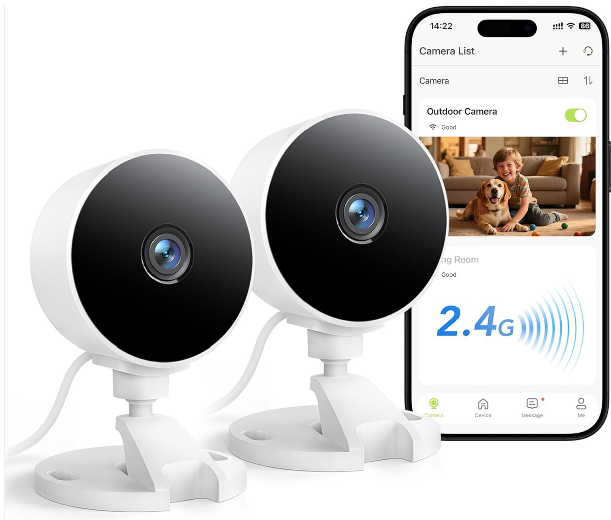
Image: The GNCC camera alongside a smartphone showing the camera's live feed and app interface, demonstrating connectivity.