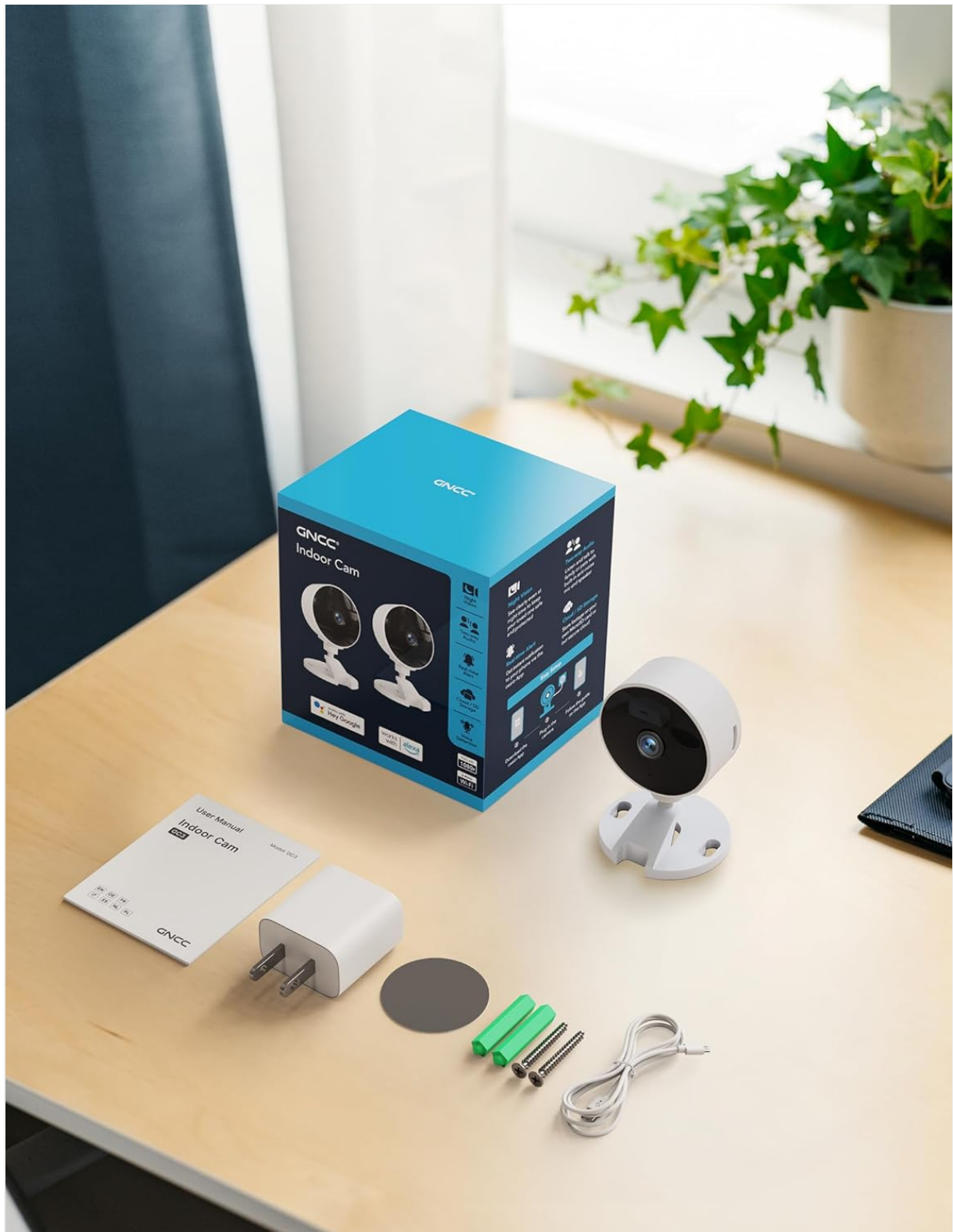
Image: All components included in the GNCC Indoor Camera package, neatly laid out on a wooden surface.