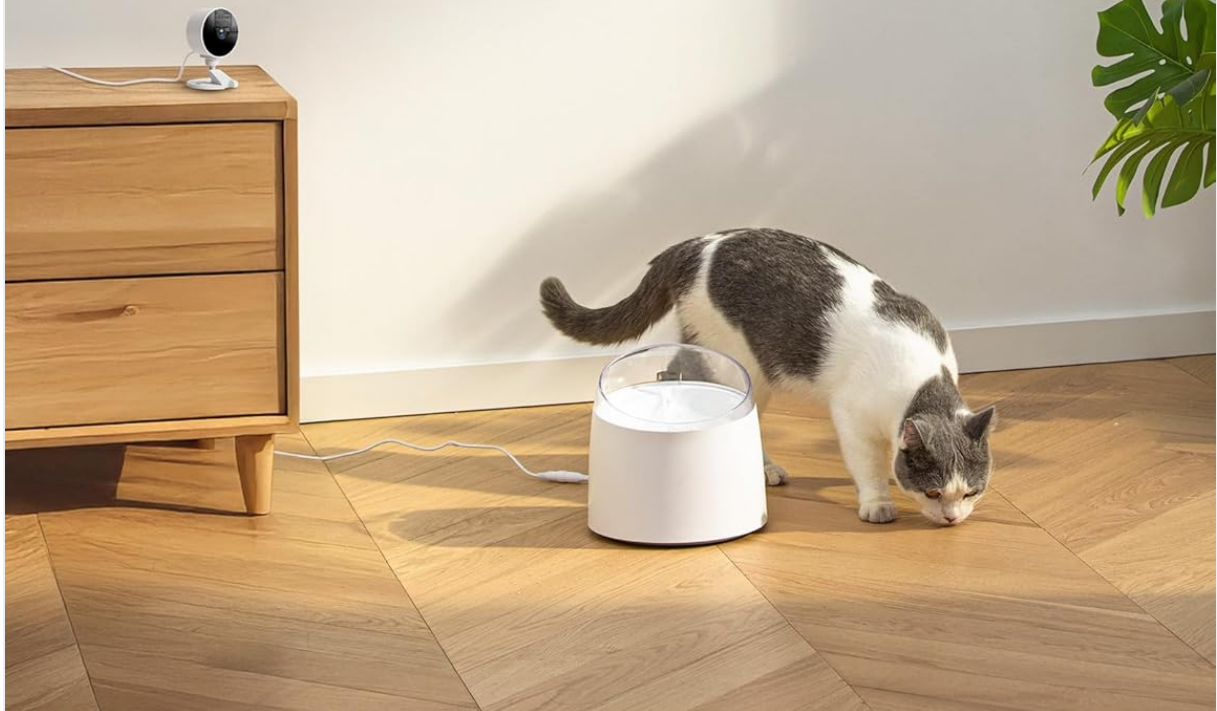
Image: Visual representation of the camera's core functionalities, including HD resolution, night vision, and two-way audio.