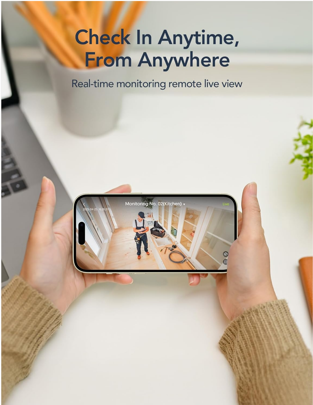
Image: A smartphone screen showing the live feed from the GNCC camera, illustrating remote monitoring capabilities.